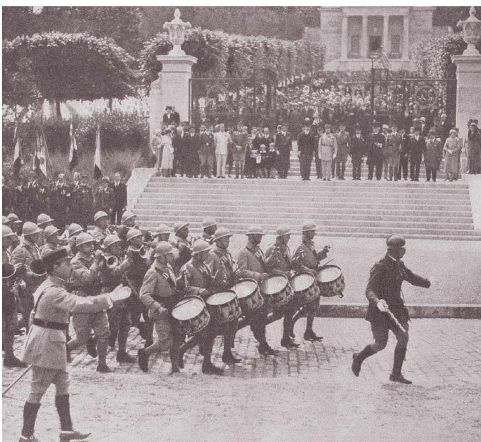
Memorial Day at Surènes Cemetery, near Paris. The "assistance" is about eighty percent French. Away from Paris it is even greater

The United States brought economic, military, and moral reinforcements of inestimable value. The great American army was rapidly organized, and by the summer of 1918, almost 1,000,000 men were in the front line under Pershing. The Americans fought the war as if it were a holy crusade, a crusade for Right and Liberty.