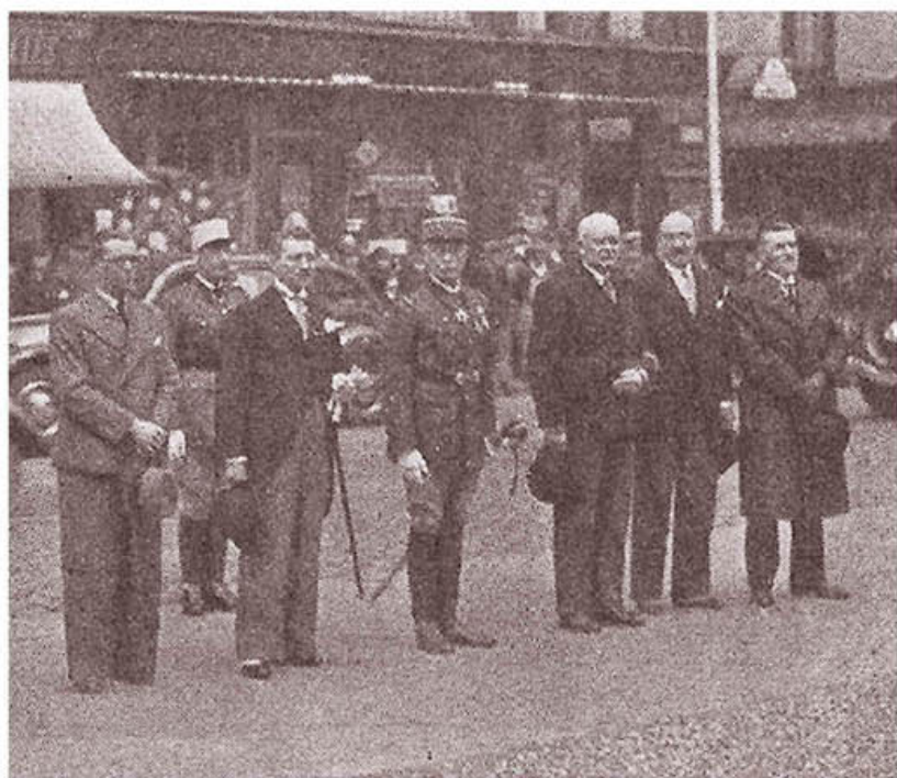
Although there are no American graves in Rouen, America's contribution is remembered regularly.

Thus, every Memorial Day a ceremony is arranged by the French and held in Versailles for