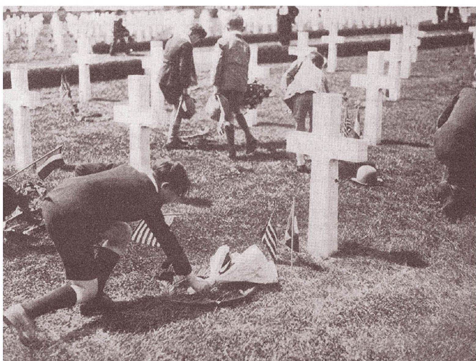
French schoolboys decorating graves in one of the great American cemeteries—Bony, in the Somme area, where 1832 soldiers are buried