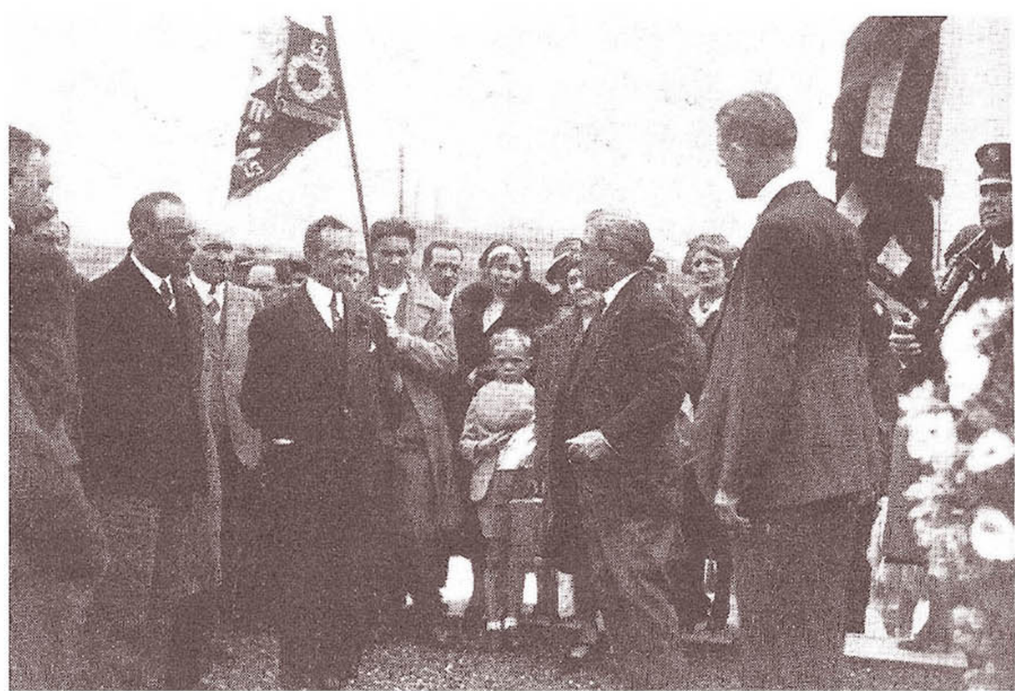
Ceremony in honor of the A.E.F., French in conception and execution, at St. Quentin, in the Somme area

A. E. F. and its contribution to the Allied victory. No matter what the peanut politicians may do (and France, alas, has her share just like the United States), no matter what the prejudiced, partisan press may print, the real France guards its fidelity, its ancient admiration, and its enduring friendship for John W. Doughboy of Hometown, U. S. A.