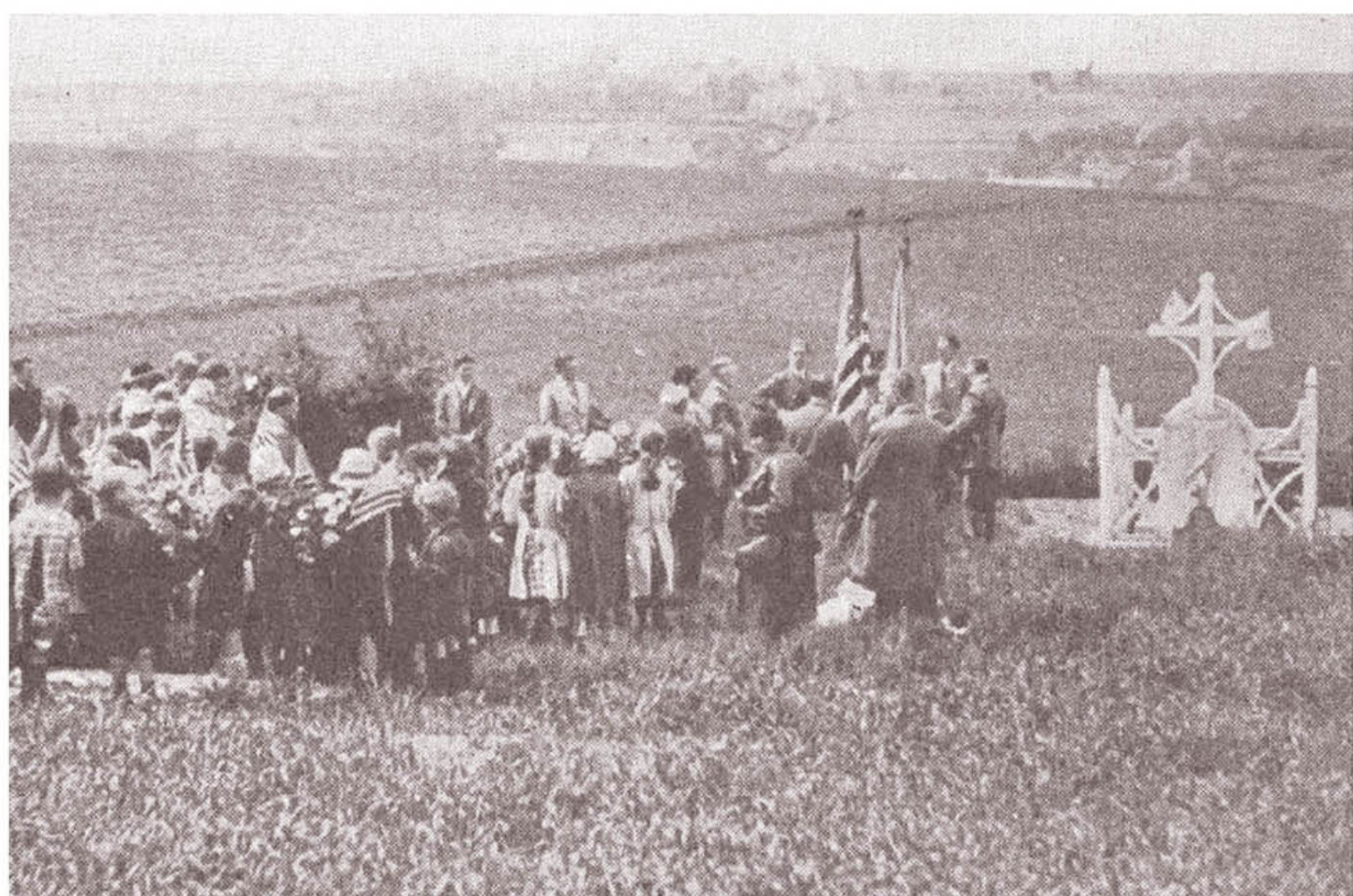
The grave of Quentin Roosevelt is visited faithfully on the anniversary of his death by Legionnaires and folk from the surrounding countryside