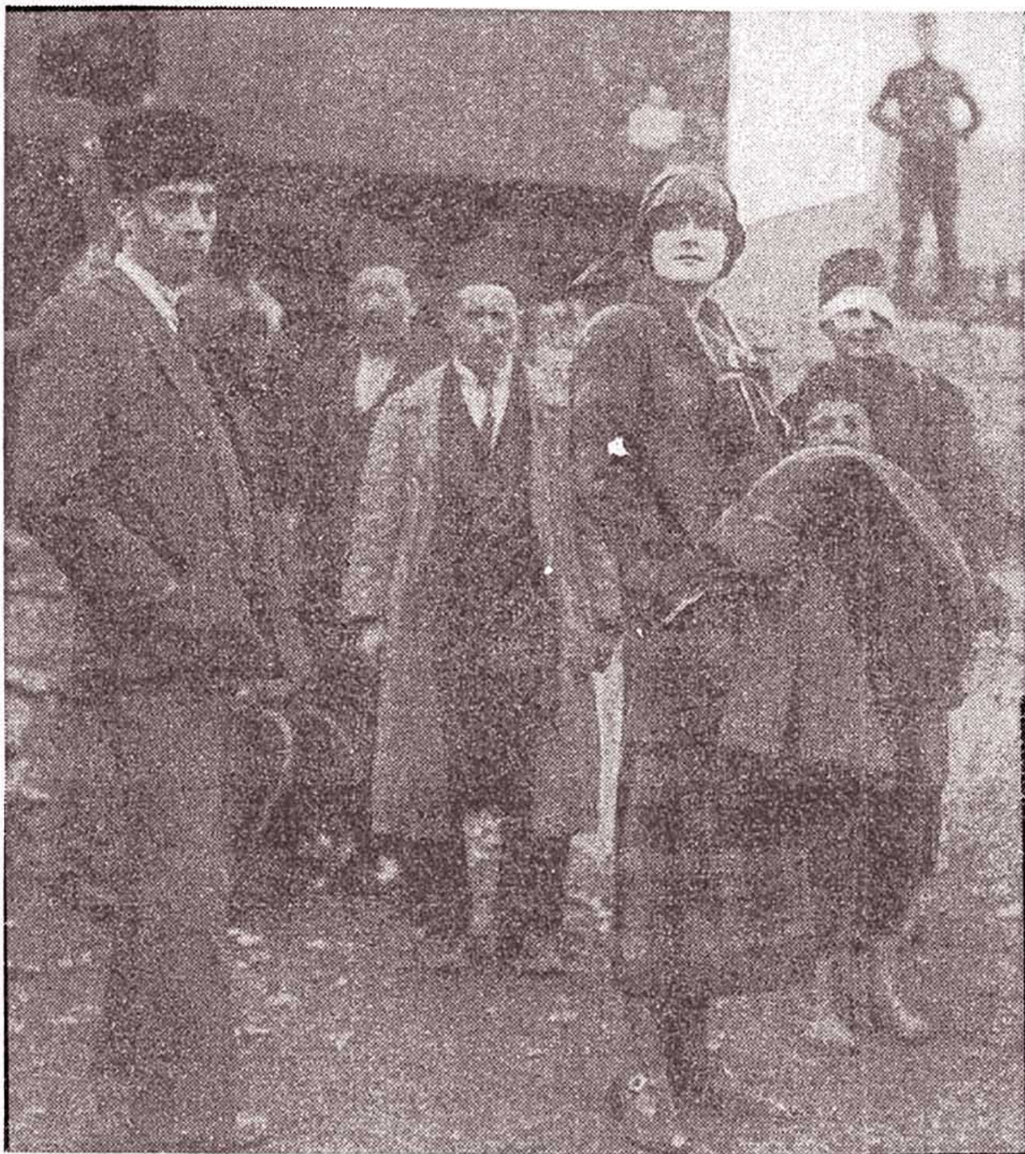
For the first time in her short life Greta Garbo leaves her native Sweden. Here she is at a railway station in Bulgaria on a filming trip to Turkey that ended disastrously