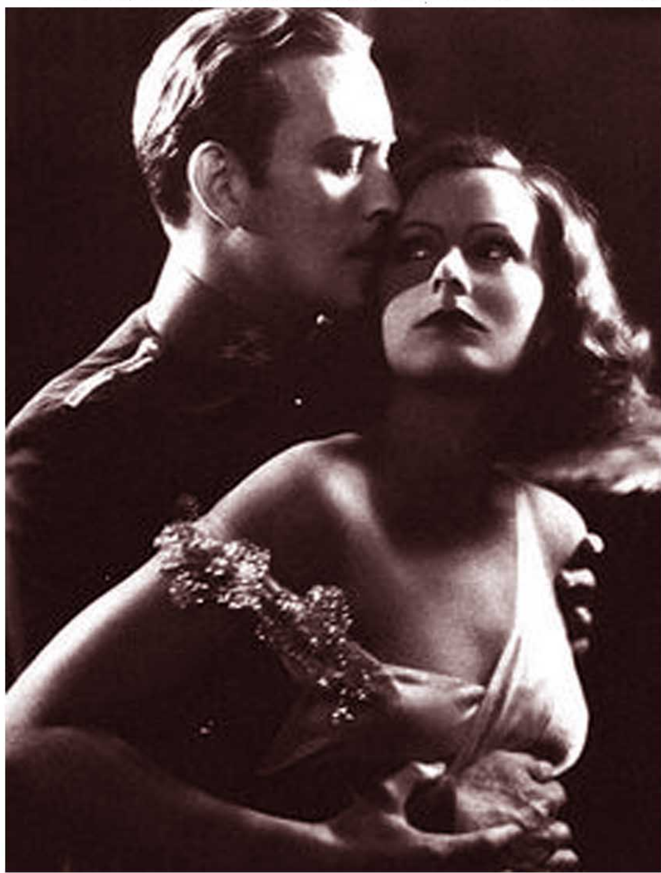
Greta Garbo and John Gilbert in Flesh and the Devil

was a grand affair—it was my first experience of such a thing. We appeared on the stage, and were bombarded with flowers. I like the Germans. They don't try to get too near one—yet always there is a feeling of the warmth of their welcome in one's heart."