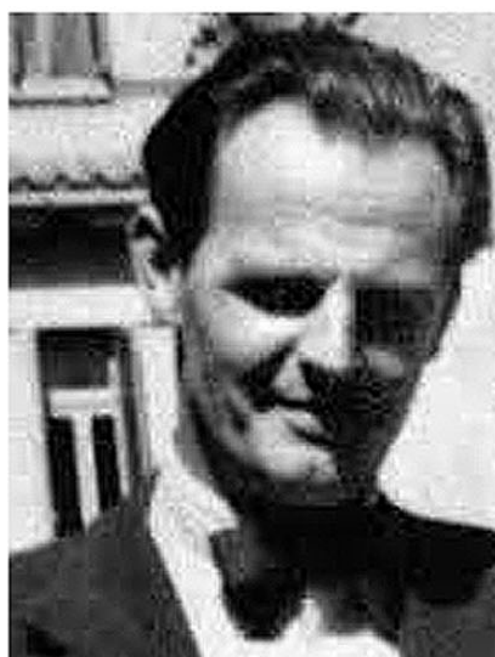
Donald D. MacLean

Background: The disappearance of two British foreign service men, D. D. MacLean and Guy Burgess, upset the State Dept. Both men had access to confidential U. S.-British diplomatic files, although not to top secrets. Even if they hadn't gone over to Russia, their mysterious disappearance on a "holiday" shook official U. S. confidence in their eligibility to handle high policy papers of the two Allies.