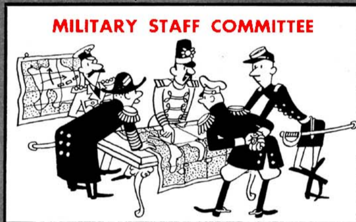
This group—the Chiefs of Staff of the U. S., Britain, Russia, France and China—will direct armed action against any future aggressors.