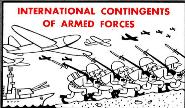
Each nation promises to have a quota of troops ready for future emergencies and to make them available whenever the need arises.