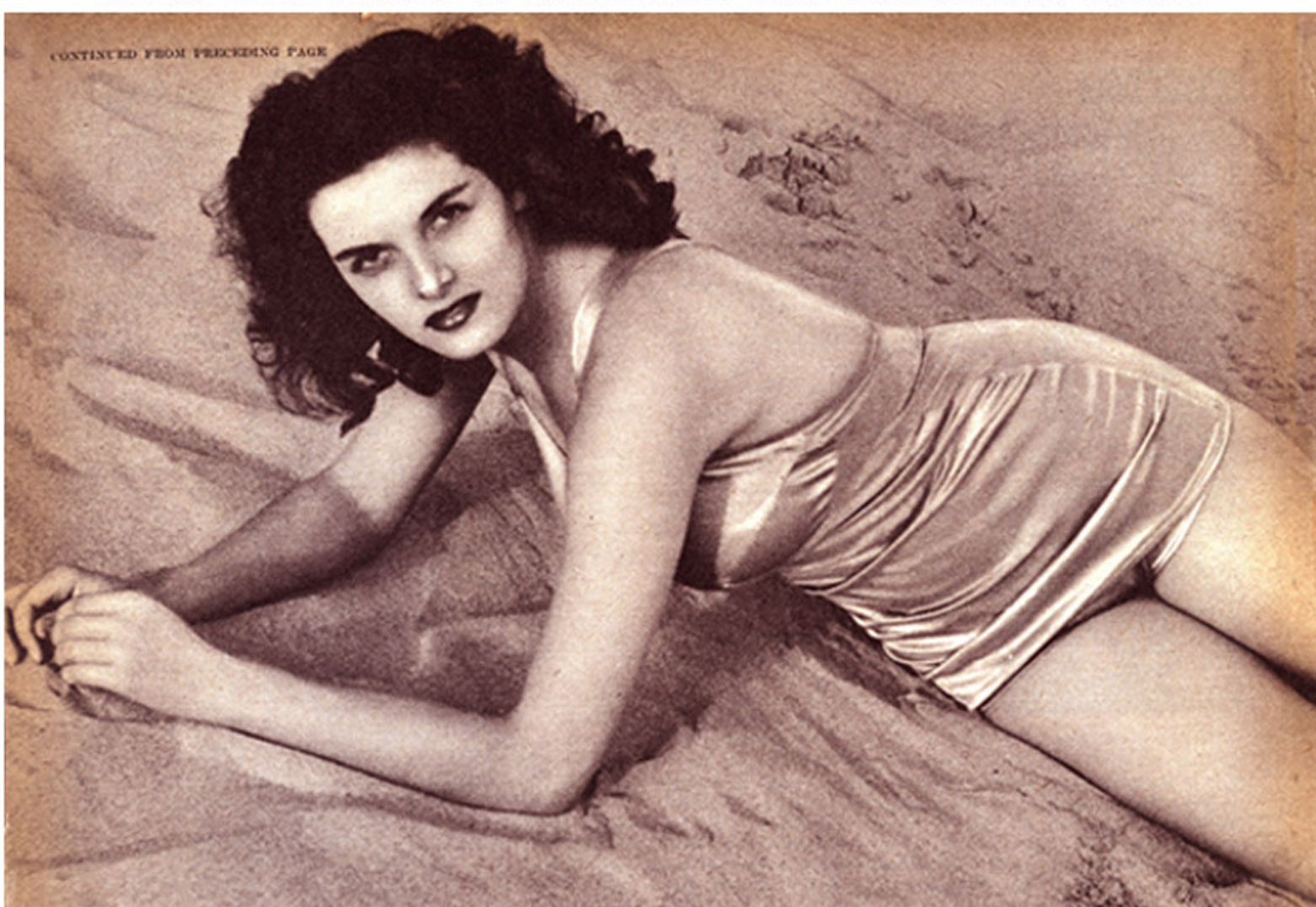
EVEN IN THIS AWKWARD POSE, JANE RUSSELL CANNOT HELP BUT LOOK BEAUTIFUL AND APPEALING, MR. WOULD-BE CENSOR.