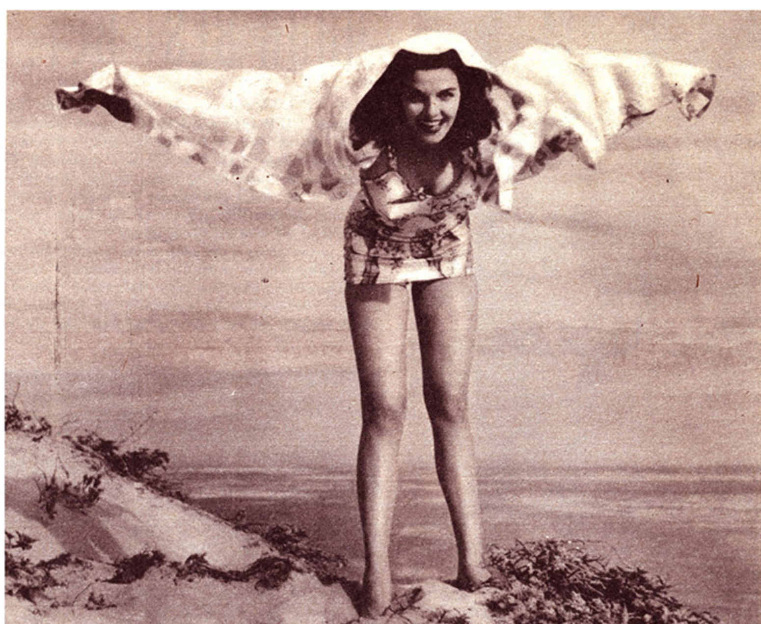
THE "BIRD POSE" HAS ALWAYS BEEN CRITICIZED. HOLLYWOOD JUSTIFIABLY IGNORES THAT CRITICISM.