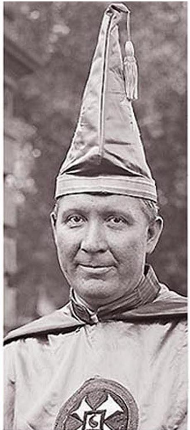
Imperial Wizard Hiram W. Evans

"The Klan's political power is as simple as it is real: it is a