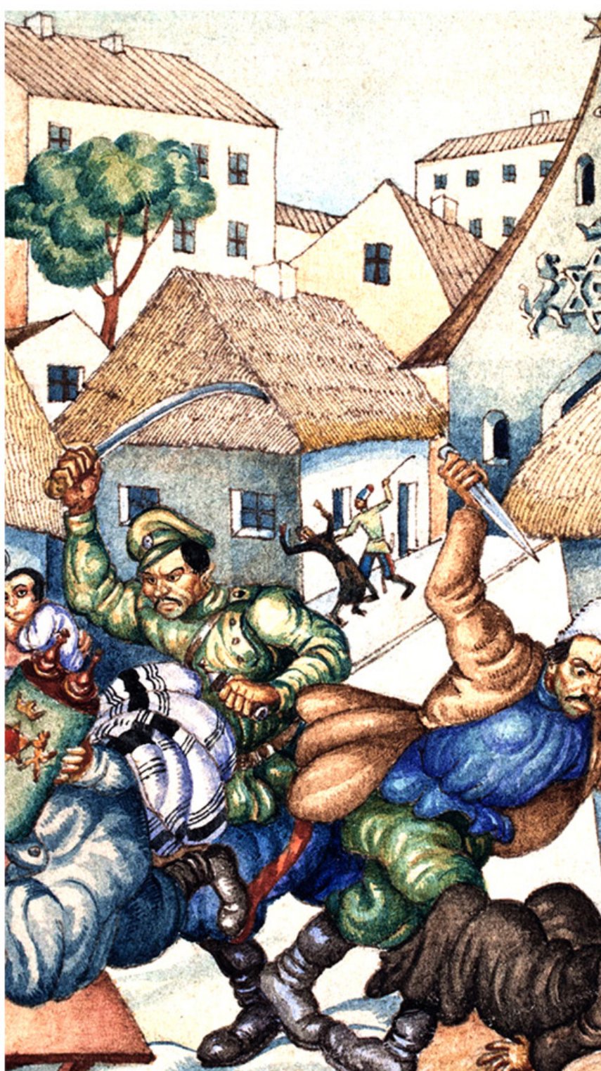
Arthur Szyk (1923)

"Should any of those murderers blasphemously allege religion as a pretext, we wish to be the first to brand them as lying hypocrites, enemies of Christ and blots on the human race."