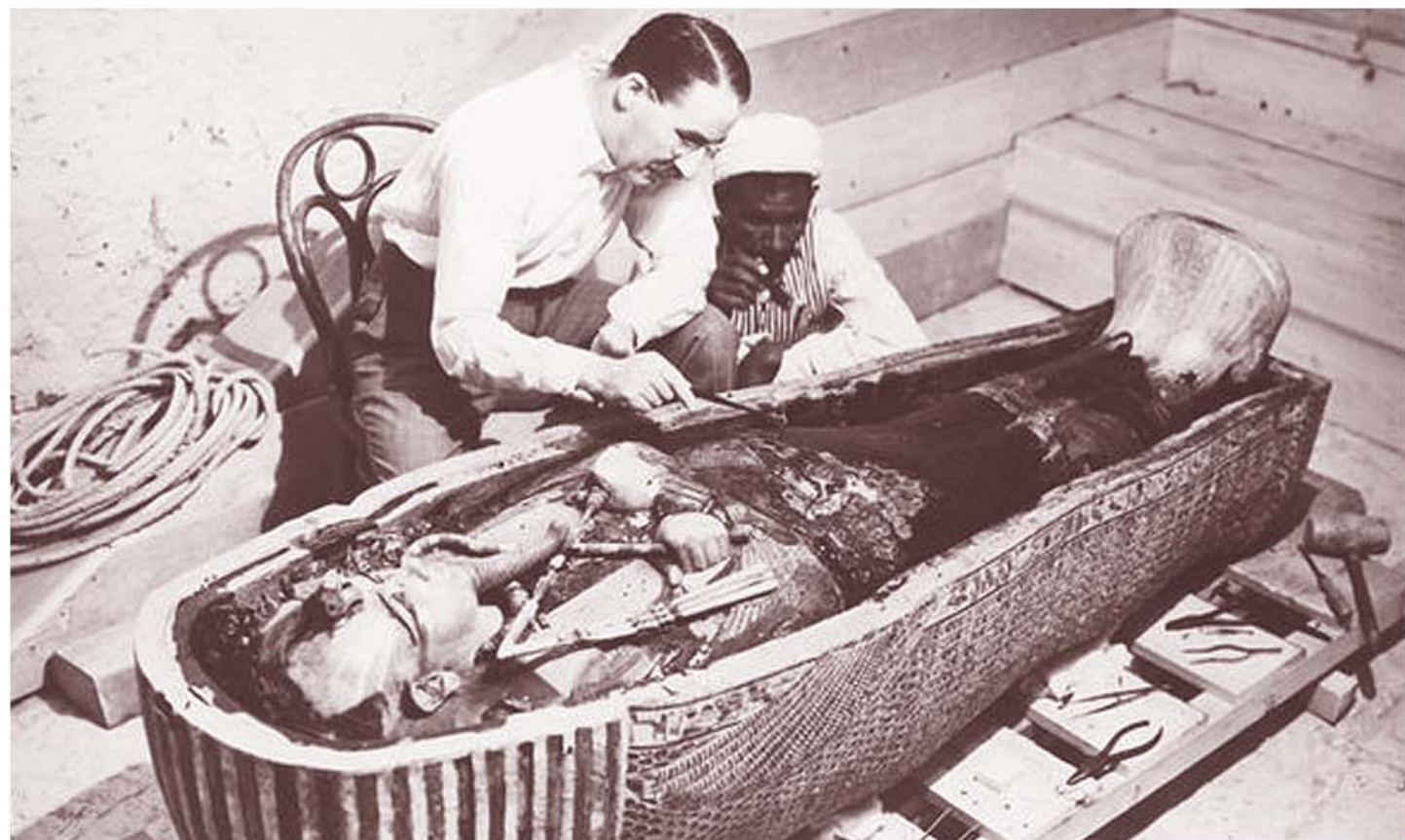
Howard Carter examined the sarcophagus