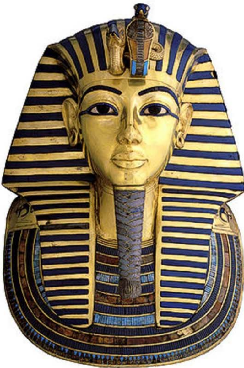
The death mask of the Boy King

"On the next day we began clearing the passage, which proved to be about eight meters in length. Objects, mostly broken, kept turning up, among others, was a broken box with various