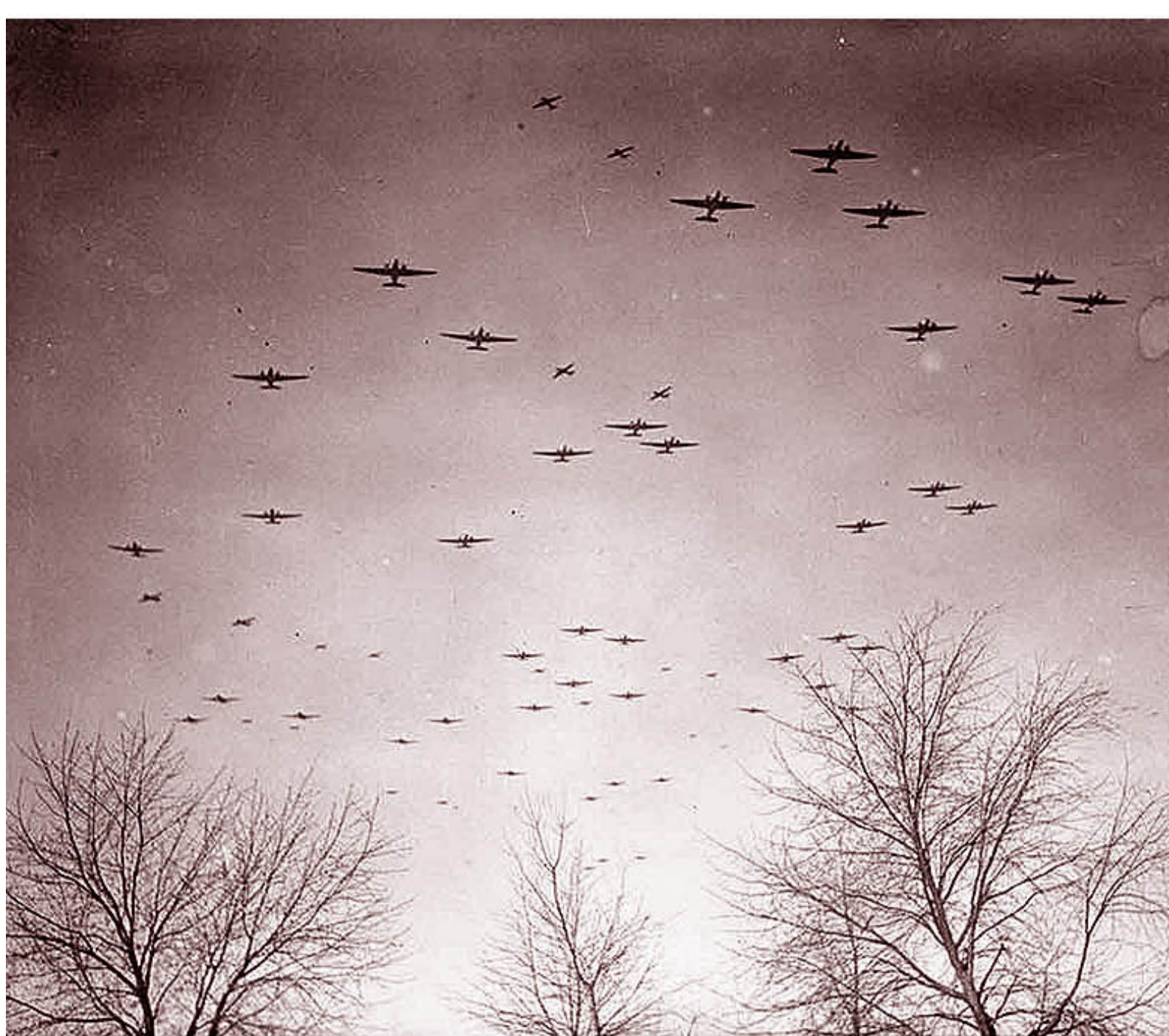
In the skies over Germany a small part of the 5,000 plane armada roars en route to Wesel, where 5,814,000 pounds of men and guns and equipment were dropped in an area two miles by three miles.

bling out of the C-47s, their green camouflage chutes blending with the dark gray ground. The troop-carrier serial seemed like a snail, leaving a green trail as it moved along. And it was crawling indeed—about 115 miles an hour. Our big Fort seemed to me to be close to stalling speed.