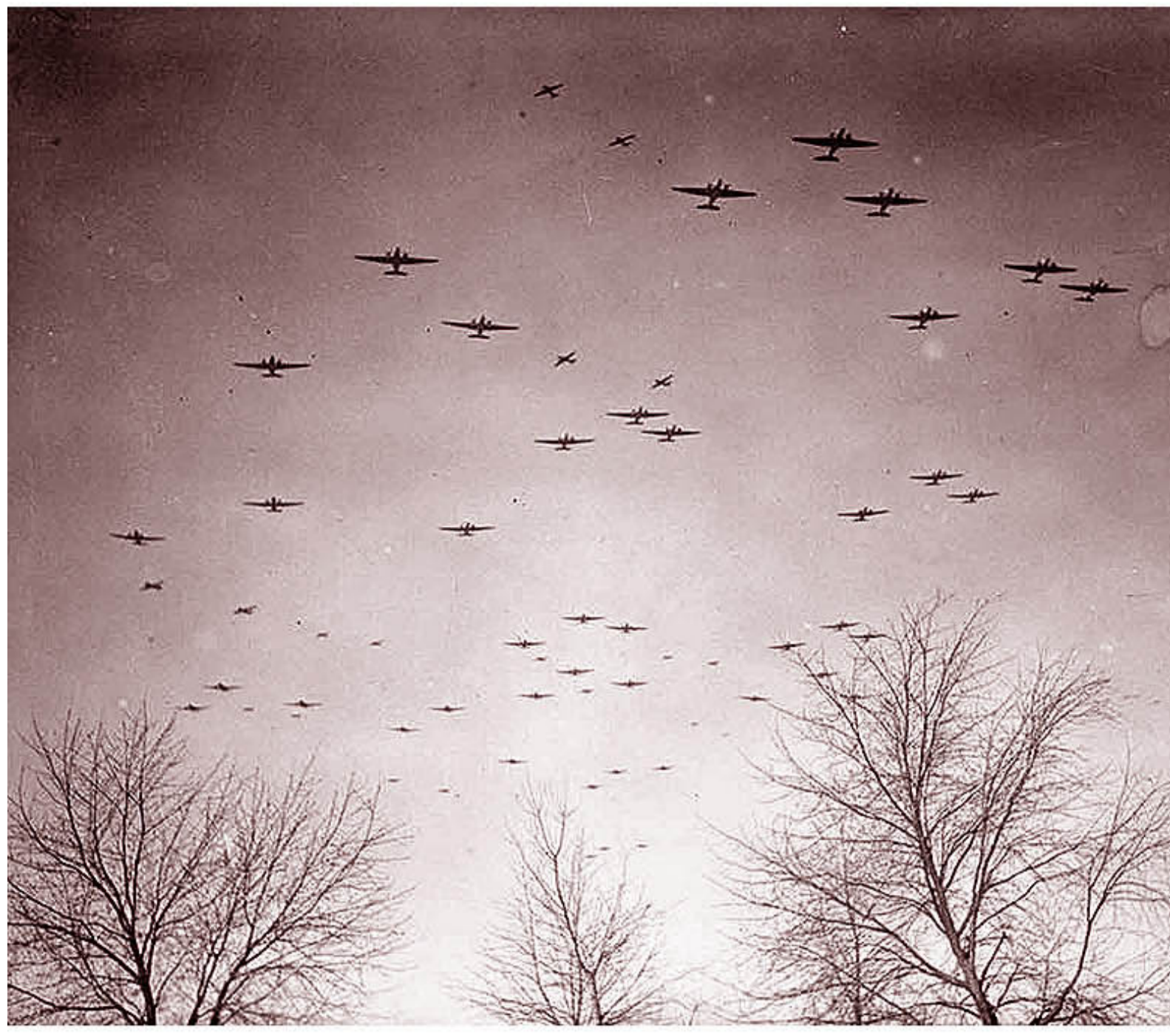
In the skies over Germany a small part of the 5,000 plane armada roars en route to Wesl, where 5,814,000 pounds of men and guns and equipment were dropped in an area two miles by three miles.

bling out of the C-47s, their green camouflage chutes blending with the dark gray ground. The troop-carrier serial seemed like a snail, leaving a green trail as it moved along. And it was crawling indeed—about 115 miles an hour. Our big Fort seemed to me to be close to stalling speed.