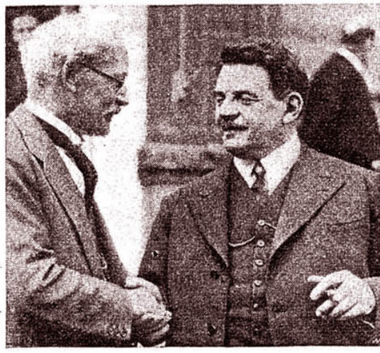
Britain and France