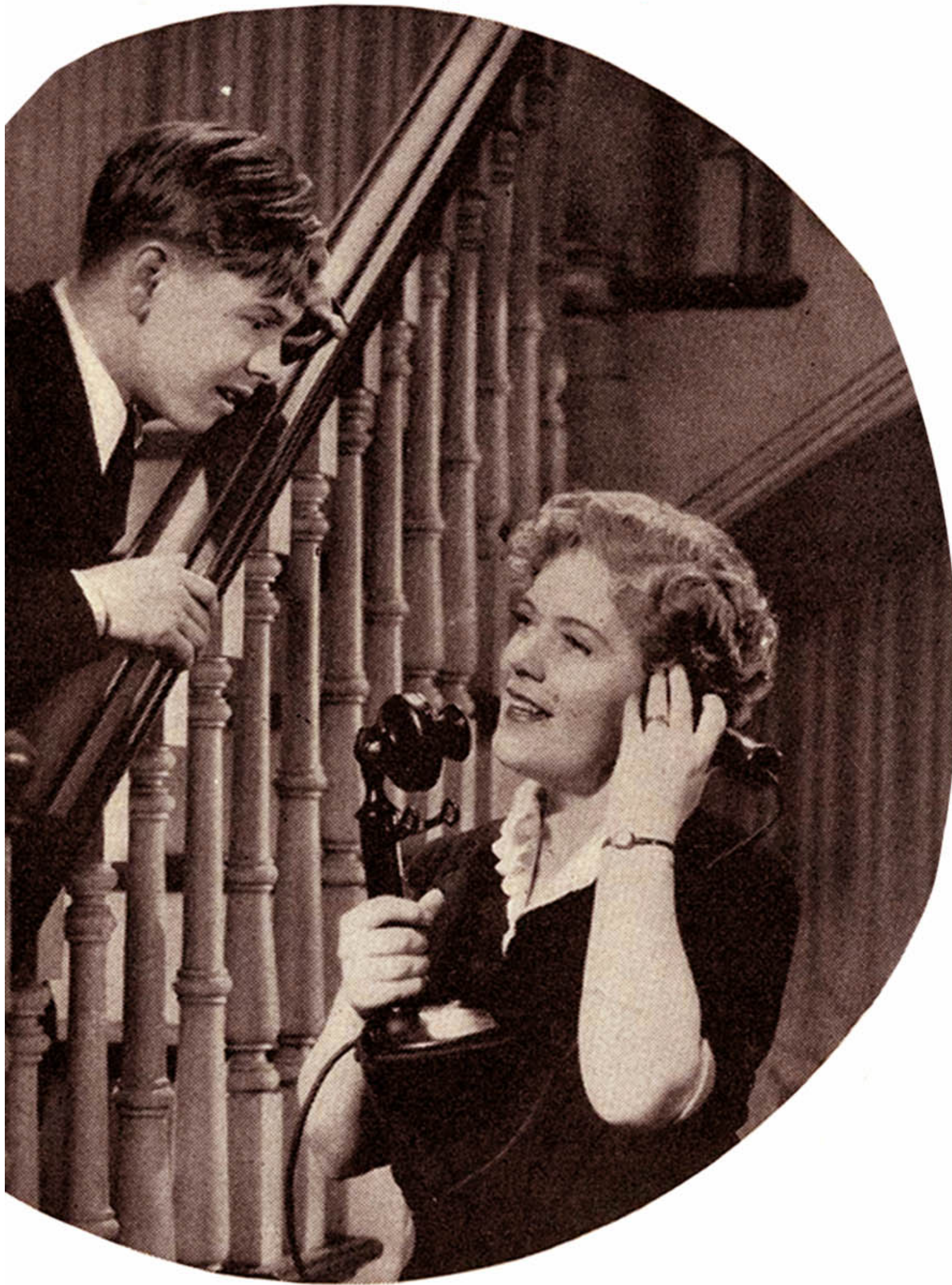
Mickey and Spring Byington, who played Mrs. Hardy in the first of the series, A Family Affair.

ter symbolized 1941, the year in which Mickey Rooney was voted for the third successive time Number One Box-Office by America's twenty-four thousand motion-picture exhibitors.