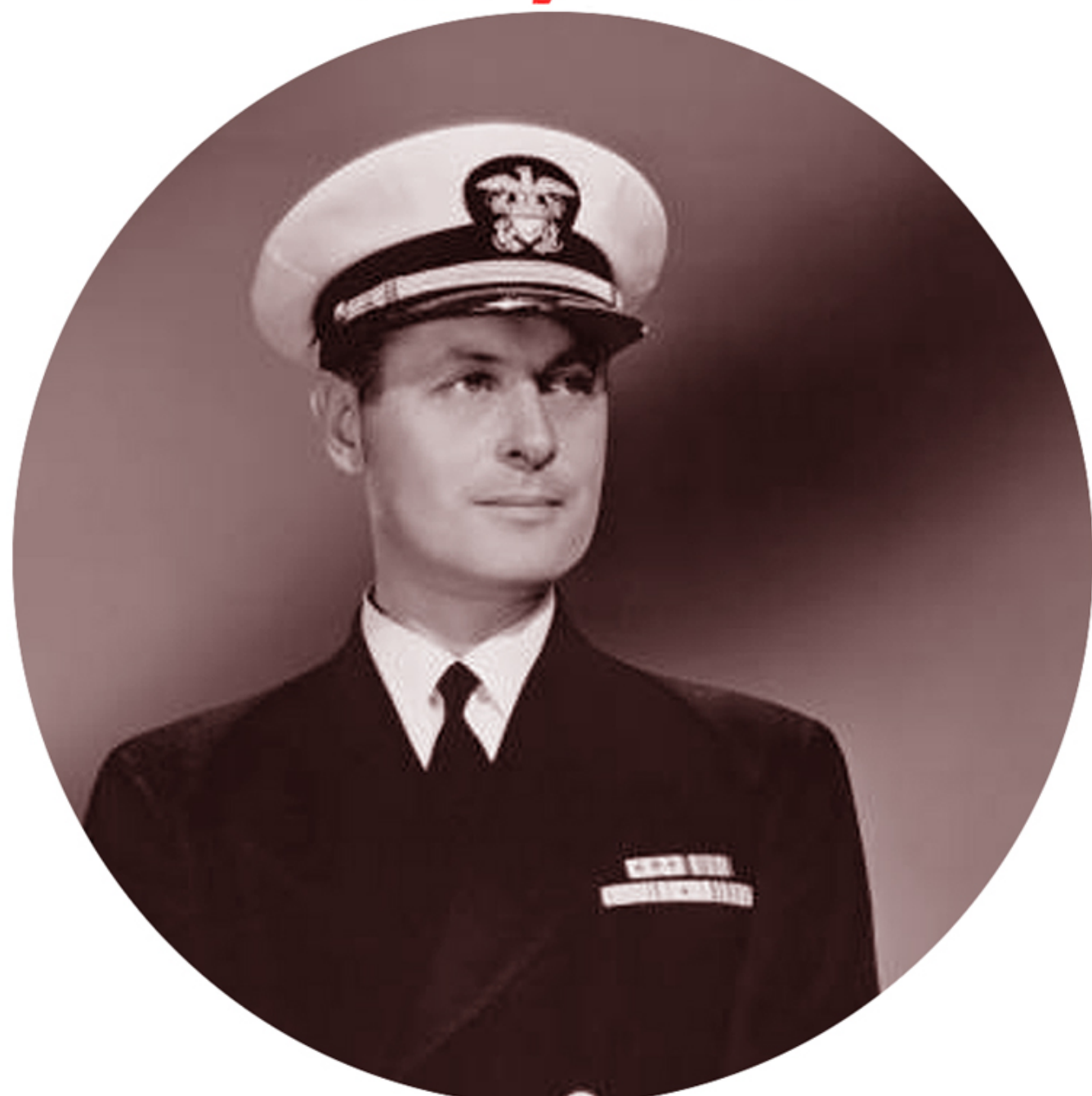
Lt. Robert Montgomery U.S.N.

Because of that feeling, Washington must take the lead. The time has come for Washington to proclaim the movies an essential industry, exactly as necessary as steel and coal and ships and farms. That is not merely a flowery statement. It is the plain truth that must be recognized.