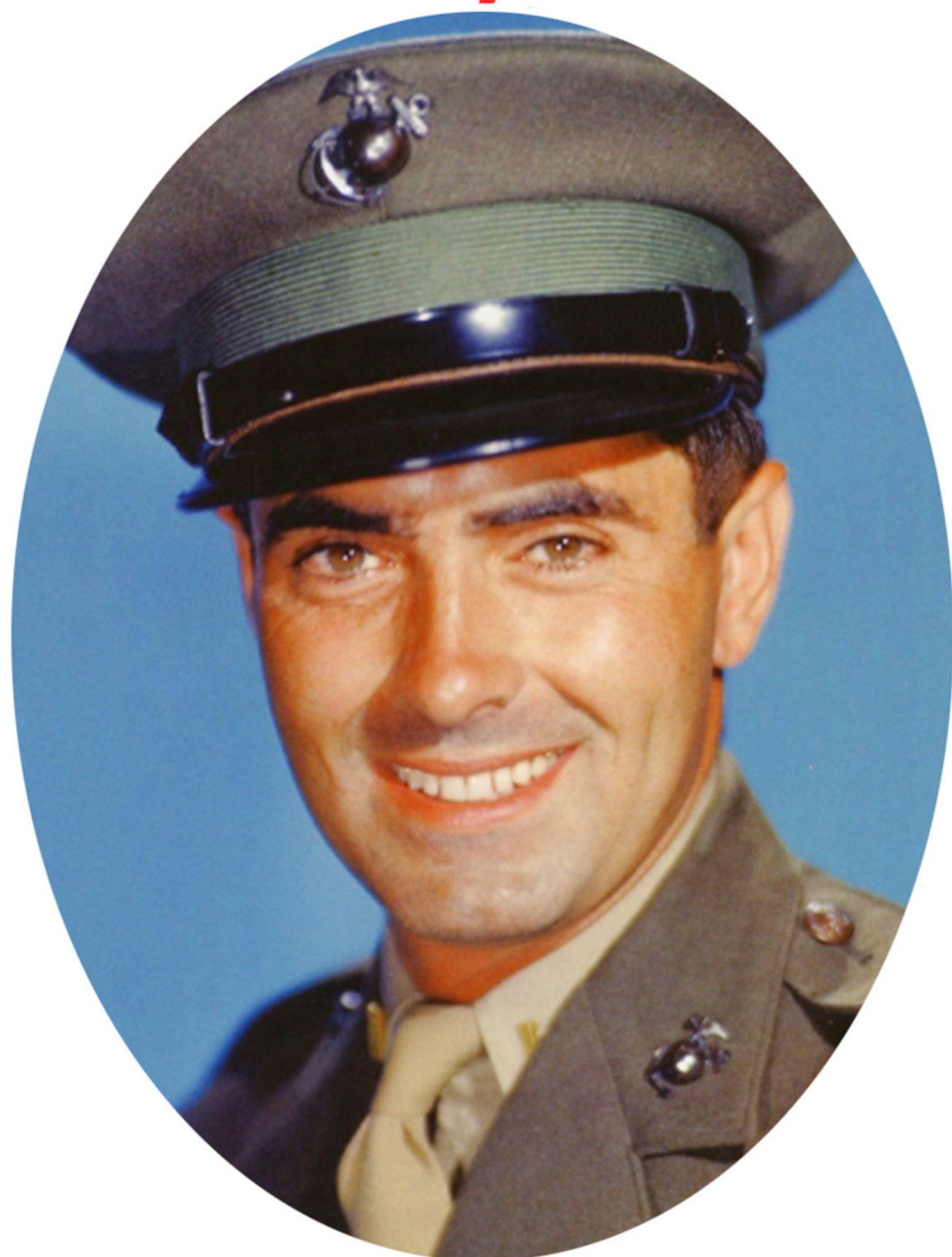
Lt. Tyrone Power Marine Corps

fighting in Africa, in the Pacific Southwest. With the passing months, the fury of the struggle will mount. Our thoughts will be of fighting men, of bravery and victory. All other problems will seem trivial and puny. It will take a strong man to face public clamor then. The producer who comforts himself with the thought that he can get by with lesser names or older actors may find that there are no names of any sort available.