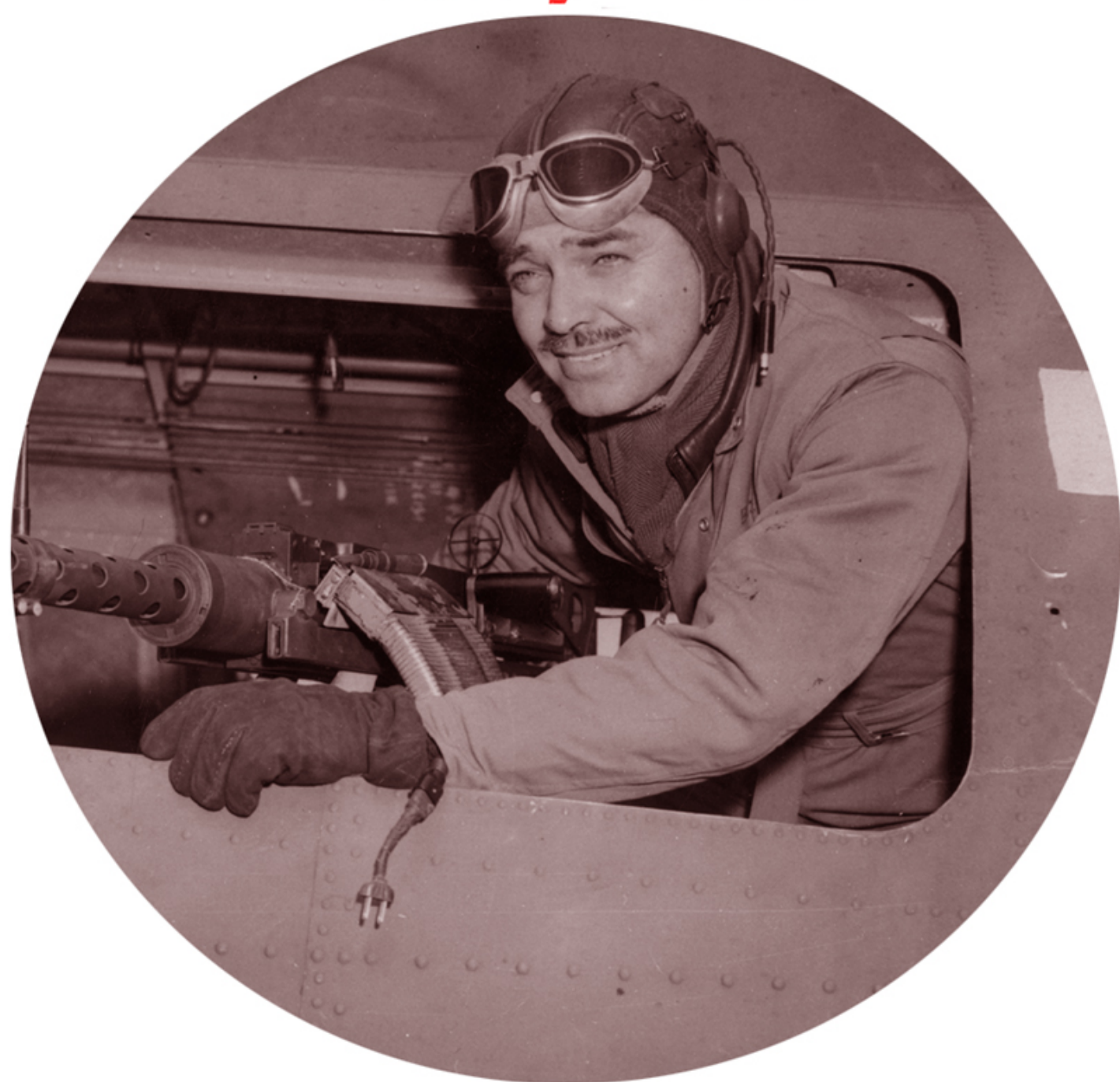
Lt. Clark Gable Army Air Forces