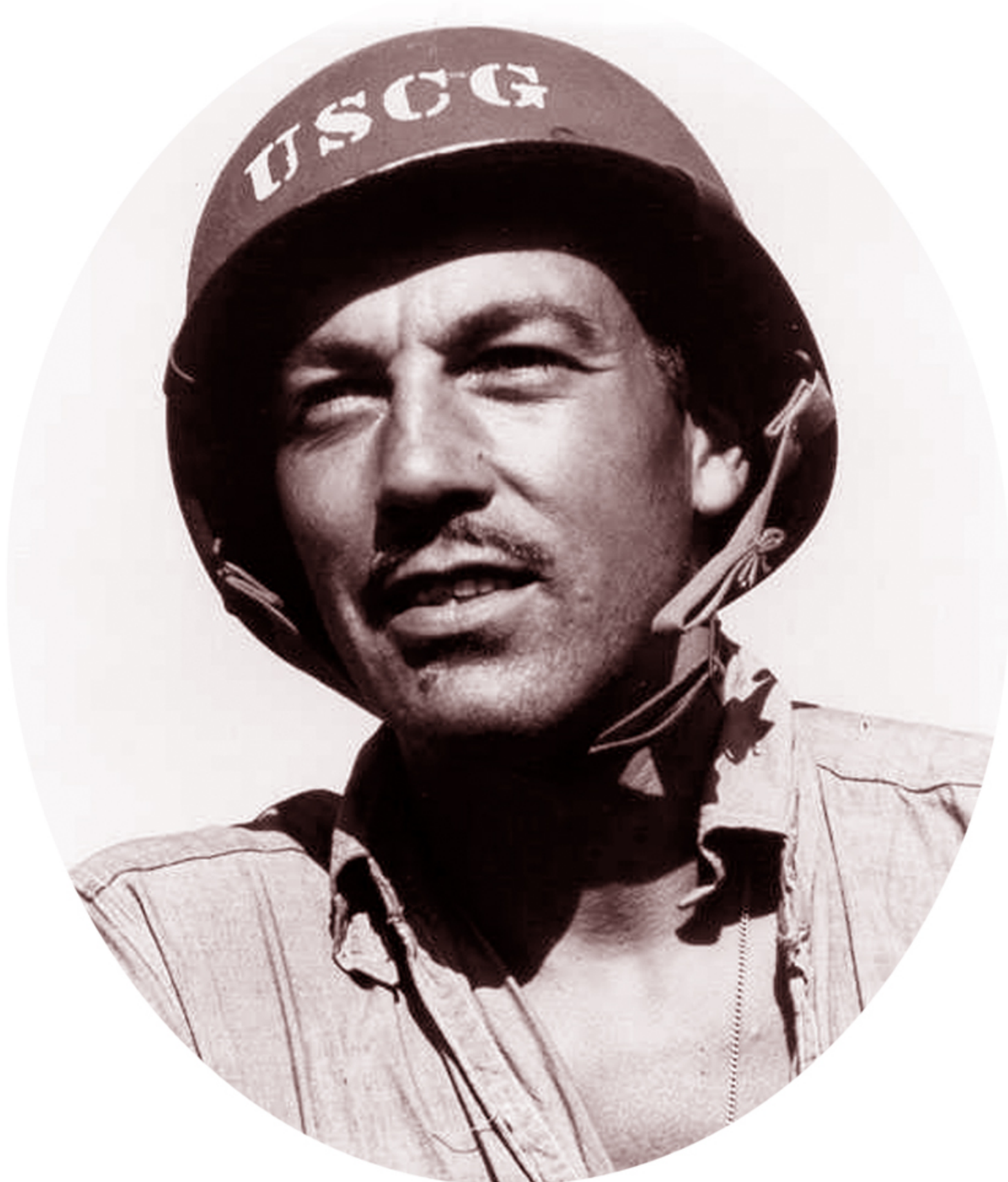
Cesar Romero Seaman, Coast Guard Reserve

The job is to make the best pictures in the world and to keep on making them. Putting the problem in its simplest form, Clark Gable shouldn't be allowed to be a soldier. War is too serious for us to be playing sentimental games. He has a duty and Hollywood has a duty and they should be made to stick to it. ★★★