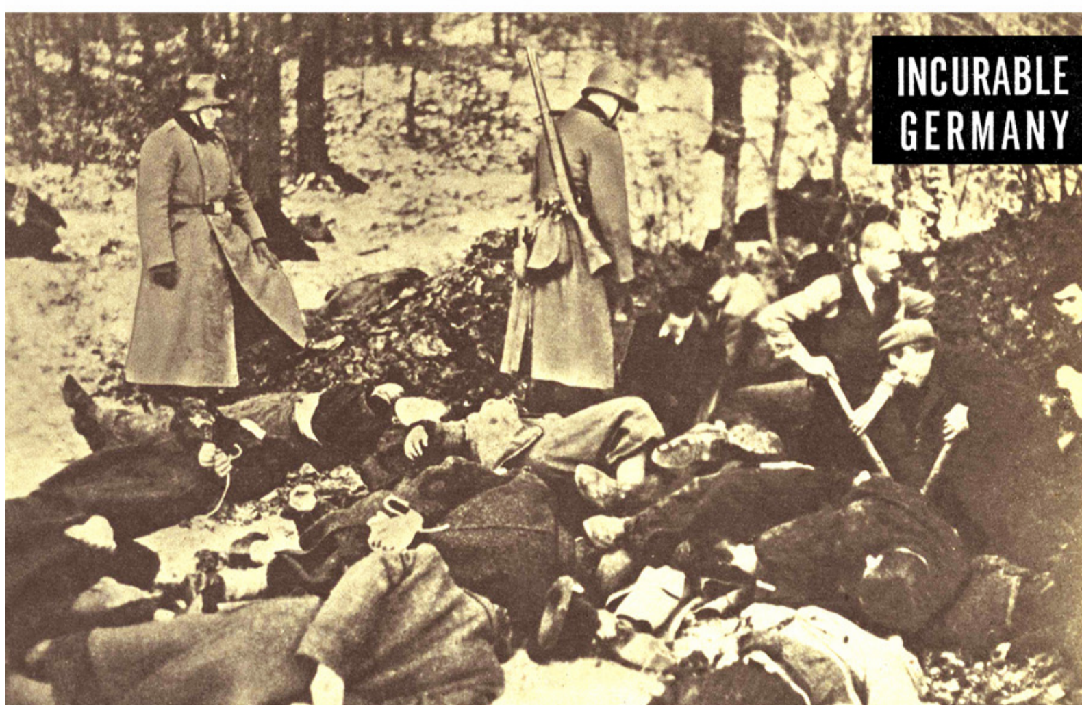
POLISH CIVILIAN HOSTAGES ARE FORCED TO DIG MURDERED COUNTRYMEN'S GRAVES, BEFORE FACING FIRING SQUAD IN BAFFLED NAZIS' ATTEMPT TO STAMP OUT SPREADING SABOTAGE

O NE of the most brutal features of Hitler's so-called "war strategy" is the ruthless mass-killing of innocent "hostages" in outrageous defiance of International Law.