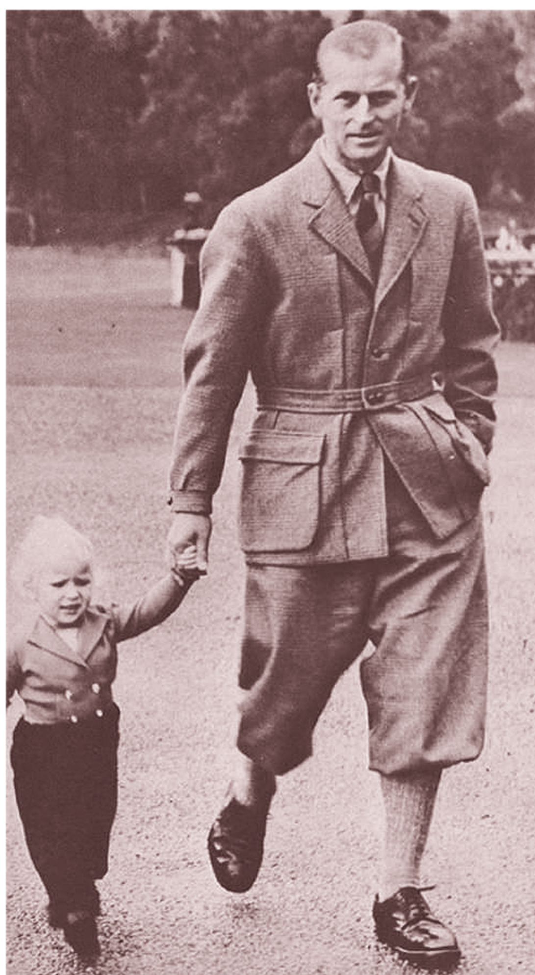
Prince Philip, Duke of Edinburgh, with the Royal Princess Anne, wearing a jacket, with Norfolk characteristics, which was tailored especially for him.

Overseas this revival has been given impetus because of the inclusion of the coat pictured on the opposite page in the wardrobe of Prince Philip. It should be pointed out that this jacket, made by Todhouse and Reynard (Norwich) Ltd., which is sometimes referred to in England as a "Norfolk House" and which has received orders from the Royal Family for several generations, incorporates only characteristics of the true Norfolk jacket. In place of the usual pleats, it is tailored with a forward fold on each forepart which is not sewed down but is left to expand. Retained, however, from true Norfolk design are the usual vertical pockets and all-around belt. The sleeves, too, incorporate a change in that they are finished with a button band at the wrist in place of the conventional open cuff. In this country, too, there is a definite indication that acceptance of this jacket is on its way back. Our fashion scouts have seen it worn in the country and at sporting events in recent months, as evidenced by the candid pictures shown on this page. Several custom tailors report that they are tailoring garments of this type at the request of individual clients. This spring it will be seen in a limited number of fine stores throughout the country in ready-made versions, one of which is shown above.