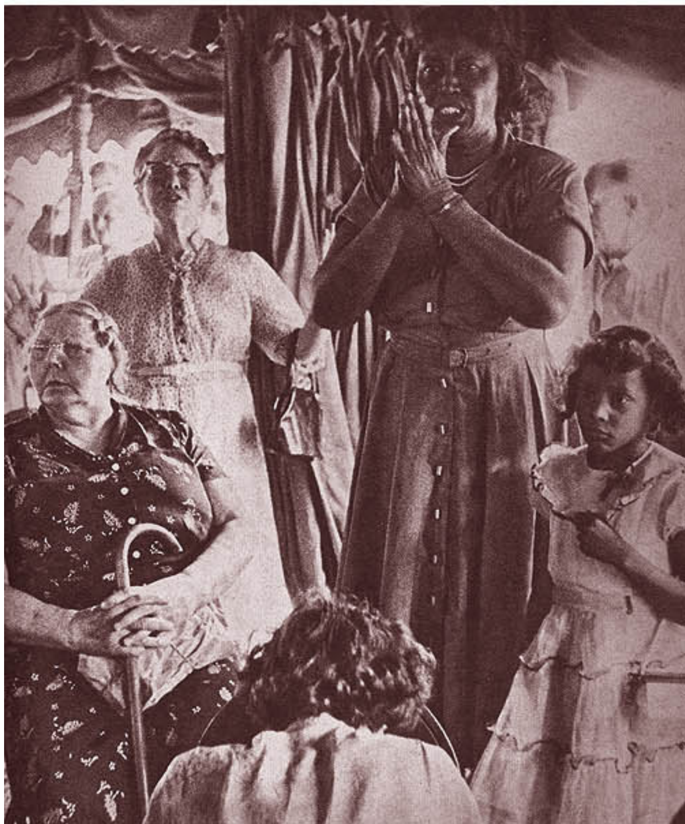
In Roberts’ revival of emphasis on Christian healing there are no bars to age or race.

He is more interested in people like the young woman whose boy friend, sitting beside her at a Roberts meeting, refused to be saved and mocked her until she could stand it no longer. “All right,” she said firmly, “if you won’t go to heaven with me, I’m not going to hell with you!” And with that she moved up front and “gave her heart to God.”