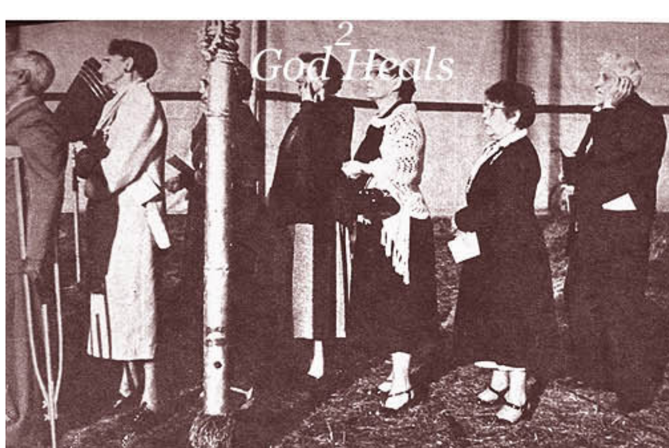
Cathedral Tent queues stretch endlessly as sick and halt wait turns to be healed.