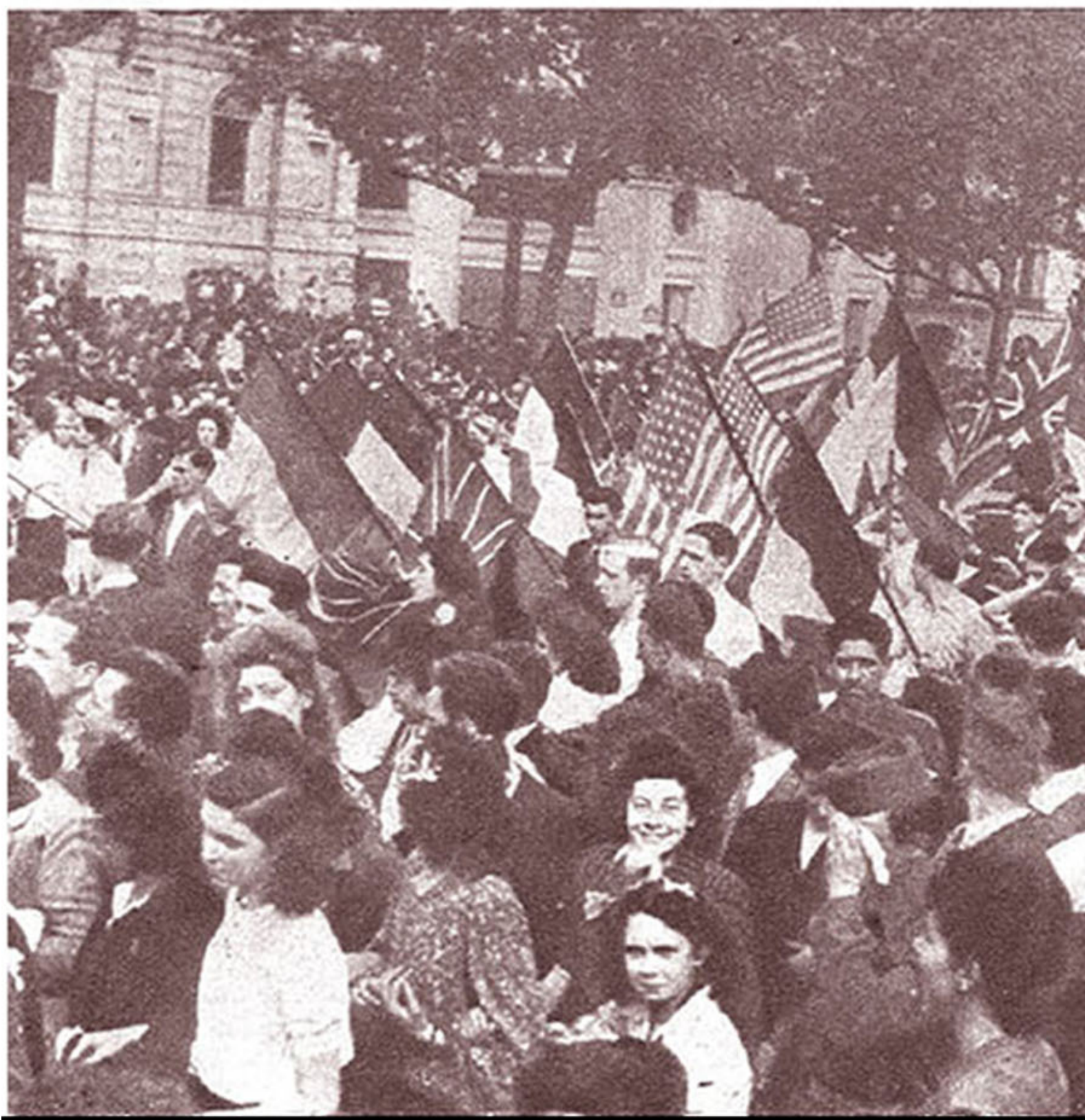
One of hundreds of student parades that jammed the Champs Elysees all V-E Day.

"Vive le President. Vive la Republique. Vive la France," the crowd replied.