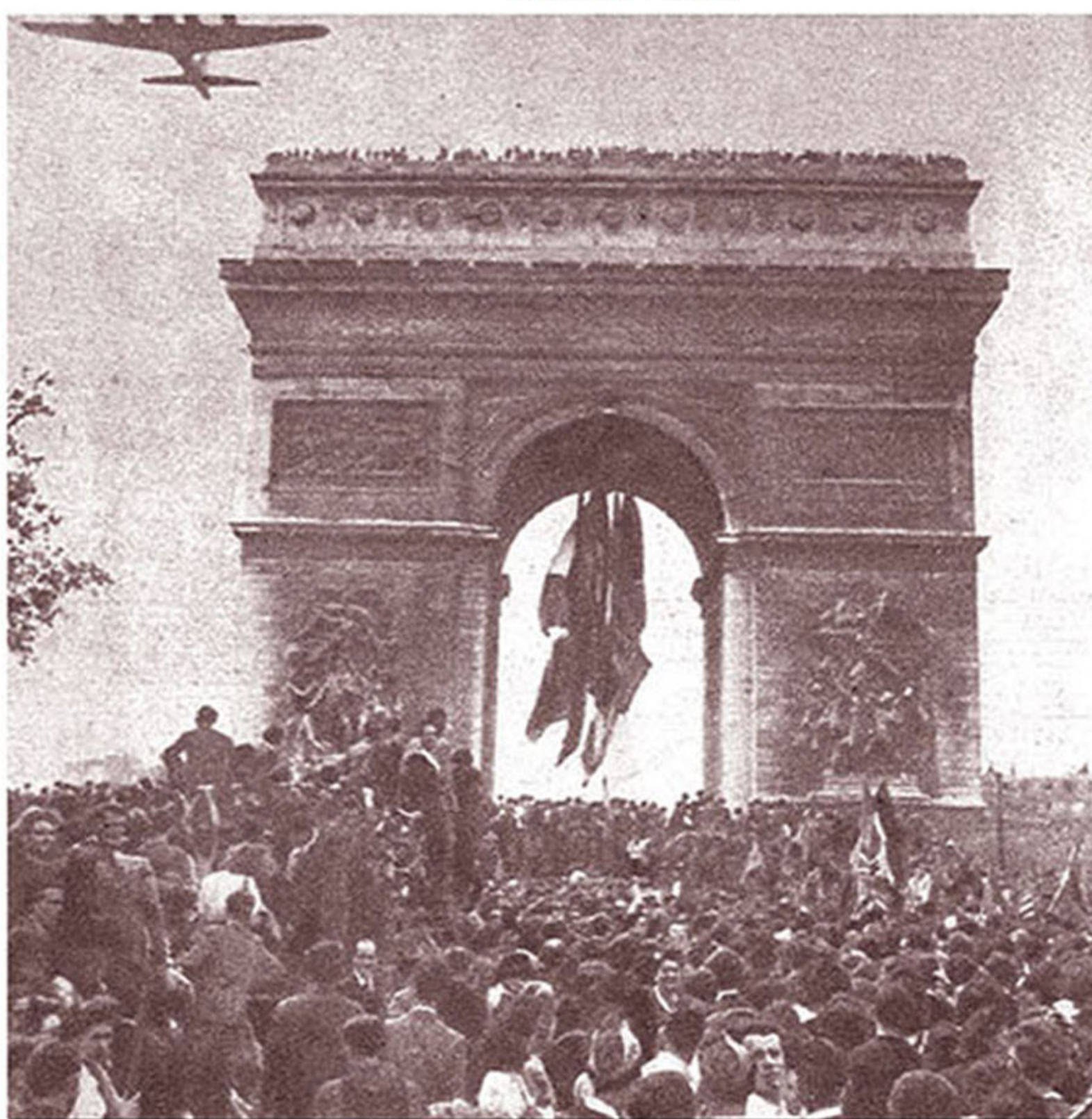
A Fortress buzzes the Arc as crowds gather to pay respects to Unknown Soldier

liberated by the Seventh Army and was now back home, one of 8,000 Frenchmen being repatriated daily. He looked thin but said he was rapidly gaining weight.