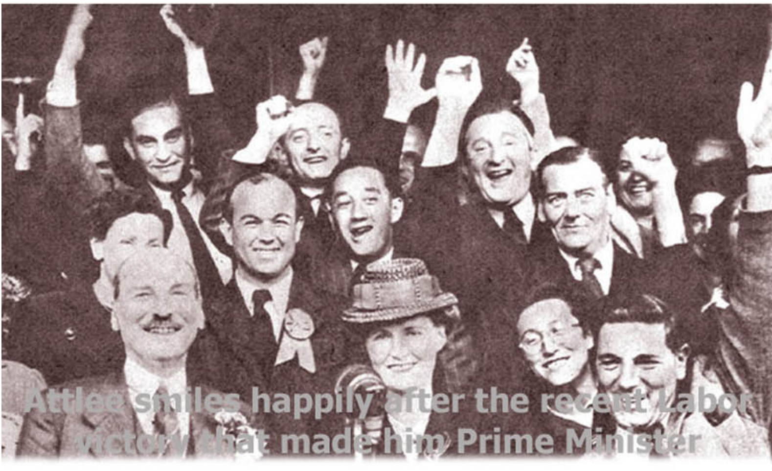
Attlee smiles happily after the recent Labor victory that made him Prime Minister

Nobody was more surprised at the explosive 1945 election than the winners. Whatever success the Labor Government may have in reconstructing Britain, there is no doubt that the people are behind it.