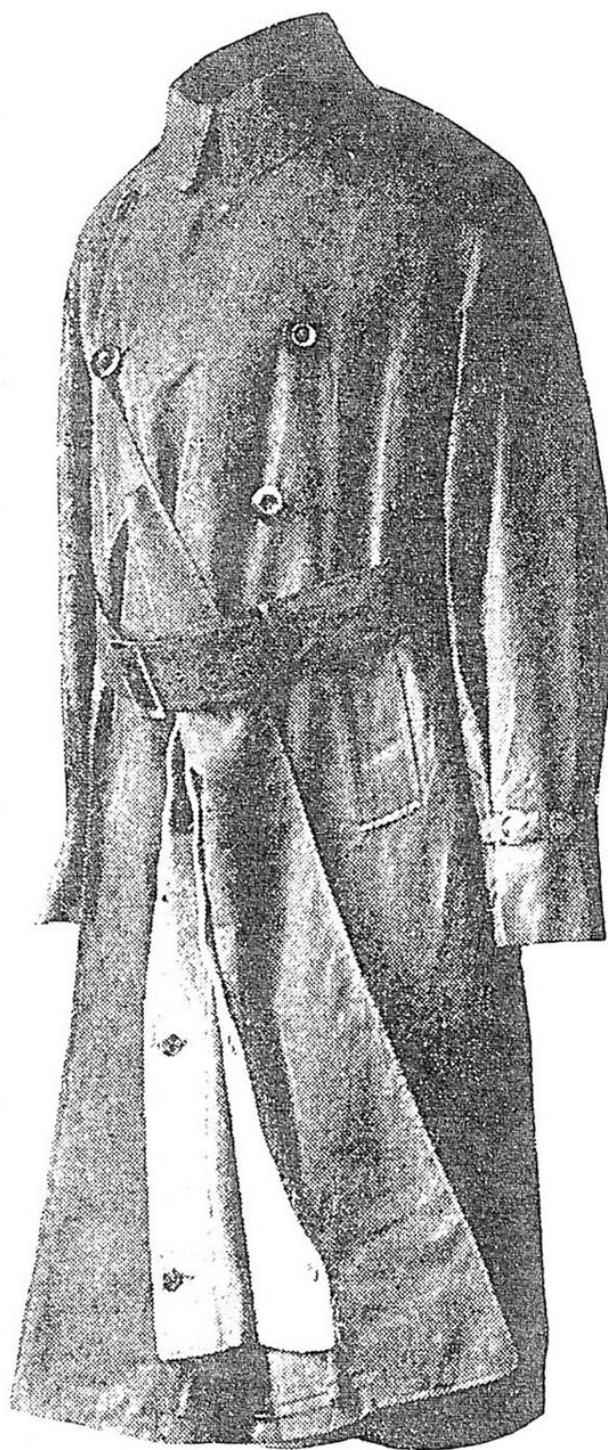
Waterproof trench coat, belted and with wrist straps; oil silk interlining and removable woolen inner lining in addition

Things which are intended to see active service must, of course, be of the very best design and quality. A very good trench coat, of a model which has stood the acid test of service on the British front, is illustrated on this page. This coat is made of a strong gabardine with an interlining of waterproof silk. It has, in addition, a removable lining of heavy wool, which buttons in when desired. The coat is