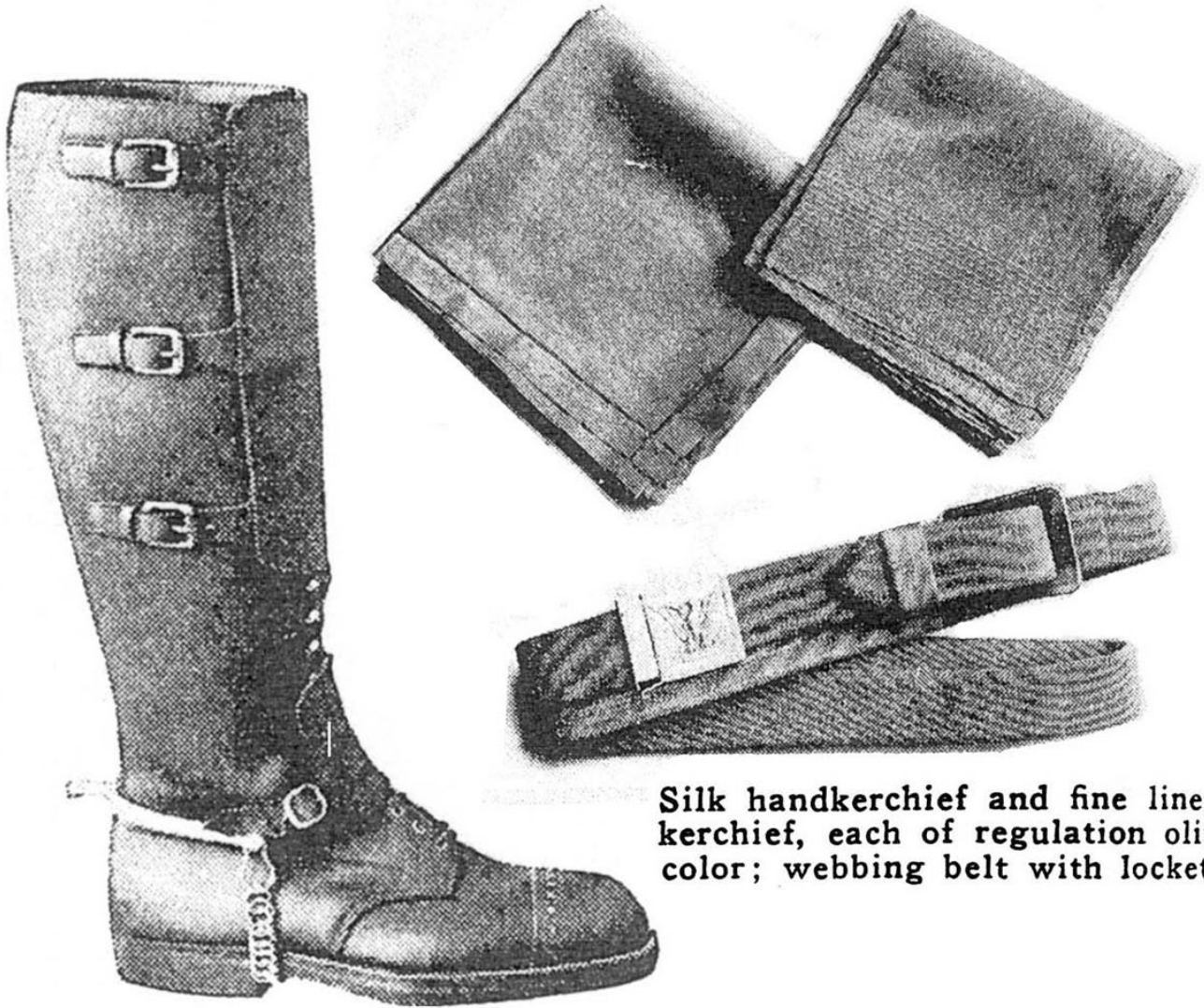
Silk handkerchief and fine linen handkerchief, each of regulation olive drab color; webbing belt with locket holder

On the left, khaki shirt of light weight flannel; black silk knitted scarf. On the right, light weight silk and wool shirt worn with officer's white stock