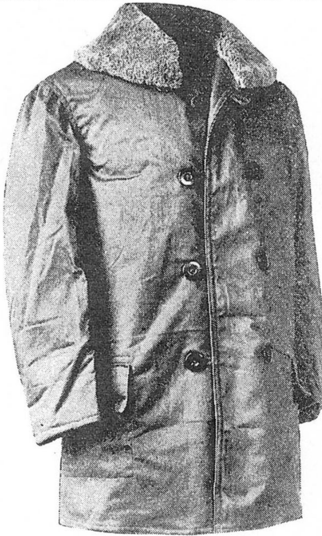
Short-warm military coat, fleece lined; high collar

Of course, one of the most important things for the fighting man is his footwear. Probably nothing rouses more universal human contempt than the occasional scandals which become public in all warring countries concerning paper-soled shoes or other evidences of graft which touch upon the foot-gear of the soldier. Fortunately, these occur-