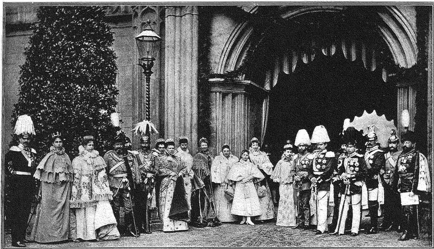
CUT No. 4.

THIS photograph of a shooting party given by King Edward at his country seat of Sandringham, while still Prince of Wales, in honor of his nephew and niece, the German Emperor and Empress, is of particular interest, owing to the fact that the Emperor had insisted upon paying a visit to England with his consort, at that exact time. It was in the closing year of Queen Victoria's reign, and owing to the frail condition of her health, he had been strongly recommended to postpone his coming to a later period. When the Kaiser persisted, however, the King did everything in his power to render his stay pleasant. He asked, as a favor, that Baron von Senden-Bibran, the Emperor's A. D. C., should be left at home, owing to the disrespectful remarks which the Baron had made about the King. The Kaiser ignored this request of his uncle's and brought his A. D. C. not only to England, but actually to Sandringham. The Baron is shown at the back, between King Edward and Prince Buelow.