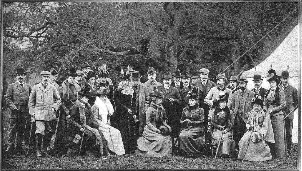
CUT No. 5.

by King George, and Queen Mary of England; by Grandduchess Vladimir and Grandduchess Cyril of Russia; by the Dowager Duchess of Saxe-Coburg-Gotha, only daughter of Czar Alexander II., and now a prisoner of state at Coburg; and by Princess Louise of Belgium.