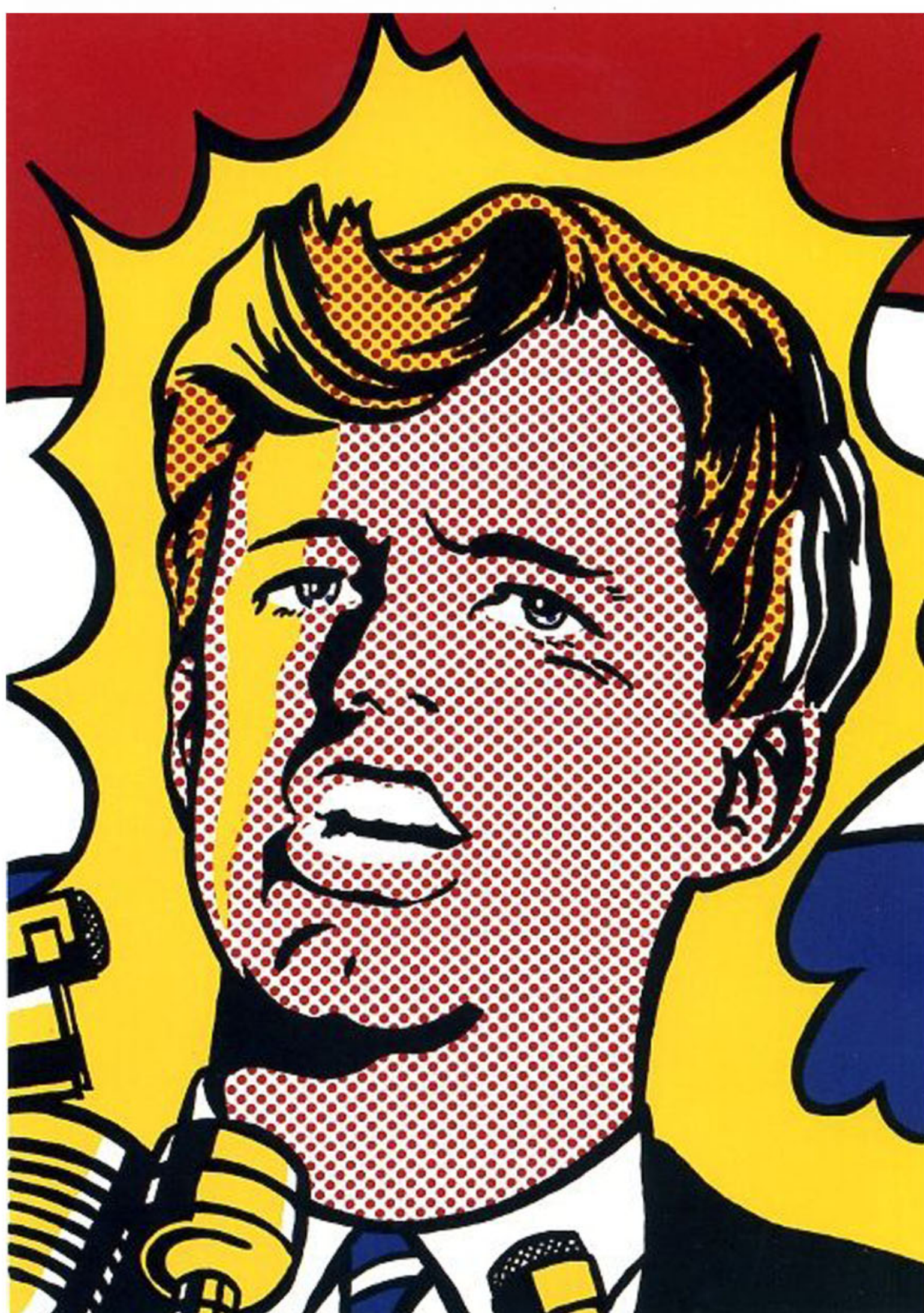
RFK by Roy Lichtenstein

Mark Hatfield. Who knows how many pretenders to the throne we may see months from now, let alone in another four years?