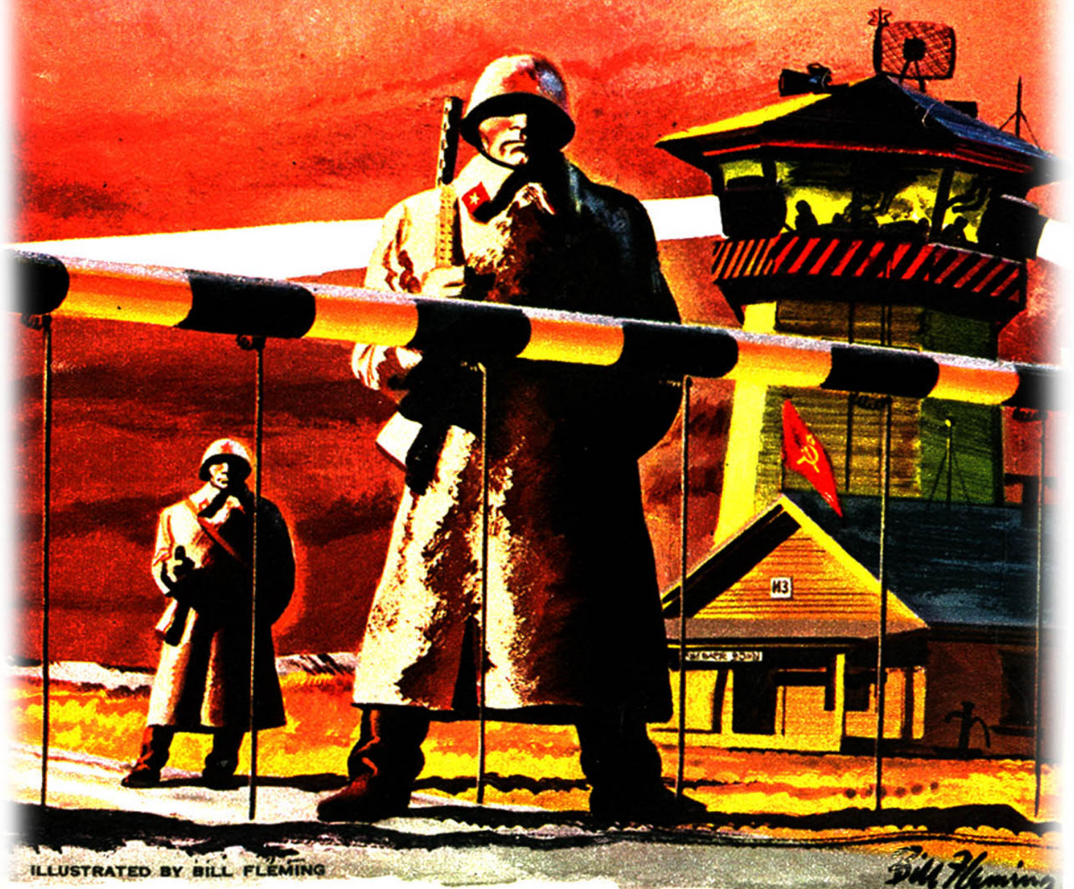
ILLUSTRATED BY BILL FLEMING

masters. But through the chinks in the seemingly impervious wall comes another story, telling of resistance and sabotage, of a suppressed people who have learned to fight fire with fire. These stories do not herald the imminent collapse of the Red tyranny, but they prove that the will for freedom surges strong behind that Curtain.