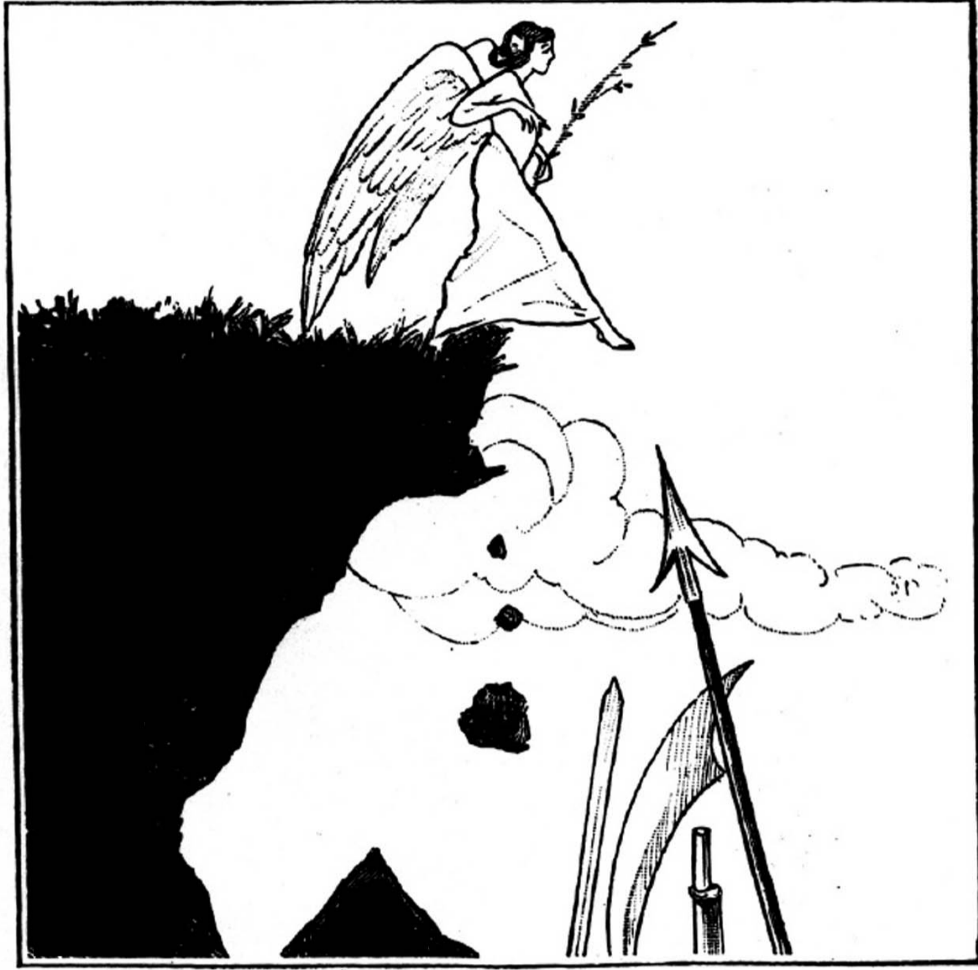
THE PROGRESS OF PEACE.

A VERY INFLUENTIAL military writer of Germany declares that Germany must win her place as a world power through warfare. This is General Bernhardt, who in his new volume on " Deutschland und der Naechste Krieg " ("Germany and the Next War") practically throws down the gauntlet to Europe, and to England in particular. Never has the policy of Berlin been proclaimed so clearly and so fearlessly. The General's book gives a candid expression of the view that his country must fight its way to predominance regardless of the rights and interests of other people. This accepted authority on current strategical and tactical problems describes the peace movement as simply "poisonous." In one chapter he discusses