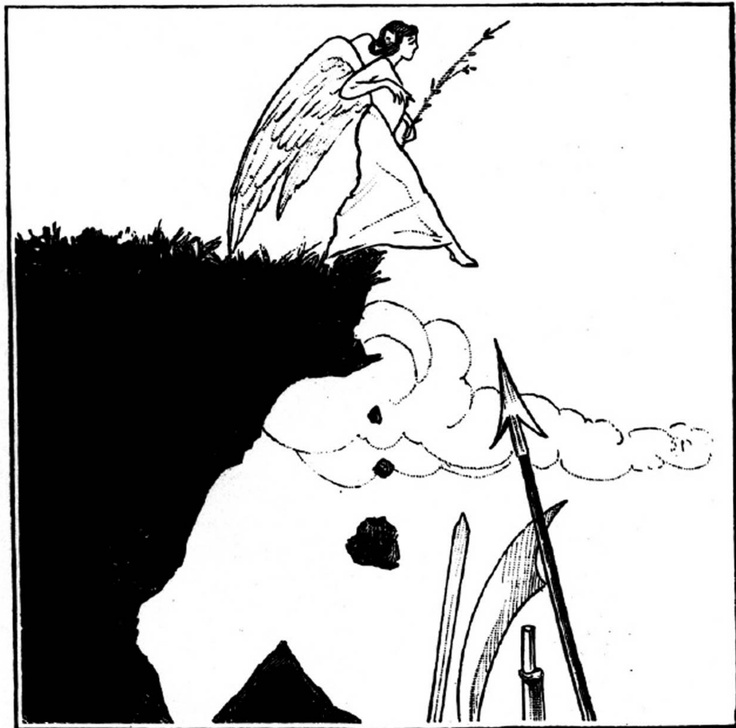
THE PROGRESS OF PEACE.

A VERY INFLUENTIAL military writer of Germany declares that Germany must win her place as a world power through warfare. This is General Bernhardt, who in his new volume on " Deutschland und der Naechste Krieg " ("Germany and the Next War") practically throws down the gauntlet to Europe, and to England in particular. Never has the policy of Berlin been proclaimed so clearly and so fearlessly. The General's book gives a candid expression of the view that his country must fight its way to predominance regardless of the rights and interests of other people. This accepted authority on current strategical and tactical problems describes the peace movement as simply "poisonous." In one chapter he discusses