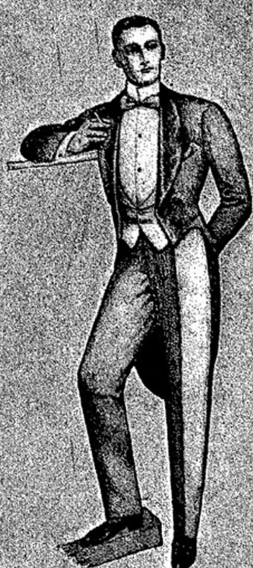
Dark blue evening suit. Shawl collar facings of dark blue satin. Piqué waistcoat, shirt and tie. Plain collar.

Dress & Vanity Fair Fashions · The Stage · Society · Sports · The Fine Arts