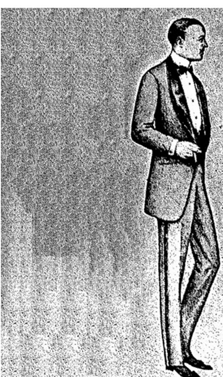
Loop button black dinner suit, Jacket with satin facings, Black satin double breasted waistcoat and tie.

T HE coat should fit the body tight up under the arms, so that in any posture the garment stays in place. The sleeves are narrow and the short placed waist-seam encircles the body to the front edges. The front effect of the coat is best when well opened, exposing considerable shirt, the lapels