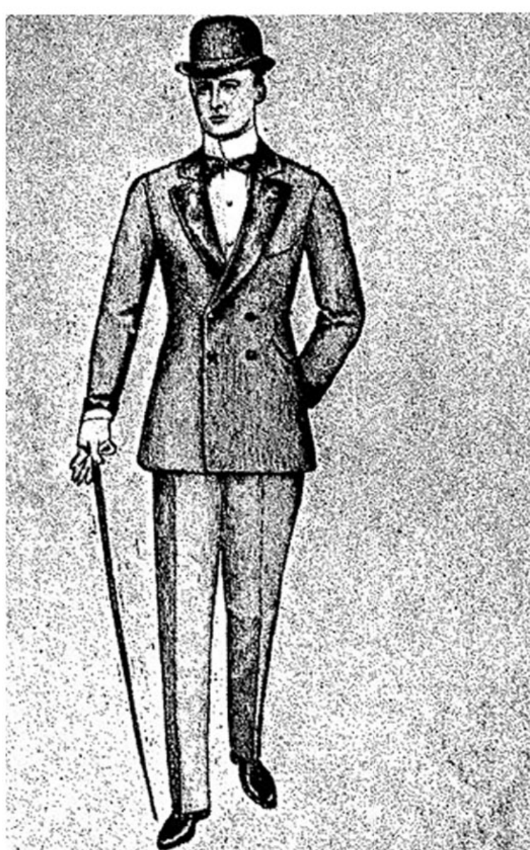
Double breasted dark blue dinner suit, facings and cuffs of dark blue satin. Single breasted waistcoat.

no reason why they all should not know and care — as they should care and know about the proper use of the knife and fork, for it is as easy to do most things properly as wrongly.