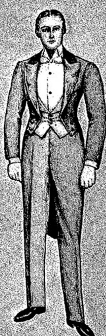
Black evening suit. Facings of brilliant silk. Velvet collar. Plain white linen waistcoat, shirt, collar and tie.