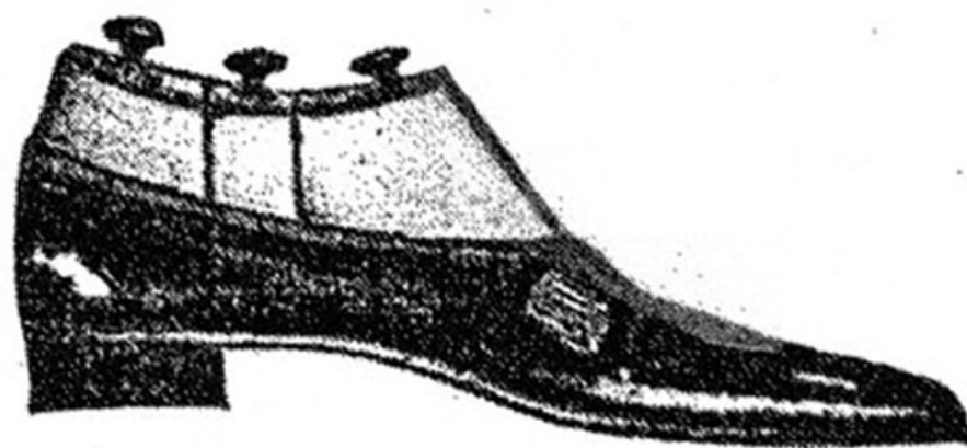
Soft toe patent leather pumps. Thin soles, long vamps. Opening bound with corded silk, flat bow of corded silk

I DINED, a few evenings ago, with some men at a place where one sees the beau monde of New York. During coffee we were joined by a man prominent in London and in Paris, for his connection with great monetary affairs. It is said that he is very rich and also, a hard working man — one whose strenuous labors often consume many hours of the day. With this in mind I could but admire his appearance, his well groomed hair, his well fitting evening clothes, his well varnished shoes and the pearls in his linen. He wore nothing extreme; all was in black and white. It was the nicety of values in everything, with a certain unconsciousness, that made the perfect ensemble of a man who seemingly did not care—but knew. Around me, at other tables, were many men known in this world of New York — amongst them it was not difficult to find — perhaps a few — who were arrayed in immaculate but unimaginative evening clothes. There was an expression of struggle in what they had on, the latest finishings that fashion calls for, yet clothes which fitted more as country clothes do and not as evening dress should — and again in badly tied ties, exaggerated waistcoats, jarring jewelry, and impossible shoes. They were men who cared but did not know. I see