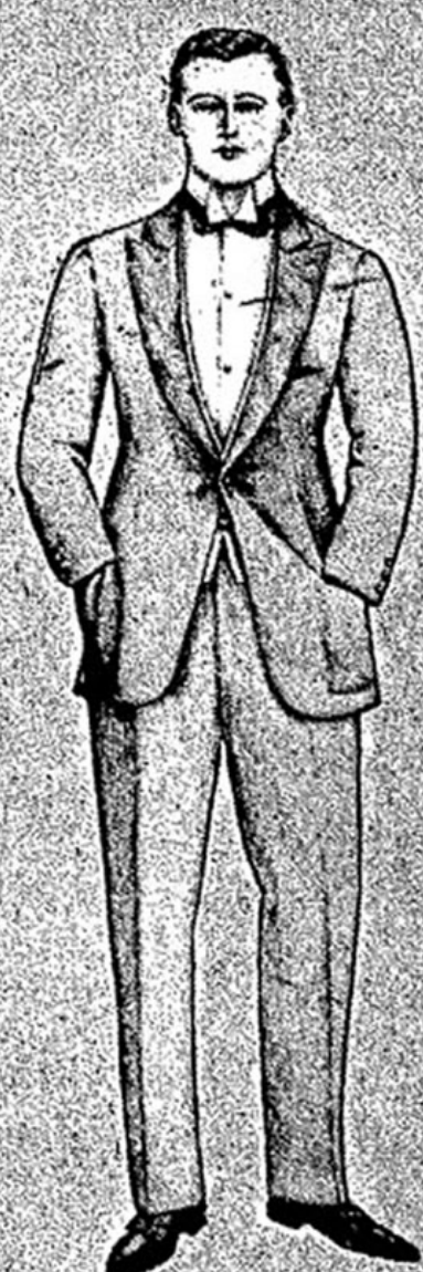
One button oxford gray dinner suit. Facings of dull silk. White piqué waistcoat that has rolled collar.

JEWELRY: There is so much offered, so much that may be suggested, it could be an article in itself. I think if a man is not sure he had best use as little as possible, and that as simple as possible, then he will be quite right. For him I would suggest two round pearls in the shirt bosom and mother of pearl links centred by a pearl in the cuffs, and plain white buttons on the waistcoat.