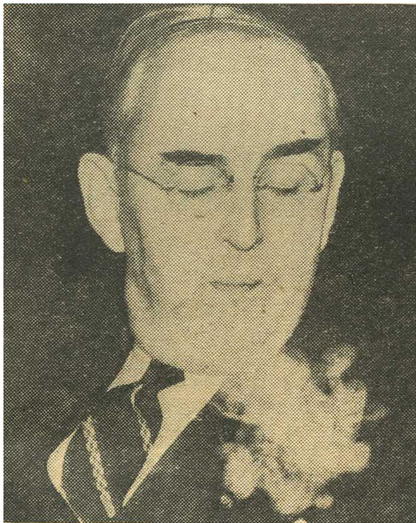
Vandenberg Wants a Mandatory Law

would not keep America neutral because this country would be placed in the position of favoring foreign powers who have strong navies—say, Great