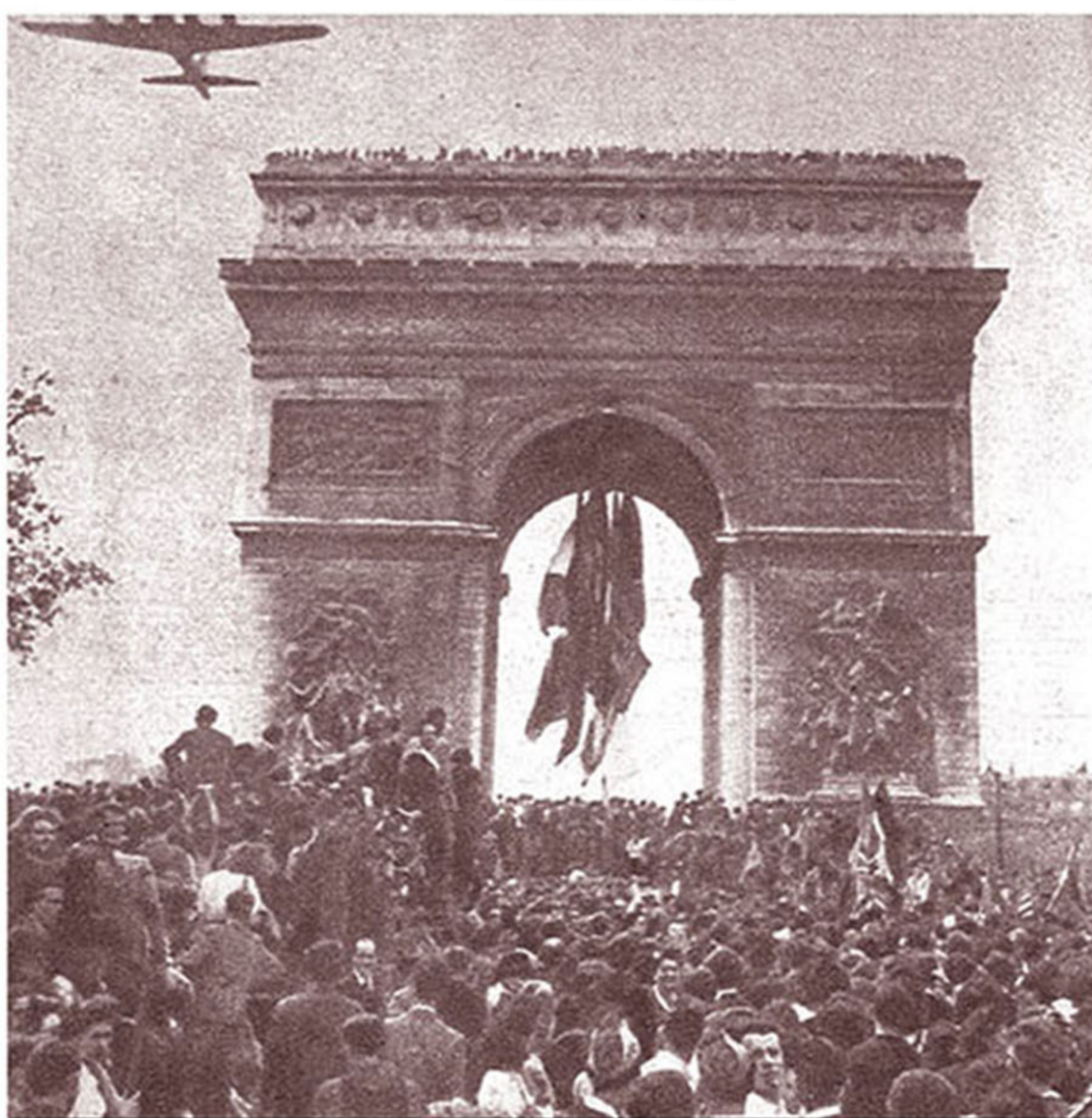
A Fortress buzzes the Arc as crowds gather to pay respects to Unknown Soldier

liberated by the Seventh Army and was now back home, one of 8,000 Frenchmen being repatriated daily. He looked thin but said he was rapidly gaining weight.