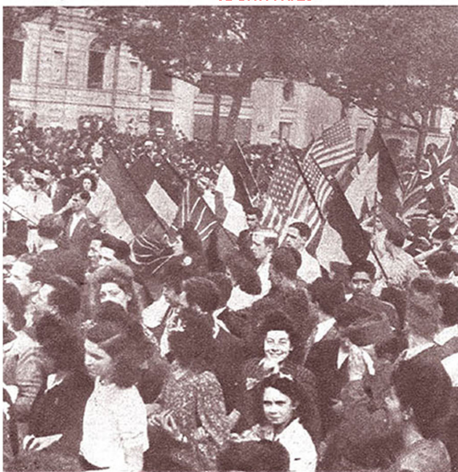
One of hundreds of student parades that jammed the Champs Elysees all V-E Day.

"Vive le President. Vive la Republique. Vive la France," the crowd replied.