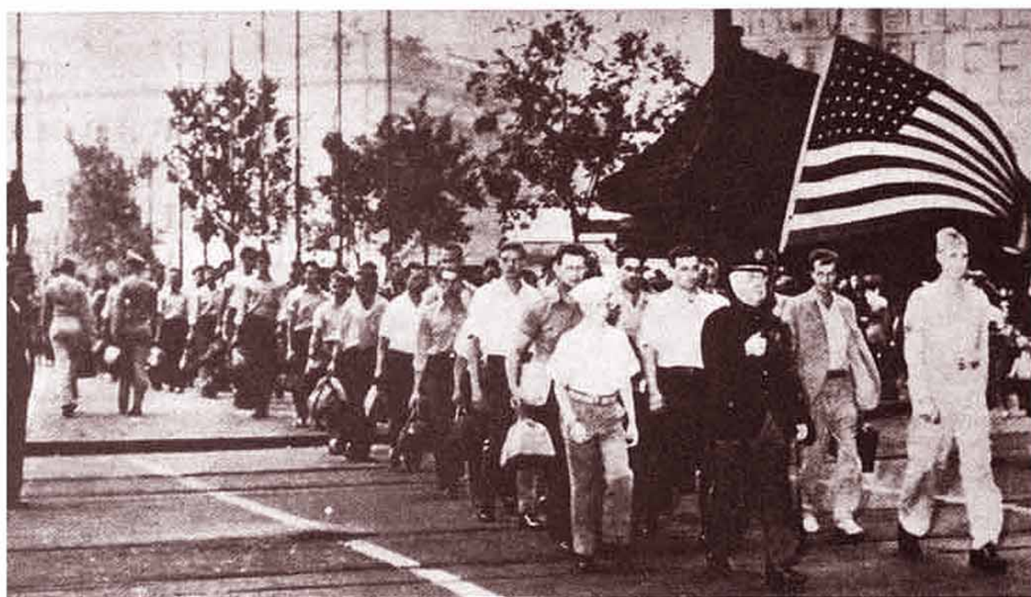
Victory didn't stop the draft. The day after Jap surrender these men were inducted in Cleveland.