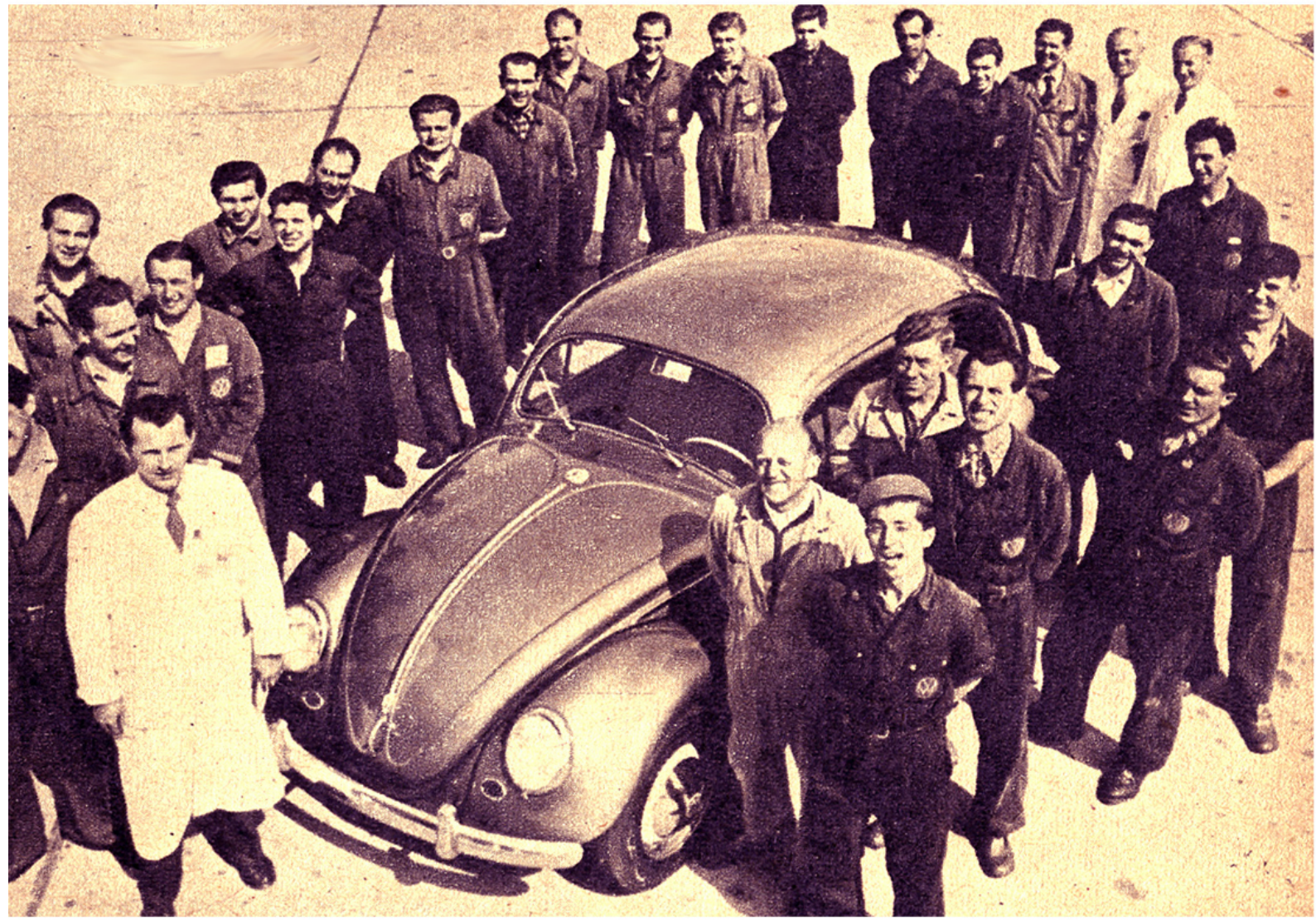
Proudly lined up are the 27 men who have a share in building each Volkswagen.