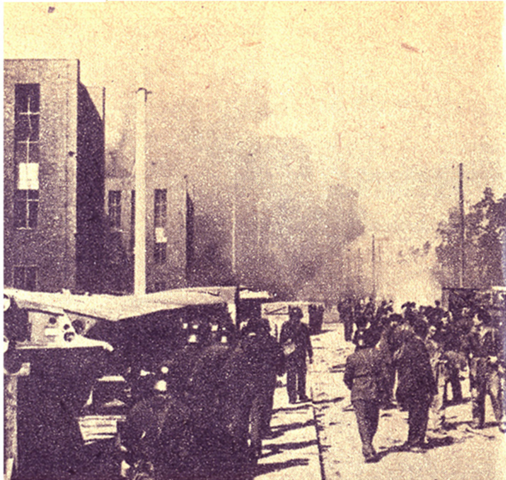
The works were heavily bombed during the last war and were 60 per cent destroyed.

As more cars were sold abroad, foreign countries introduced new restrictions on imports. Nordhoff countered by setting up assembly plants in Ireland, South Africa, Belgium, Brazil, Australia, and New Zealand. With a third production line coming into operation at Wolfsburg, his immediate target is over 1,000 cars a day.