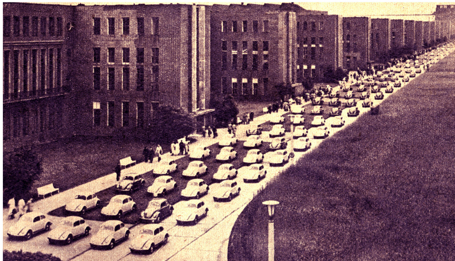
Just one day's output from the revived auto plant, leading all European makes.