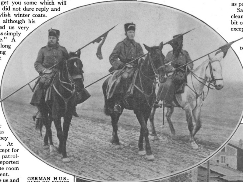
GERMAN HUSSARS ON SCOUT DUTY

Germany's cavalry has been most serviceable in the eastern war area, where the conditions have favored this arm of the service.