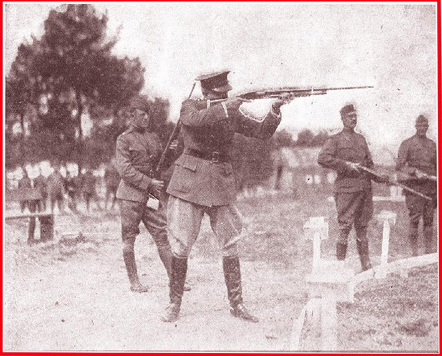
A hitherto unpublished picture of the General firing a repeating shotgun at a trap shoot near Le Mans, France, in June, 1919. He missed the first bird, but got the second

since the war. The orator erected an eloquent climax which he capped by quoting the General as having exclaimed: