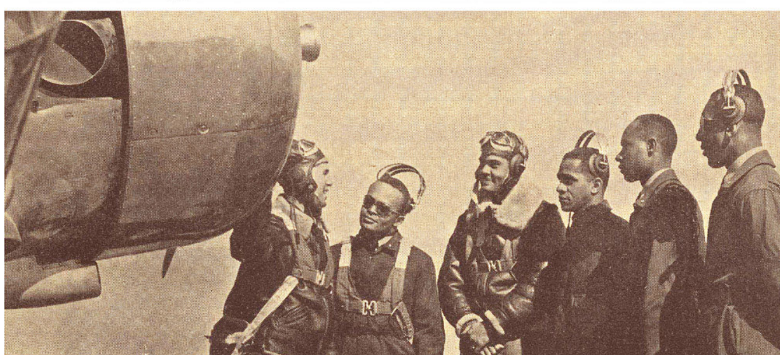
"WINGS" FOR NEGRO ARMY PILOTS: Their class made history for their race

Industry's Complex Problem in Meeting Demands for Job Equality