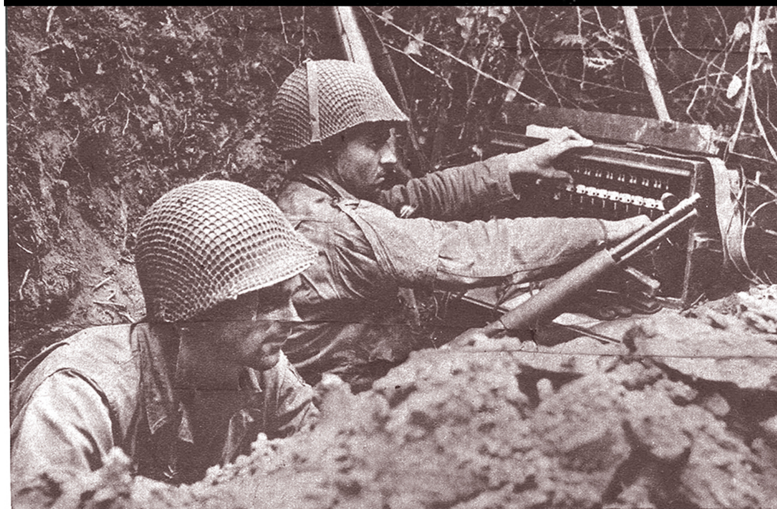
This fancy front-line switchboard is nerve center of communication for dug-in combat infantryman in France.