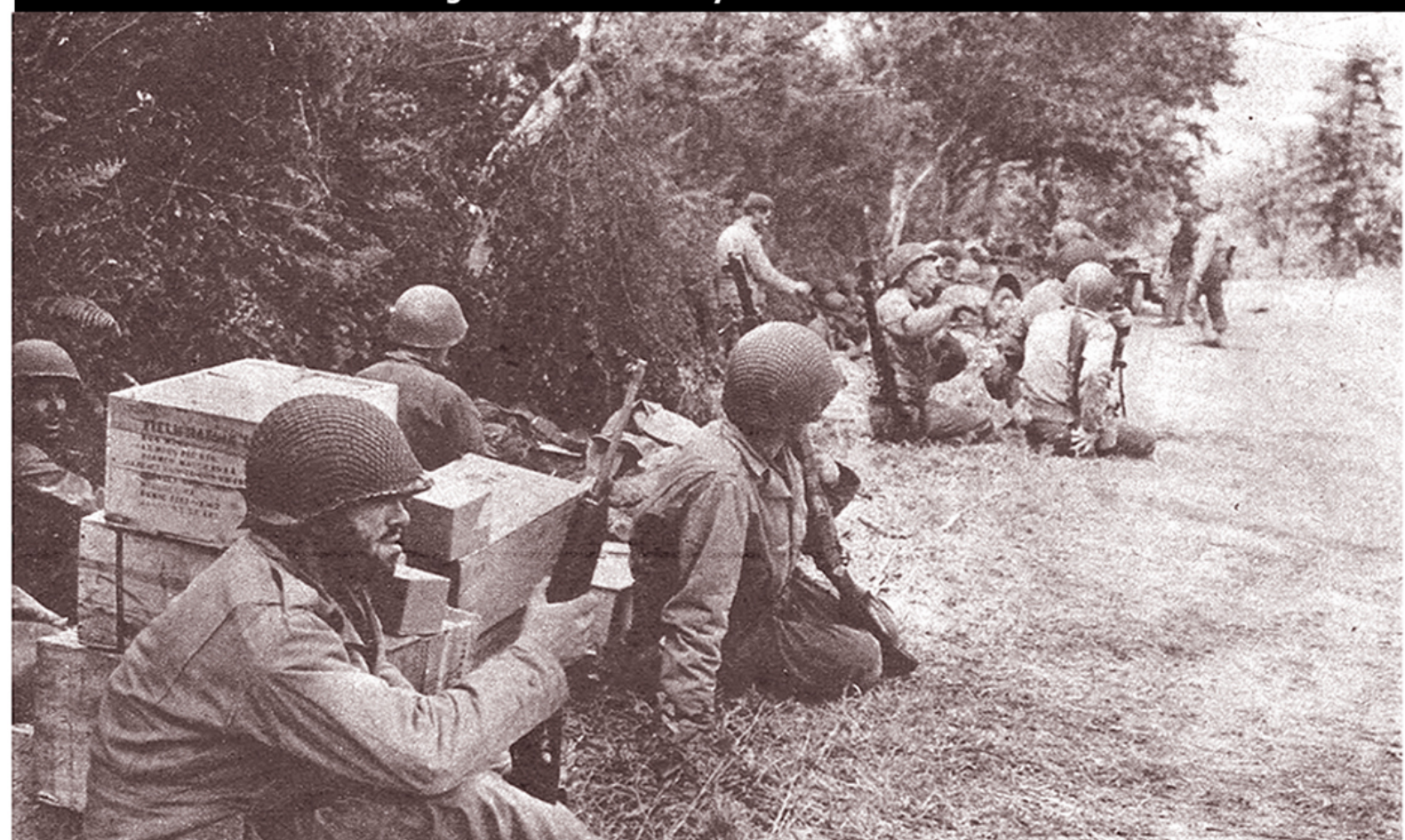
American infantrymen, unshaven but alert, rest with their supplies along the roadway in a combat zone

W ITH THE 2D ARMORED DIVISION IN FRANCE [By Cable]—It was the morning of the beginning of the biggest drive since the Allies had invaded the shores of Normandy. The immediate objective of Combat Command A was to advance and capture certain key heights. Nobody dreamed our tanks would be sweeping across Brittany and through the streets of Brest 10 days later.