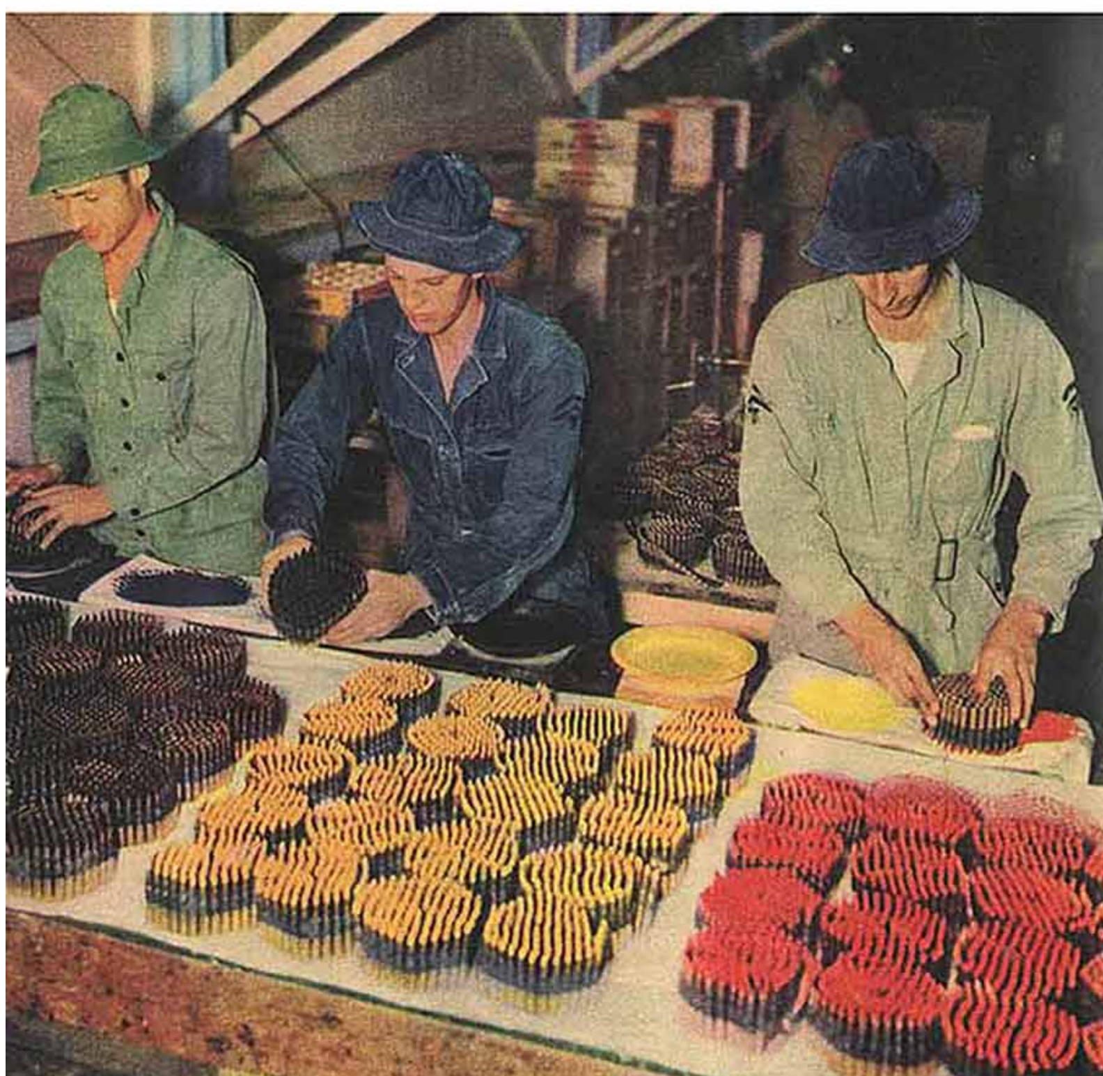
MACHINE-GUN BULLETS are dipped in specially prepared, vivid paints to stain the target. A different color is assigned to each gunner, so that his score can be controlled.