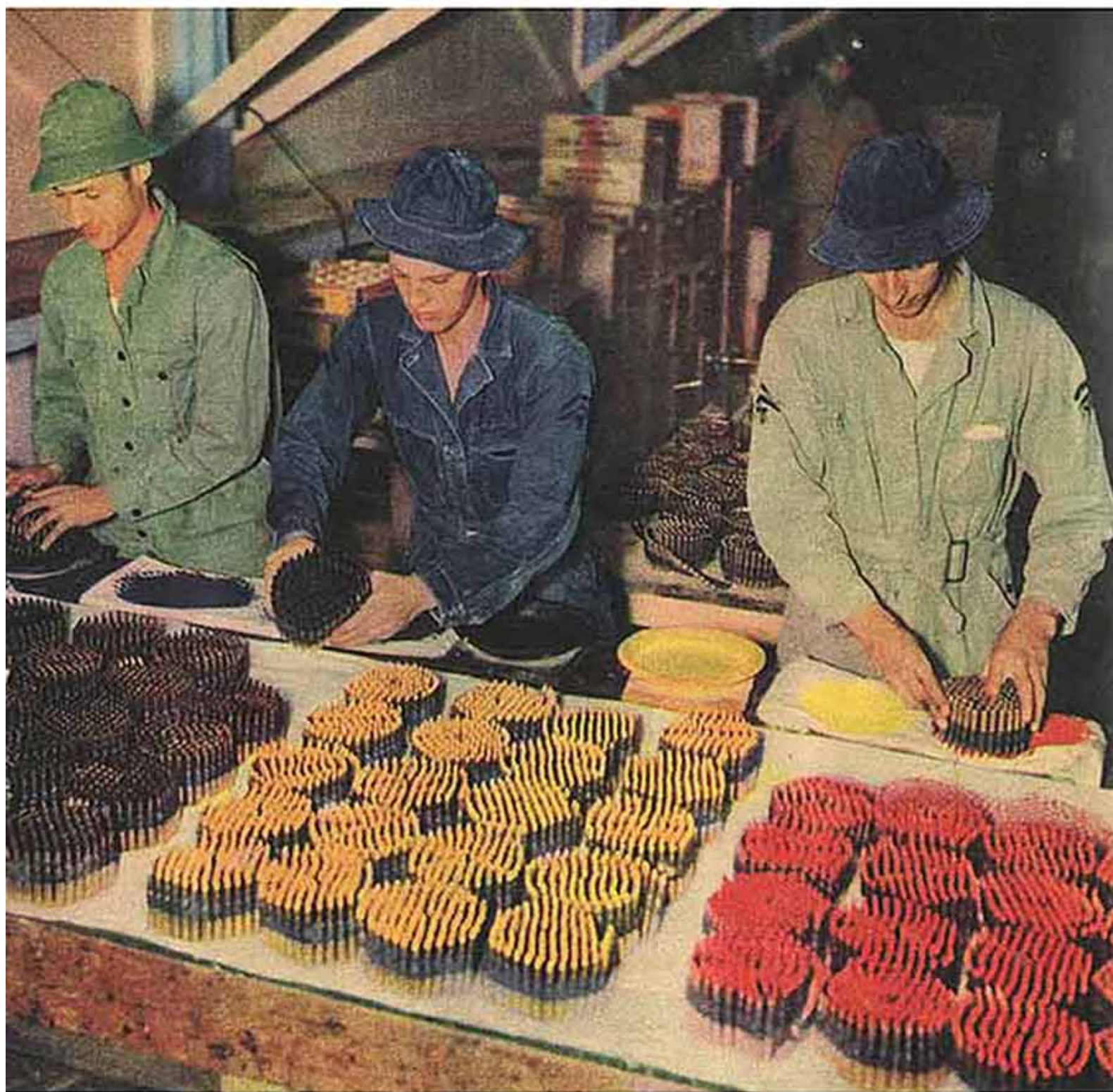
MACHINE-GUN BULLETS are dipped in specially prepared, vivid paints to stain the target. A different color is assigned to each gunner, so that his score can be controlled.