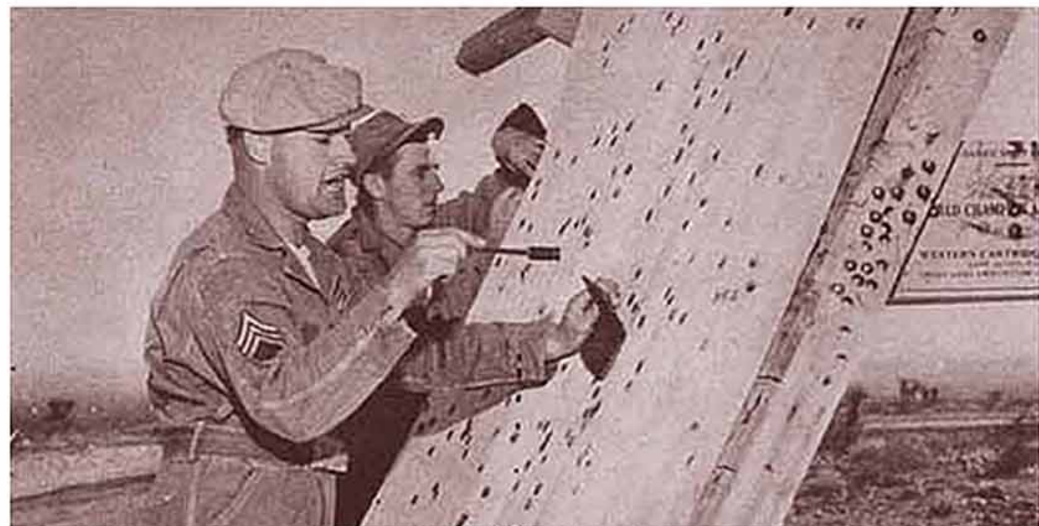
PRELIMINARY TRAINING takes place on ground, where men shoot at stationary targets such as this one. Later they practice from trucks, then in plane.