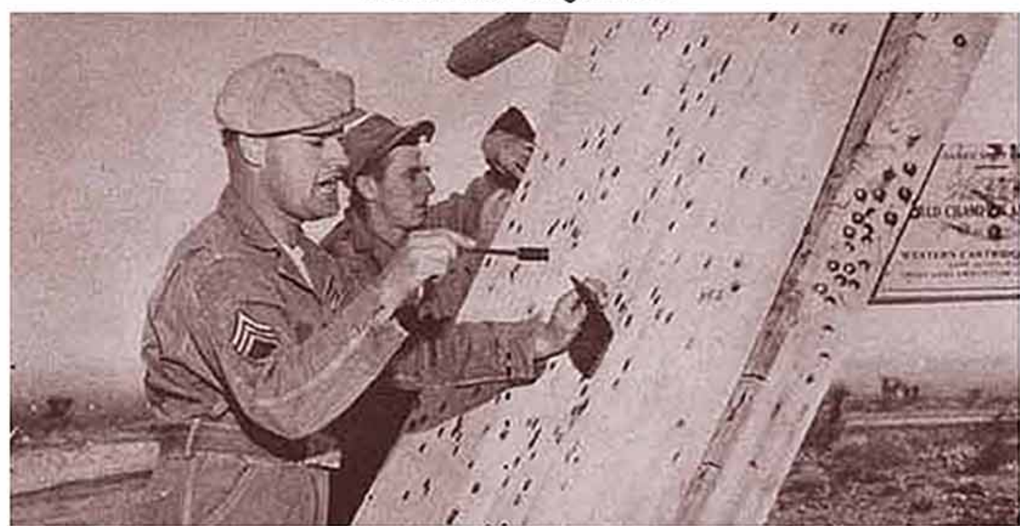
PRELIMINARY TRAINING takes place on ground, where men shoot at stationary targets such as this one. Later they practice from trucks, then in plane.