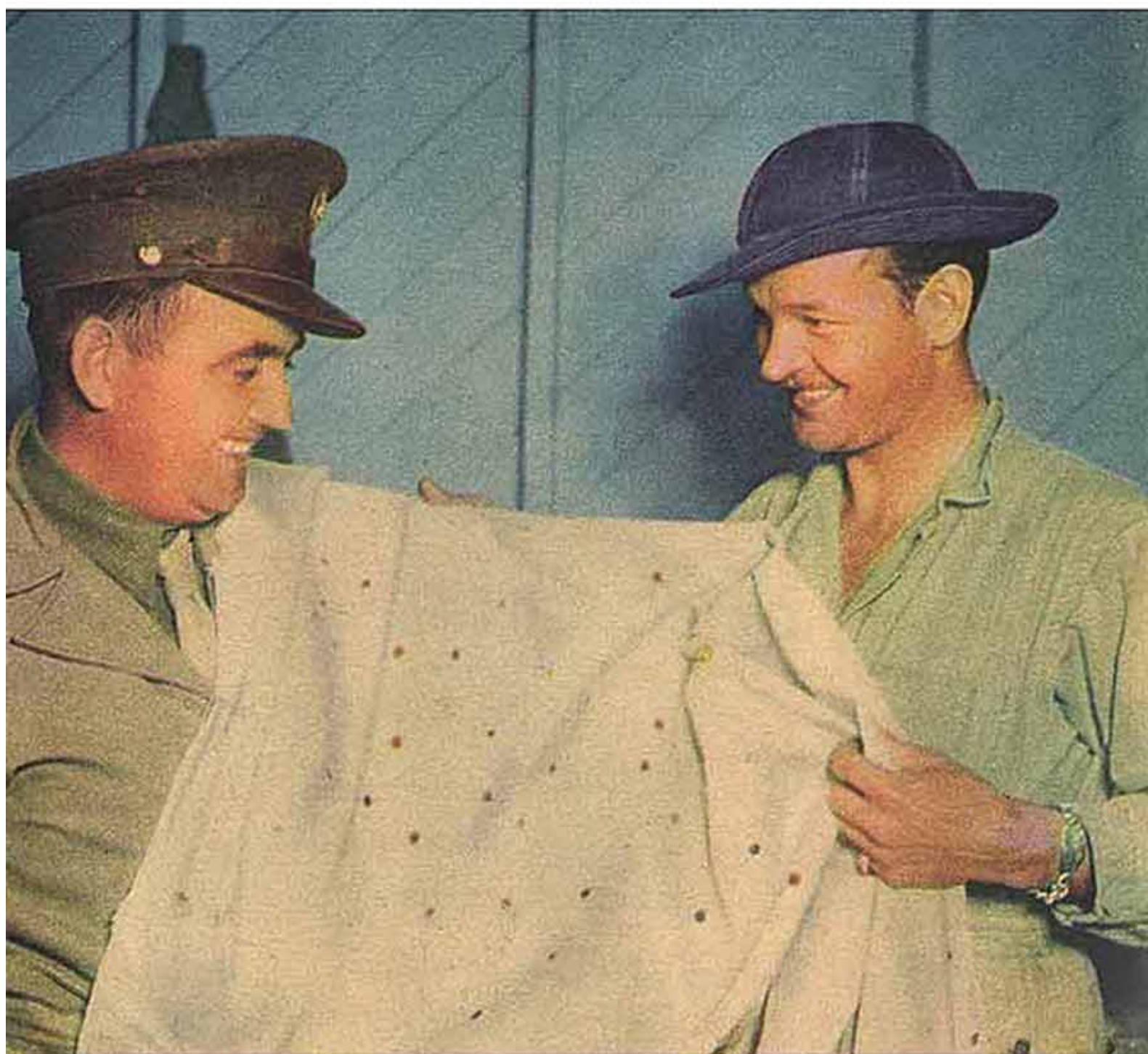
INDIVIDUAL SCORES made on a target sleeve are computed by the colored markings left by the bullets. Men who fail after five weeks of training are "washed out" as gunners.