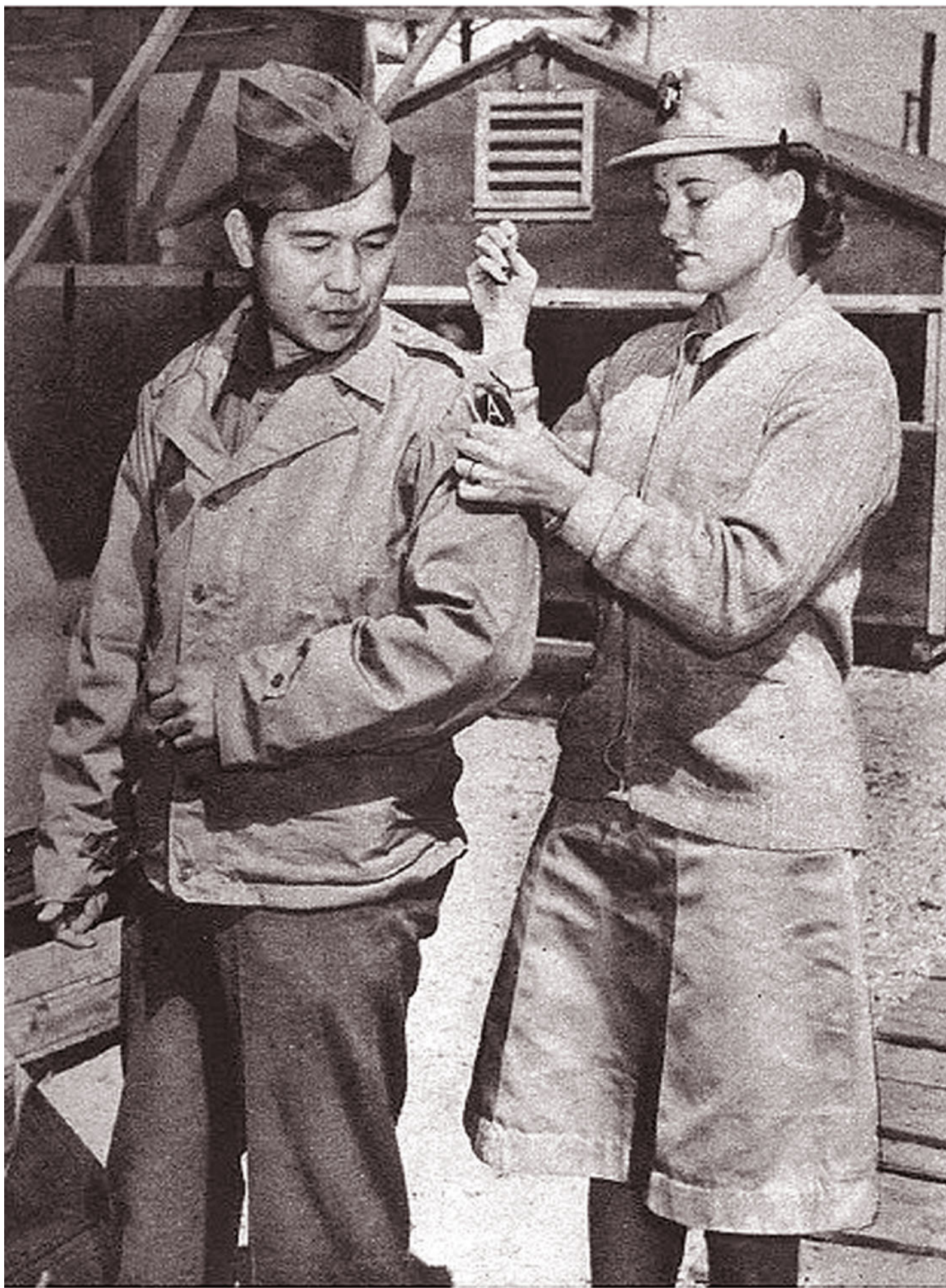
WAAC SEWS ON INSIGNIA for Japanese-American soldier at Camp Shelby. These soldiers are full members of our fighting forces and many of their officers have seen long Army service.