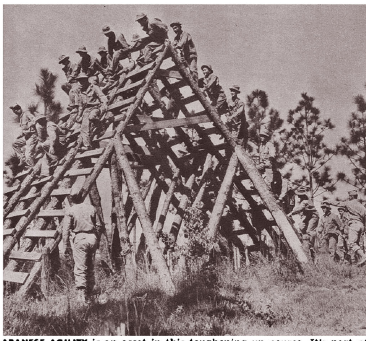
JAPANESE AGILITY is an asset in this toughening-up course. It's part of training for these men of the unit at Camp Shelby. Officers are unstinting in their praise of the willingness and determination of these soldiers to exceed the training schedules.