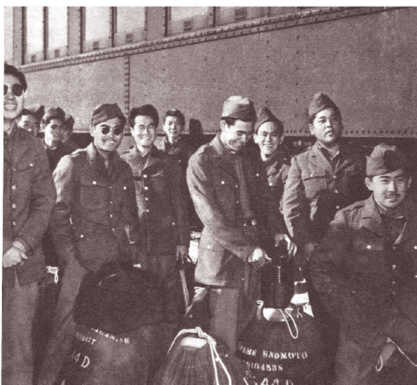
NEWLY ARRIVED VOLUNTEERS look forward eagerly to their U. S. Army training. Double-checked for loyalty, these products of American educational institutions are determined to get into the fight for their adopted country's freedom.

Democracy Outweighs Blood Ties For These Determined "Nisei"