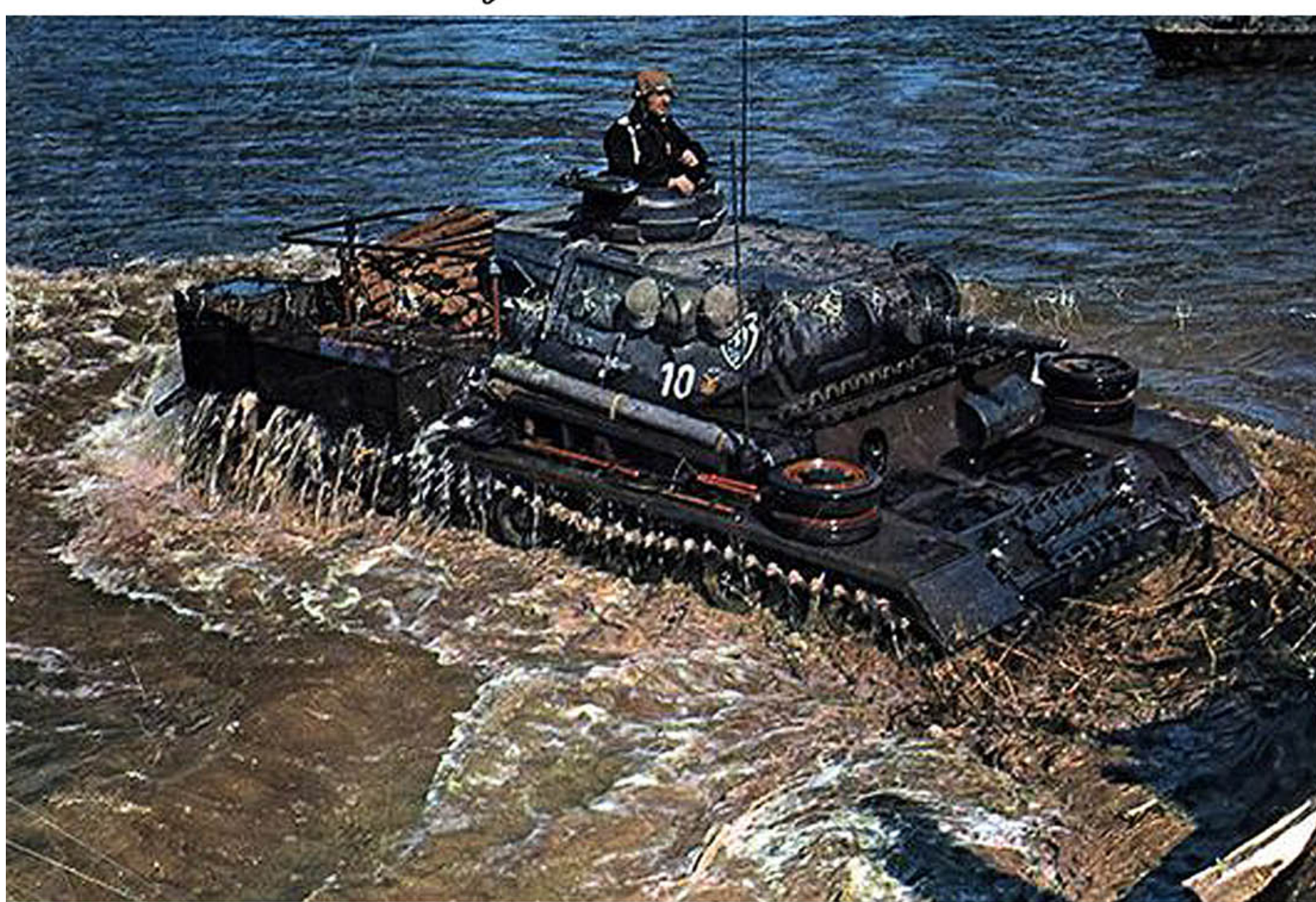
A German tank crossing the Ourcq River. Below, a troop carrier with caterpillar tread rumbles through a captured town