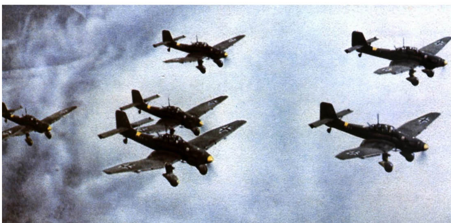
Stuka Dive-Bombers over France

"Have you a permit to receive them?" asked the non com in charge.