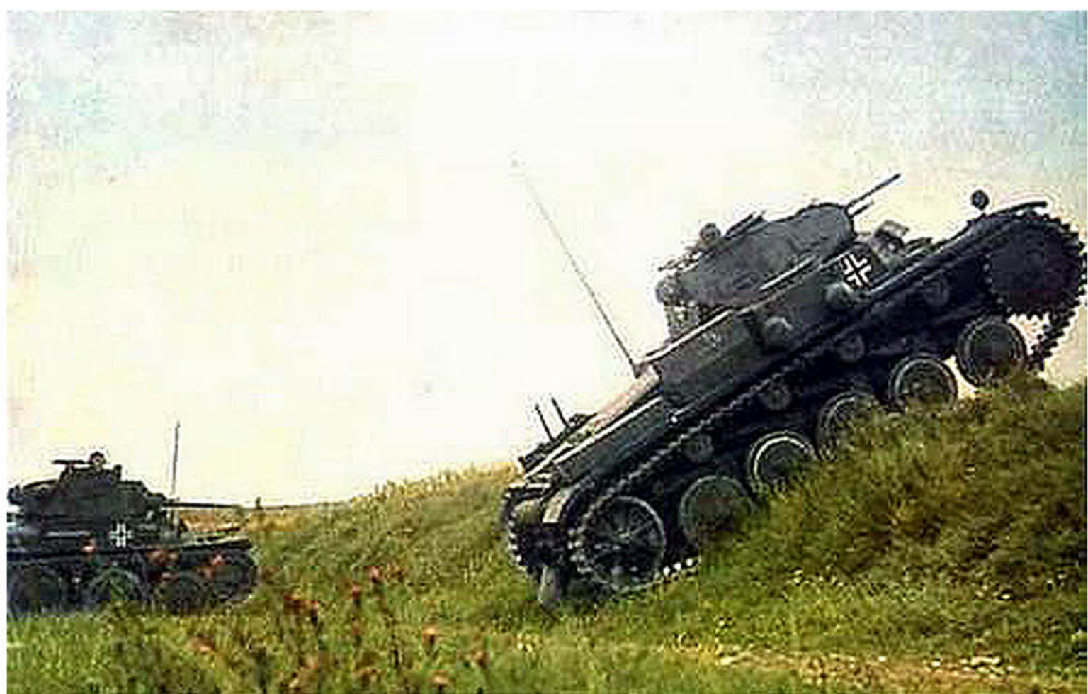
The Panzer II in Open Country

“ENTER and hold the railroad station until the infantry arrives.”