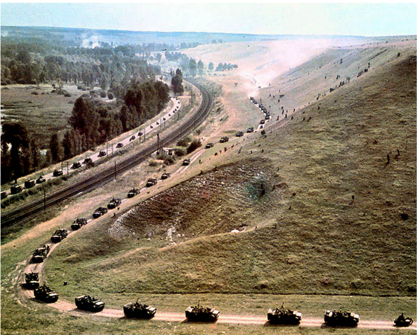
An Image of the 1940 Blitzkrieg: the 7th Panzer Rolls Through France

pulse attacks, once even putting an armored train to flight with an anti-tank gun. All along we gather in prisoners and booty, taken off our hands by the troops behind.