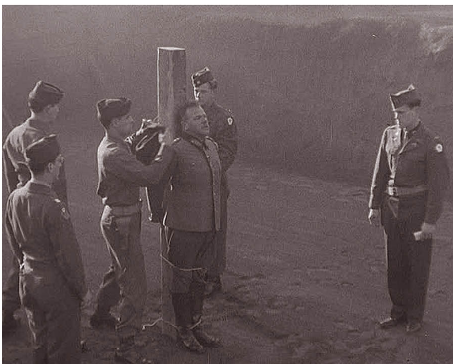
THE EXECUTION OF GENERAL ANTON DOSTLER (IMAGE ADDED)