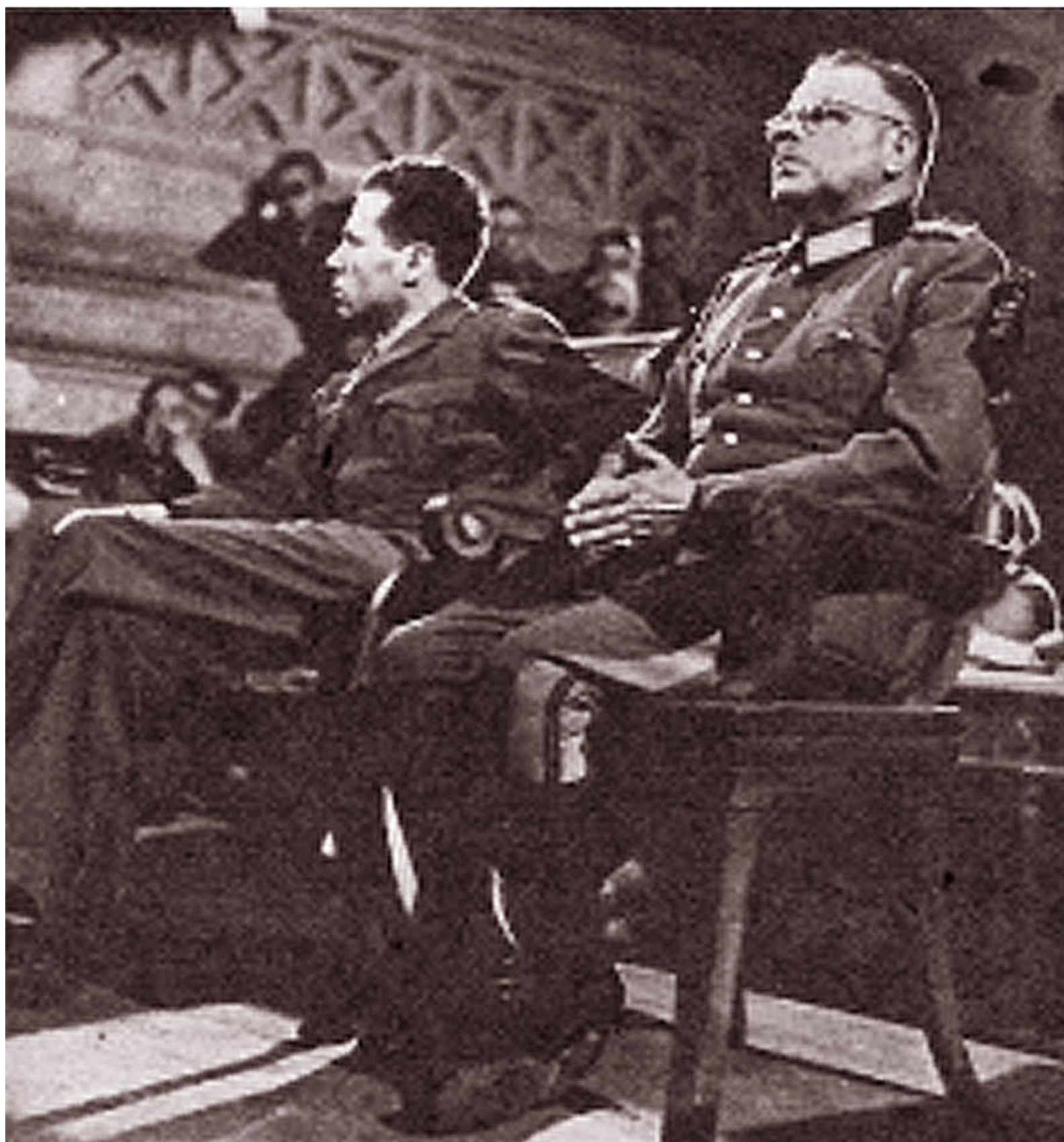
On the stand Dostler tells the commission he was acting under orders from Hitler and Field Marshal Kesselring when he ordered execution of the OSS Commandos.

The trial was carefully watched by virtually the entire world press, since the issue—whether all Nazi war crimes may be attributed to Hitler alone and whether "obeying orders from above" is a valid defense for illegal acts of war—was tested here for the first time.