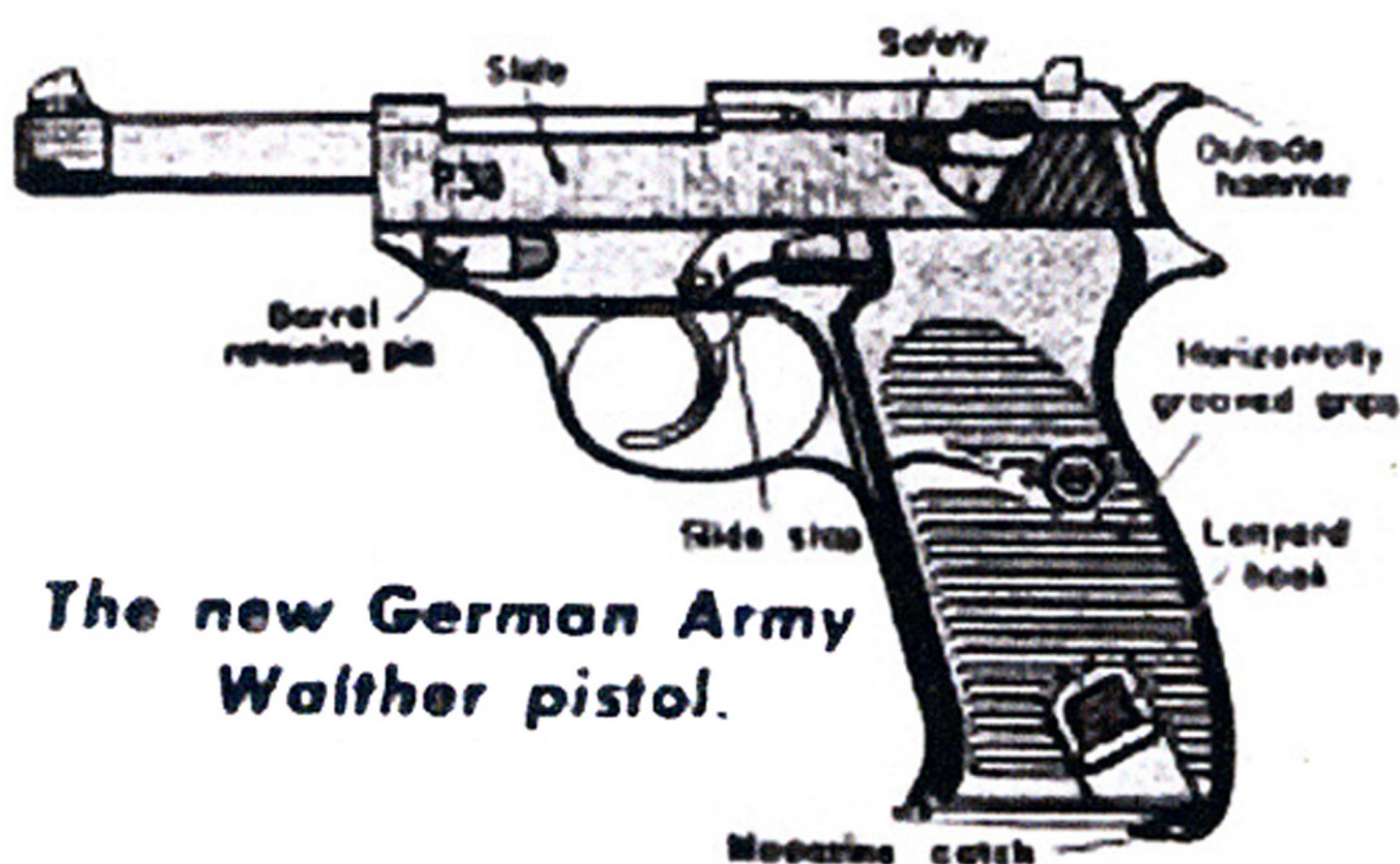
The new German Army Walther pistol.

T HE Walther, officially called Pistole 38, is coming into more and more general use as a standard issue in the German Army. Eventually it may replace the Luger. Although the Walther lacks the stopping of the U. S. M1911 Colt .45, it is nevertheless a handy weapon because of its double-action feature and its good balance.