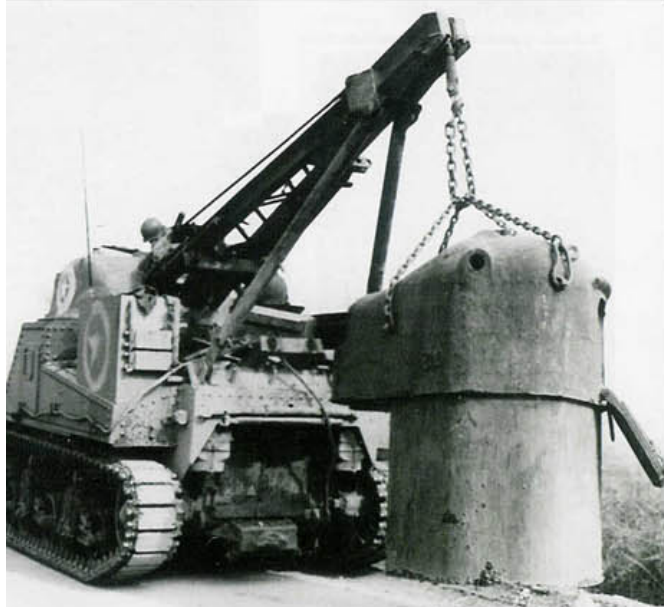
U. S. tank hauls away a pillbox which had been dug out of its position along the Gustav line near Cassino.

One of the additions to German defensive warfare is the portable pillbox. The Nazis used it in Russia and now the Allies are meeting hundreds in Italy. These pillboxes, made out of cast iron, with a top like an inverted kettle, are about five feet wide and some six feet high, but only a six-inch dome and a machine-gun snout can be seen by a soldier attacking them. Each pillbox is manned by two soldiers. To move the pillboxes the Germans tow them away on a special carriage or load them on a truck. Then they can be dug in and surrounded by rubble or earth so that they can be seen from only a few yards away.