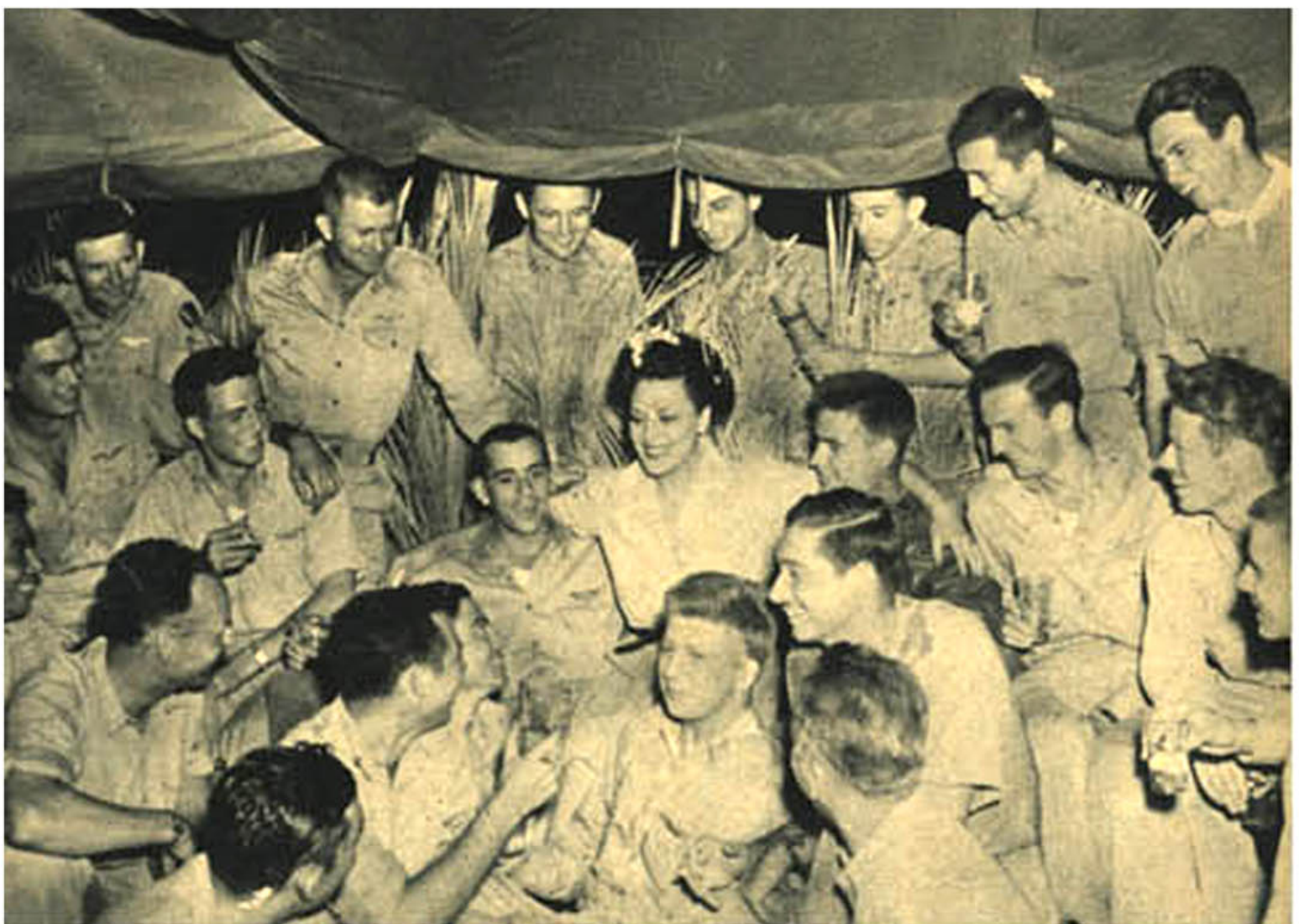
WINI SHAW has been voted Sweetheart of the World War II AEF by servicemen the world over whom she met during her four overseas trips for the USO. She headed the first unit to go abroad after Pearl Harbor.