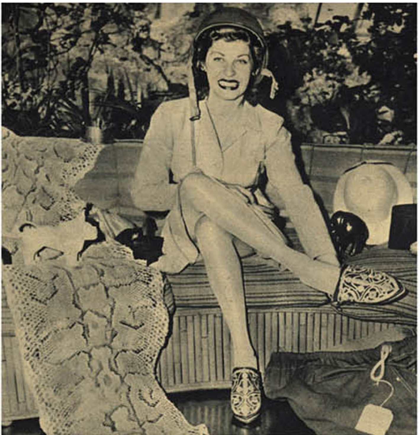
SOUVENIRS picked up during her four-months tour of North Africa are assembled around Martha Raye (above) after her return to the States.