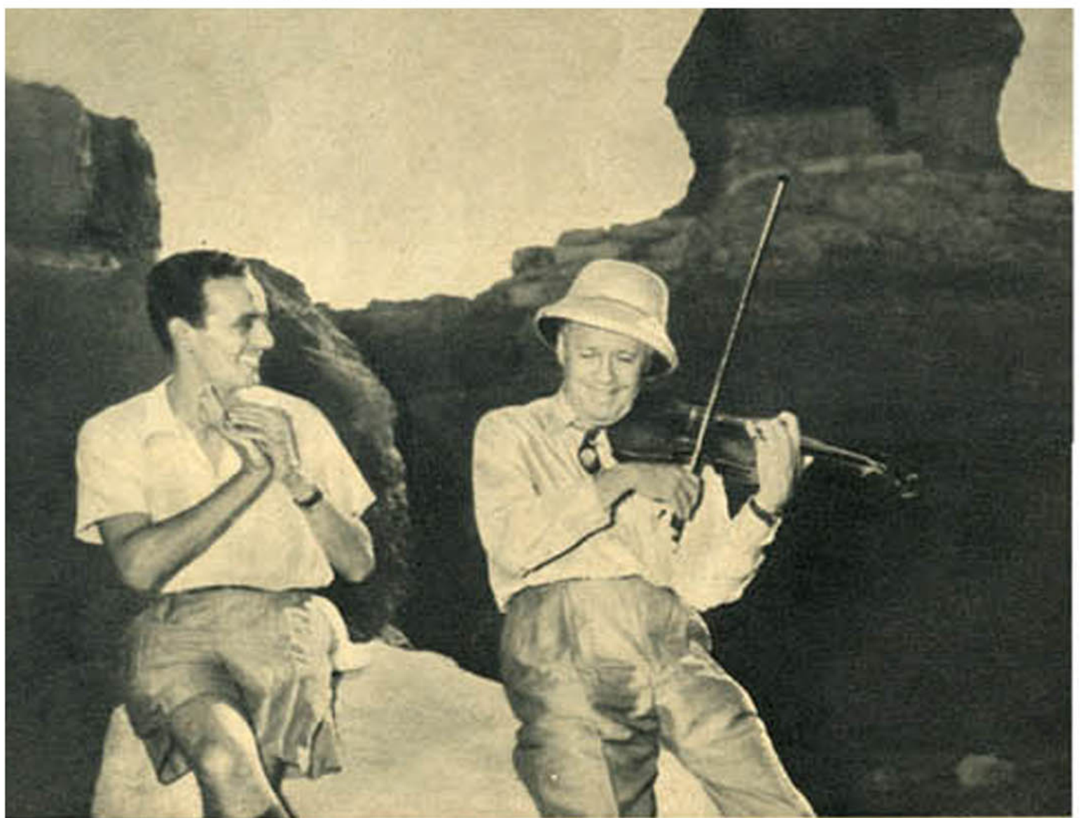
THE SPHINX looks down in awe when harmonica virtuoso Larry Adler and violinist torturer Jack Benny (above) do a duet in Egypt.