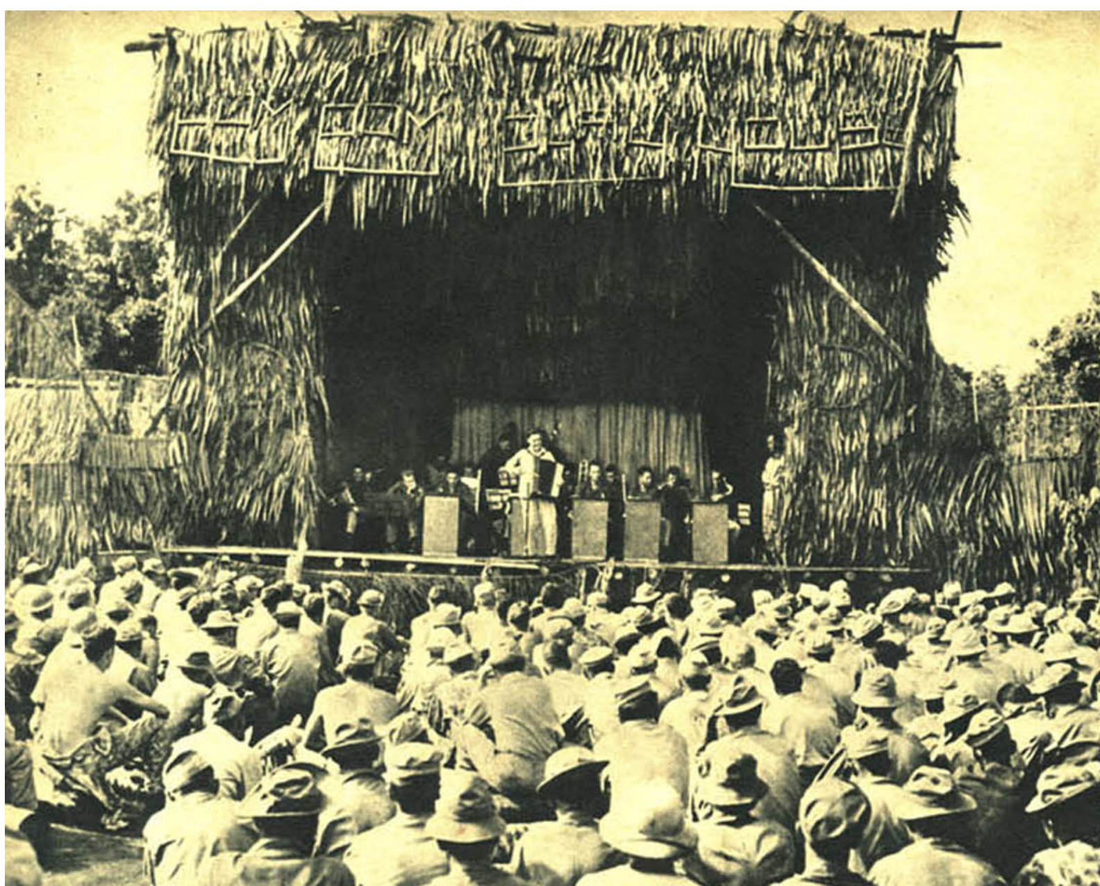
U. S. O. CAMP SHOW PEOPLE ENTERTAIN APPRECIATIVE SERVICEMAN AUDIENCES THE WORLD OVER. HERE THEIR THEATER IS A THATCHED AUDITORIUM IN NEW GUINEA