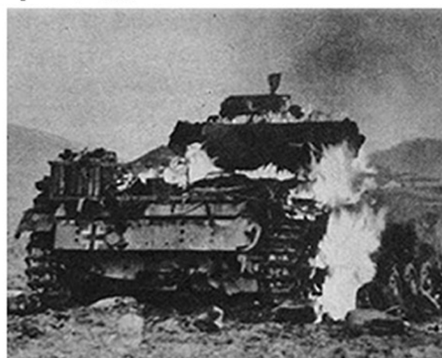
"He also serves who sits and burns." A Nazi big one serving the Allied cause in Tunisia.