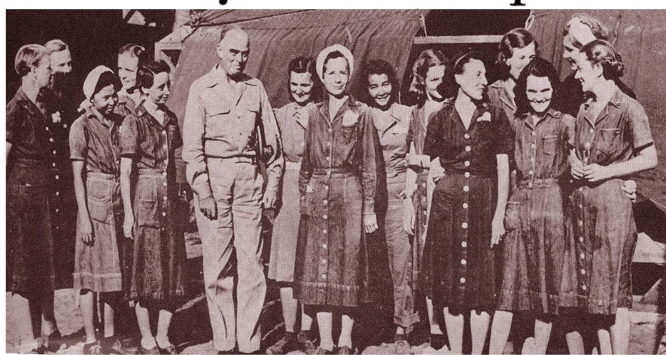
Below: Dramatically rescued after 37 months as prisoners of the Japs, these Navy Nurses were awarded the Bronze Star. Photographed with Admiral

Thomas C. Kincaid, USN, they are wearing uniforms made in prison from ripped-up dungarees. During their imprisonment they worked ceaselessly to care for their fellow internees.