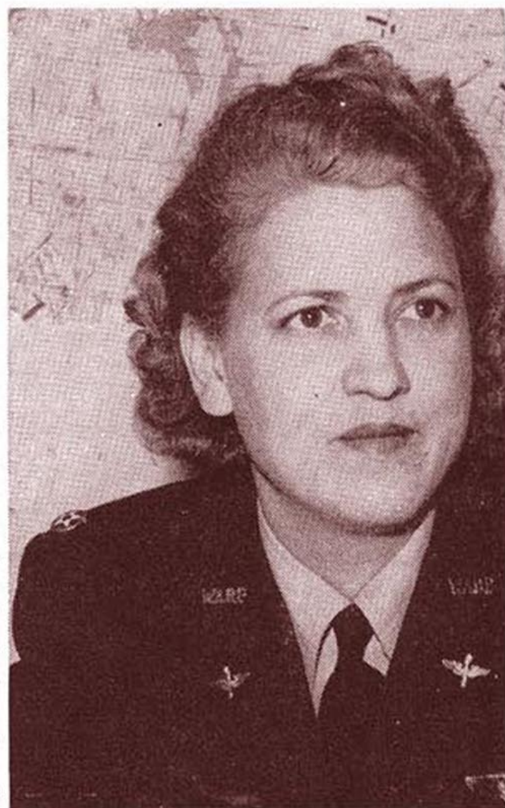
MISS JACQUELINE COCHRAN, Director, Women Pilots Program