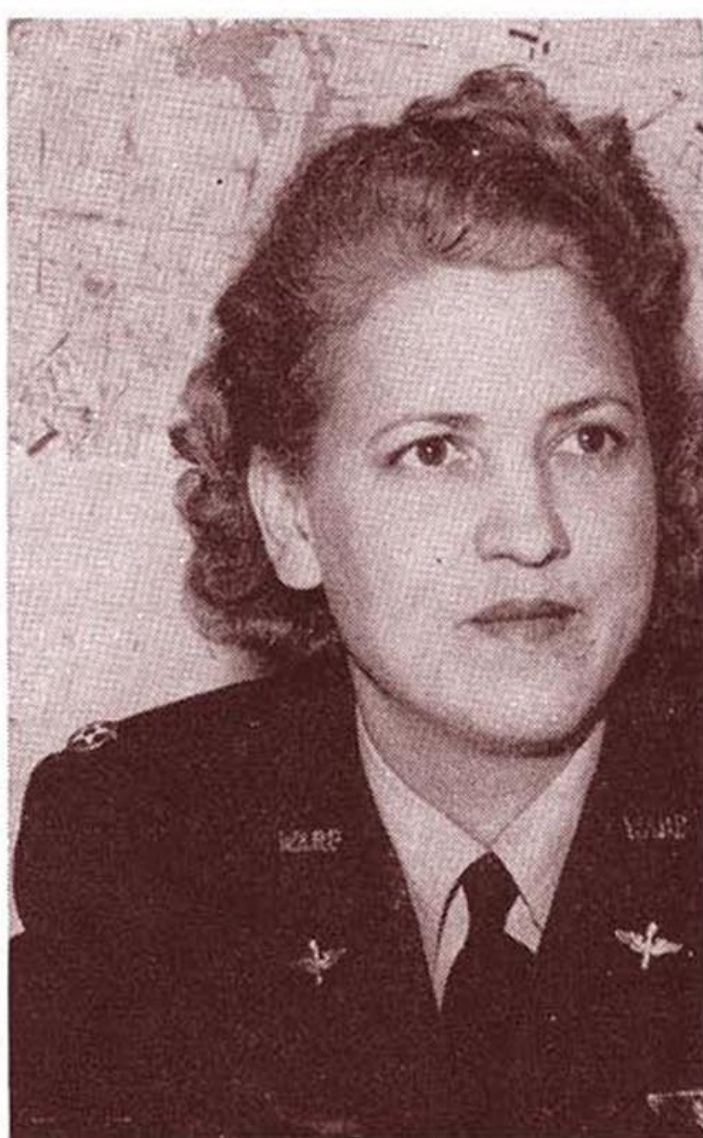
MISS JACQUELINE COCHRAN, Director, Women Pilots Program

The original work of women pilots in the United States was activated in September of 1942 in two steps. One was the formation of an experimental squadron of experienced women pilots to do ferry work in the Air Transport Command, known as the WAFS, or Women's Auxiliary Ferrying Squadron. The other step was the initiation of a training program for women pilots to provide all those which would be used except for the WAFS.