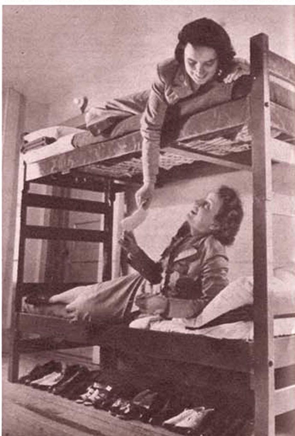
DOUBLE-DECKER BEDS were moved into Daytona's best hotels to make room for Uncle Sam's female military corps. Lucky WAACS bunk as above; the overflow takes quarters in Tent City area.