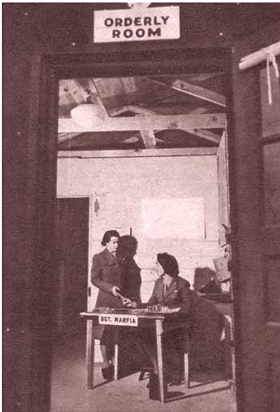
THIS TENT CITY ORDERLY ROOM is the seat of barrack operations. Company mother, the First Sergeant assigns Army chores and acts as a liaison for 200 WAACS and their company commander.