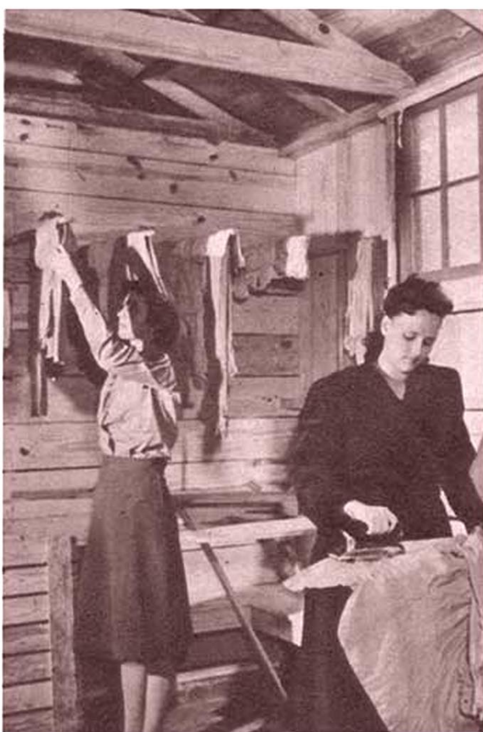
LAUNDRIES ARE JAMMED on Saturdays since most of the girls try to cut expenses and do their own washing and ironing when off duty. The fatigue overalls and velvet housecoat worn here are G. I.