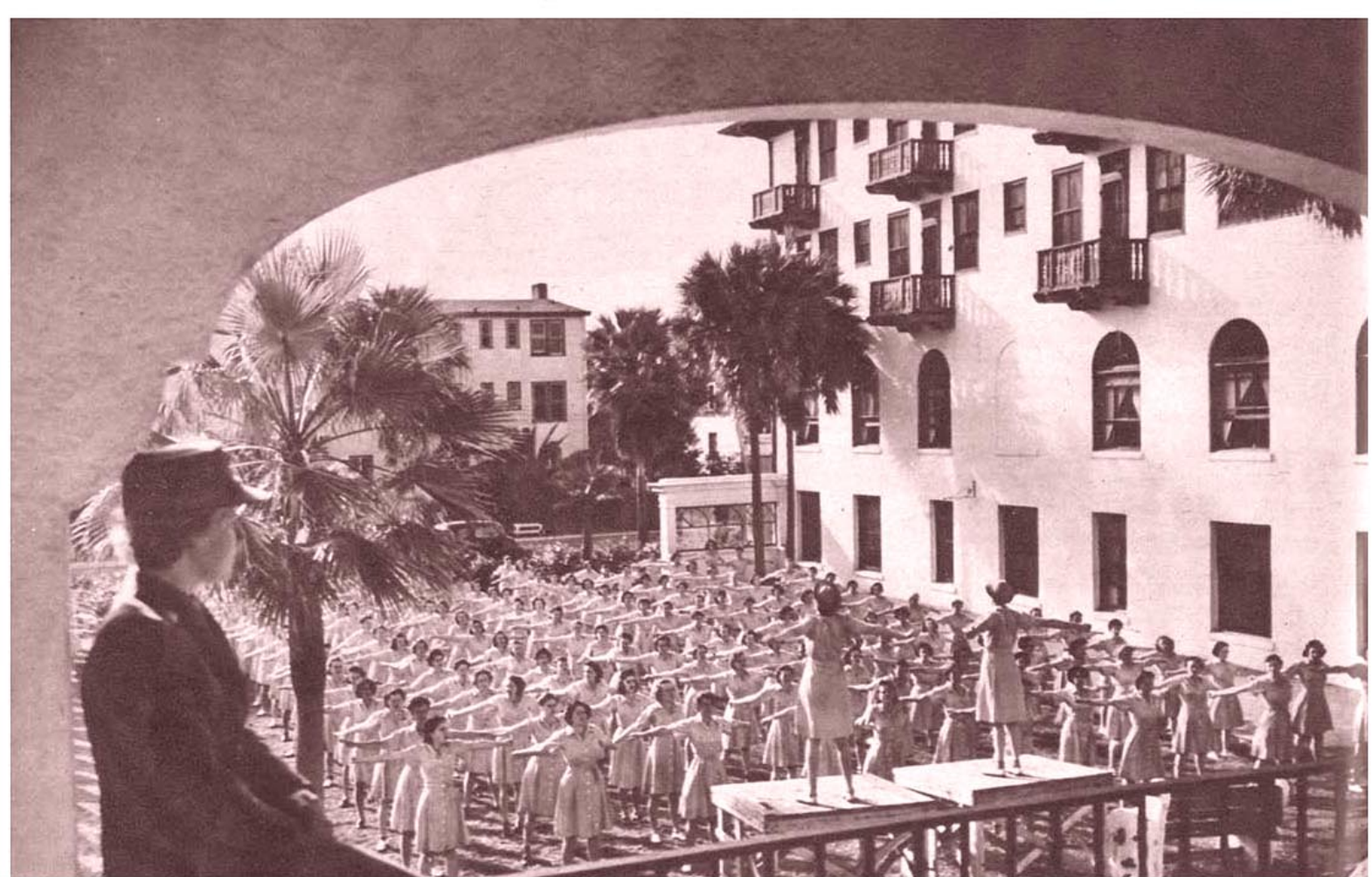
FORTY MINUTES DAILY OF COMPULSORY CALISTHENICS , SUPERVISED BY PHYSICAL EDUCATION SPECIALISTS, PROMOTE STAMINA AND COORDINATION