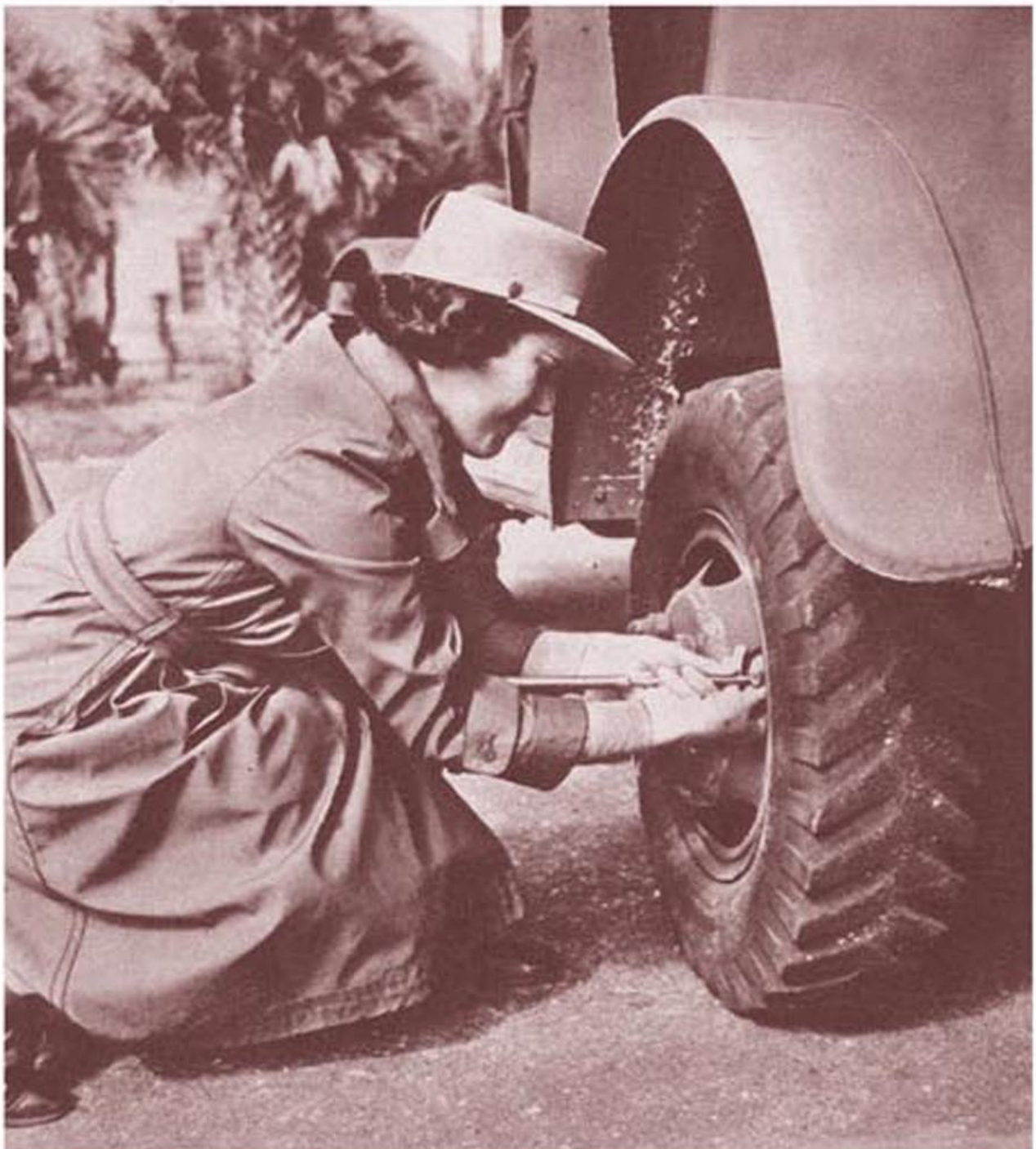
WAACS SERVICE THEIR CARS and check tire pressure before every trip. They are financially responsible for damage done to Army property due to negligence, therefore drive cautiously. Details call for the chauffeuring of officers or the transportation of Army supplies.

To help you see these U. S. Servicewomen as Floridians see them and to give you a closeup of their barrack life, CLICK photographs the Women's Motor Corps at work and at liberty . . . from reveille to bedcheck.