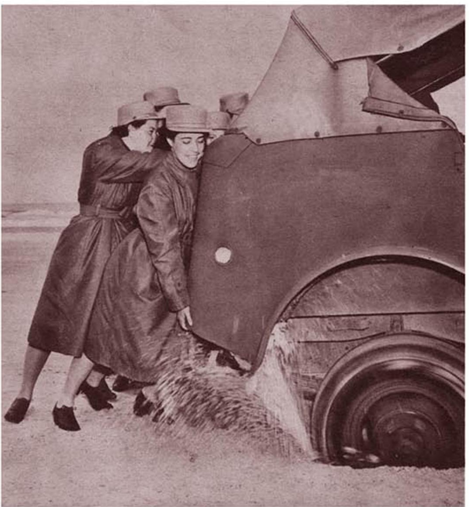
KEEP THE CONVOY MOVING is a watchword in the Motor Transport Corps. When cars are trapped in a sand ditch (a common occurrence since this unit trains along the beach), WAAC drivers rush forward to hoist and help. They're dressed for it, too — utility coats are made to stand the gaff.