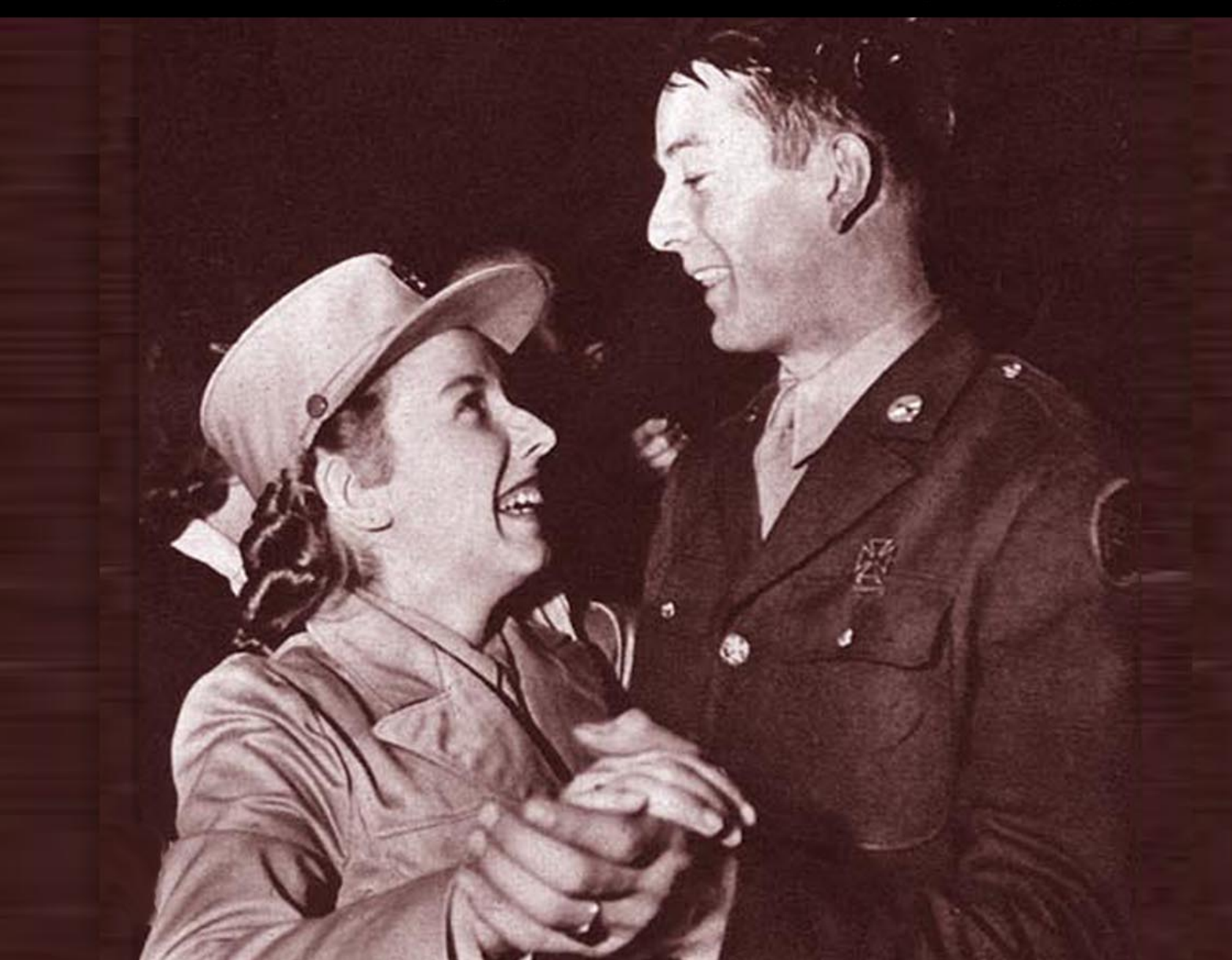
SATURDAY NIGHT DANCES attract WAACS and servicemen from more than 150 miles away. Sponsored by the local Chamber of Commerce, "hops" are held in the Military Service Club where 10-cent admission fees pay for an eight-piece orchestra. Female M. P.'s see that the girls make 1:30 bedcheck.