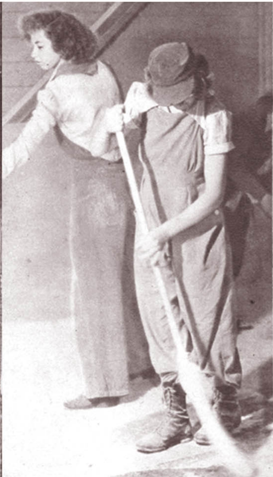
MIXING FEED FOR THE ANIMALS is gruelling work. Putting aside feminine egos while on the job, farmer aides must wallow in swine pens, run manure spreaders, curry beasts, clean troughs and whitewash barns. Long fingernails are cut short but girls usually insist on polish.