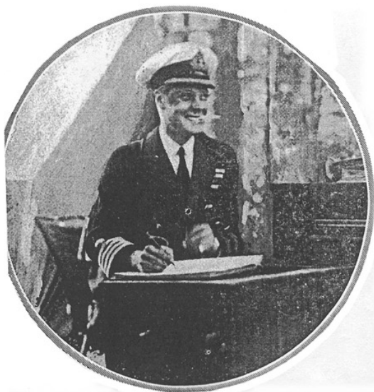
The Prince of Wales, with an air of one well contented with his surroundings, signed the guest's register at the Studley Quoit Club in Halifax