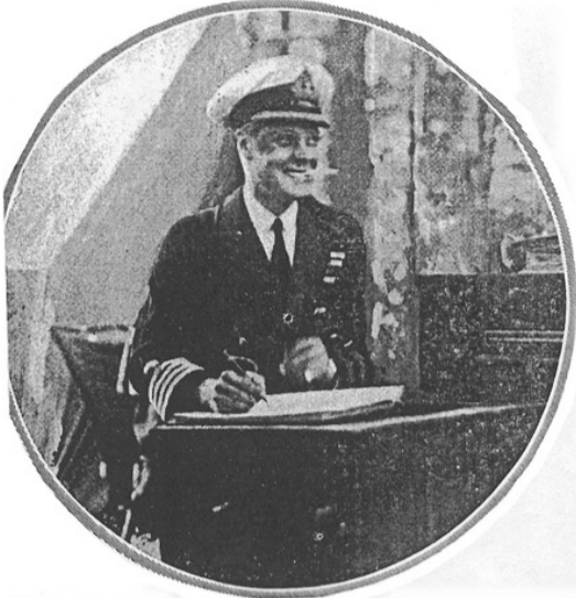
The Prince of Wales, with an air of one well contented with his surroundings, signed the guest's register at the Studley Quoit Club in Halifax