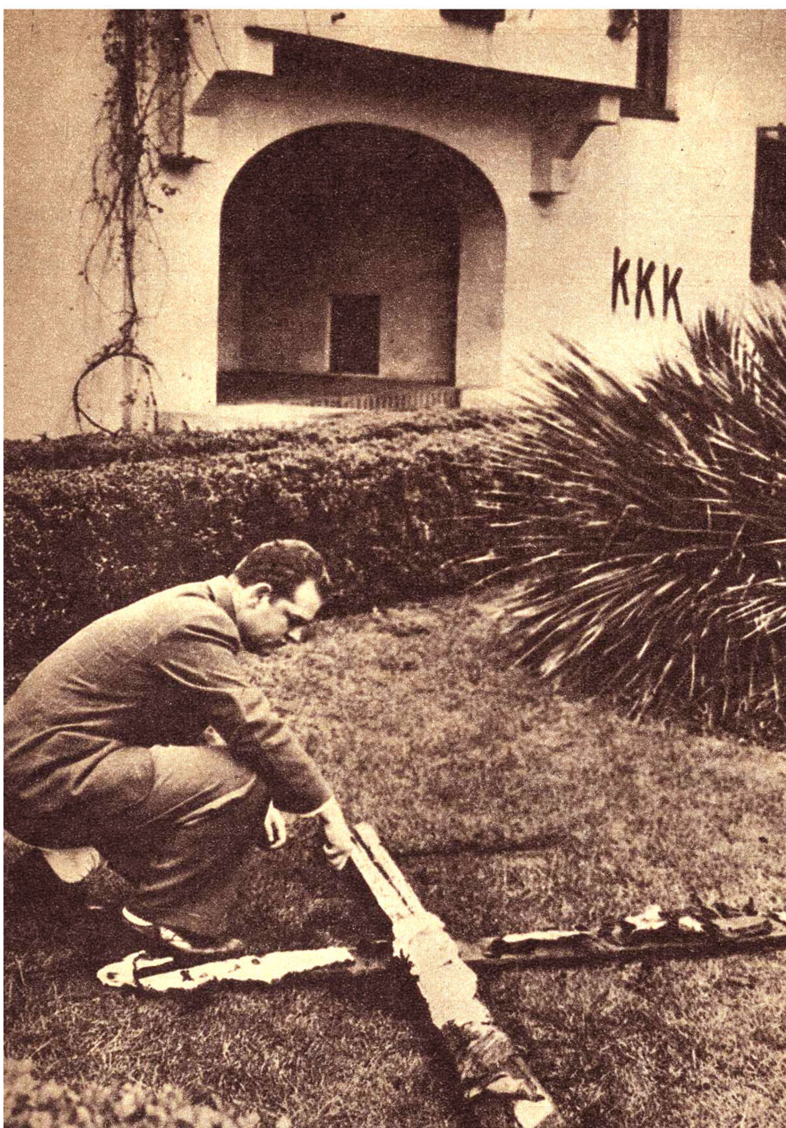
Investigator examines charred cross set afire on lawn of University of of Southern California chapter of the Zeta Beta Tau (Jewish) fraternity. "KKK" was painted on housefront.