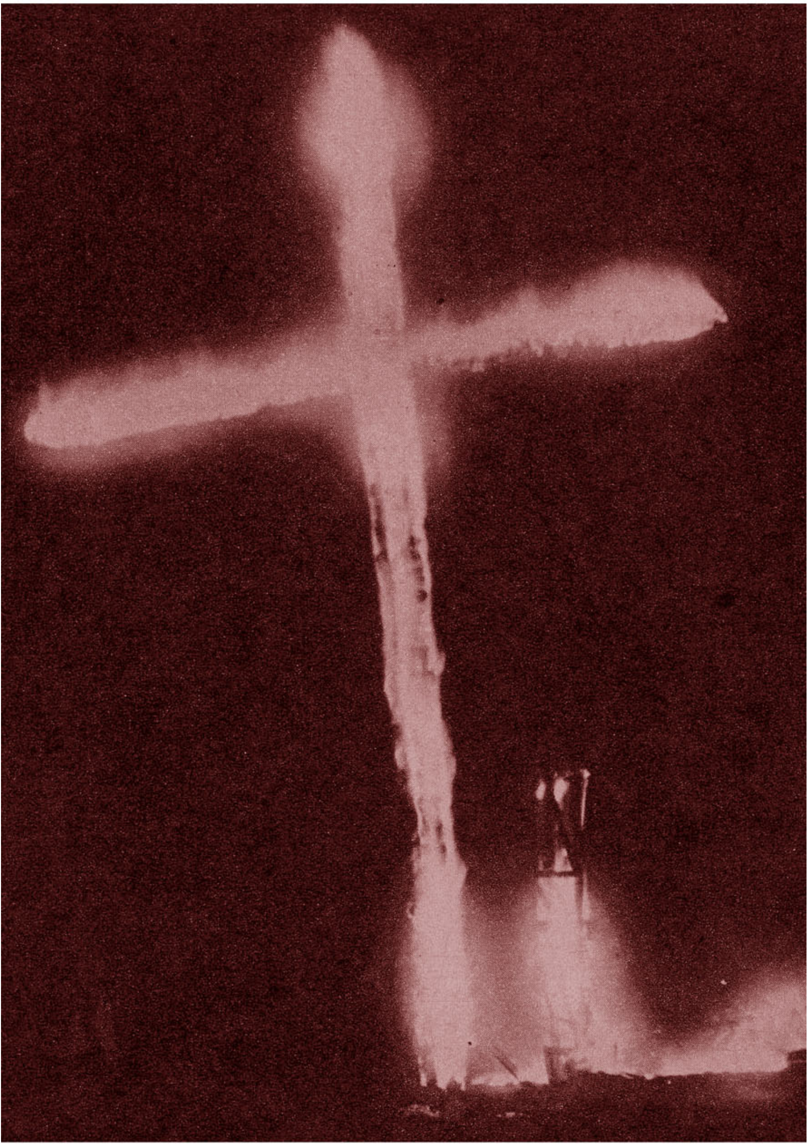
Flaming 100-foot high cross (above) marked the close of Freeport (N.Y.) Ku Klux Klansmen's first annual celebration. Hailed by 5,000 Klansfolk, sight was visible for miles.

Differing radically among themselves on other issues, prohibitionists, German-American beer-drinkers, Catholics, Protestants, cultists, rich people, poor people, white collar clerks and farmers are finding common ground, neverthe-