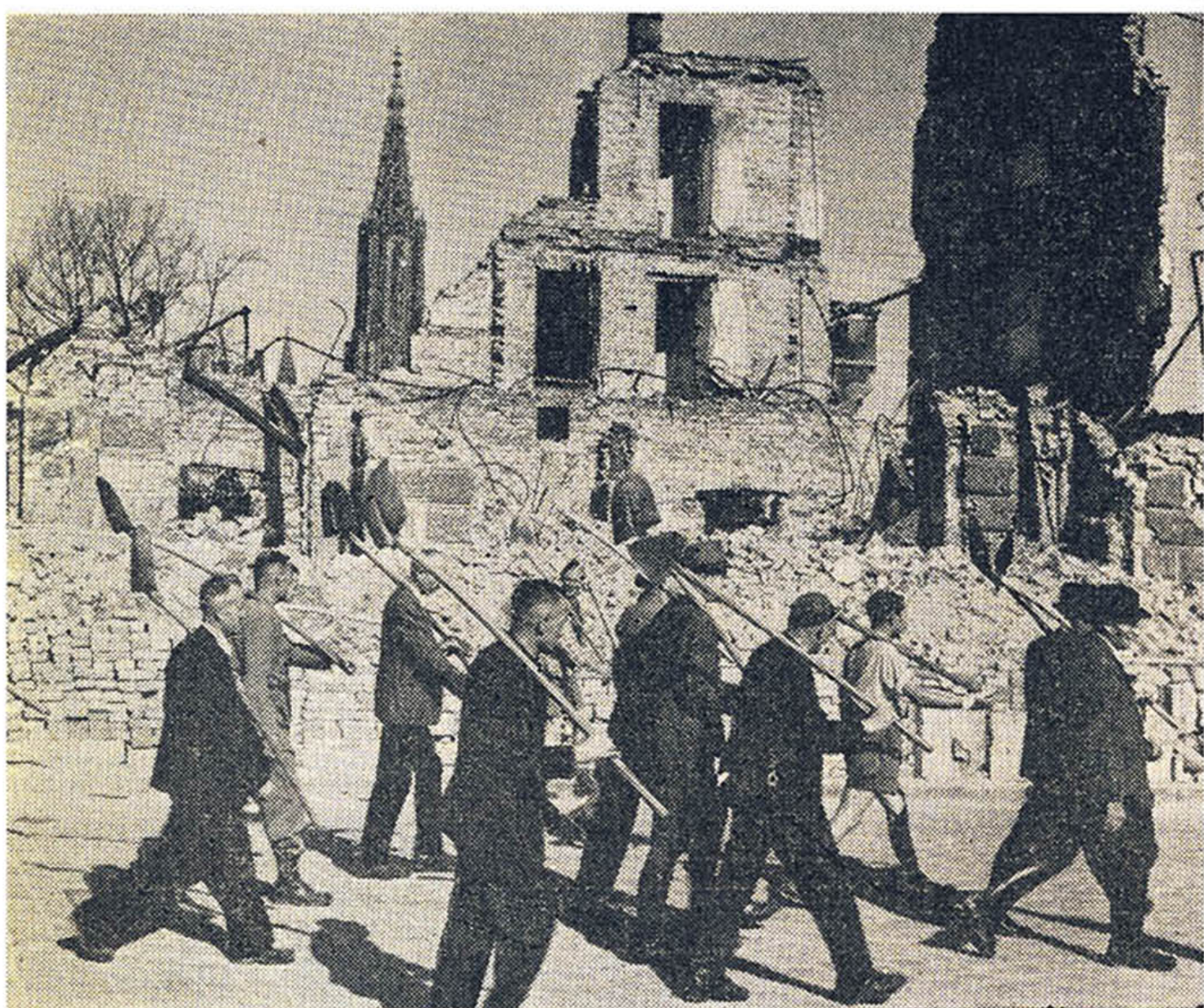
NAZIS WORK WITH SHOVELS