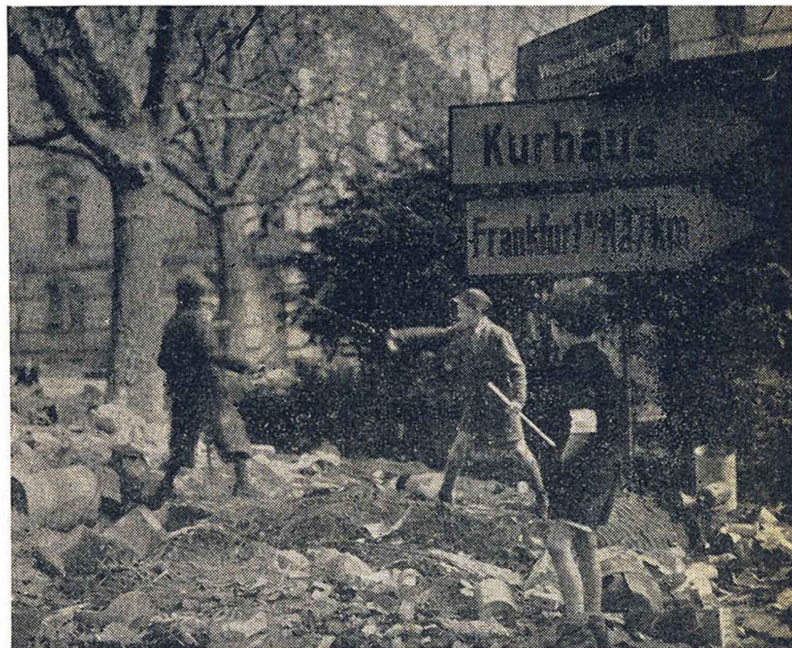
BOYS PLAY WITH NAZI SWORDS

... life for the German is bleak—for his conquerors, perplexing