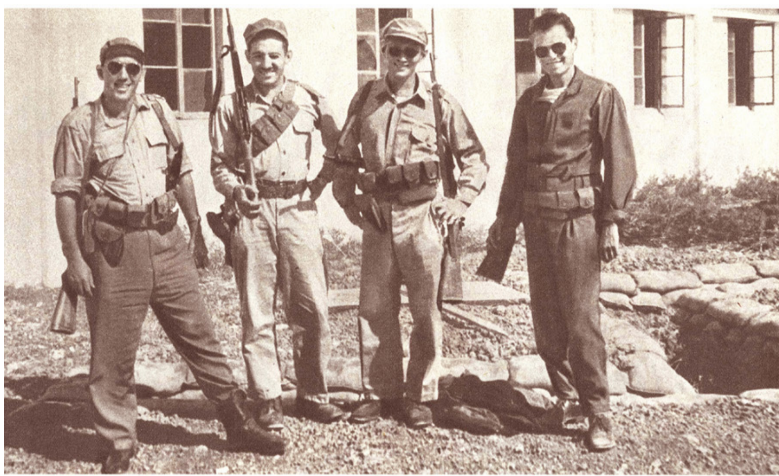
These are the kind of men you'll find in the Israeli Air Force. The author (right) says that the IAF, with very poor planes, easily outfought the Arabs

A veteran of our Air Force with Jewish blood tells why he fought for Israel, and why the Israelis, hopelessly outnumbered, won the war with the Arabs. His experiences taught him that the Palestinian Jews have been badly treated by the outside world, and he says, "The people of Israel are the most democratic in the world"