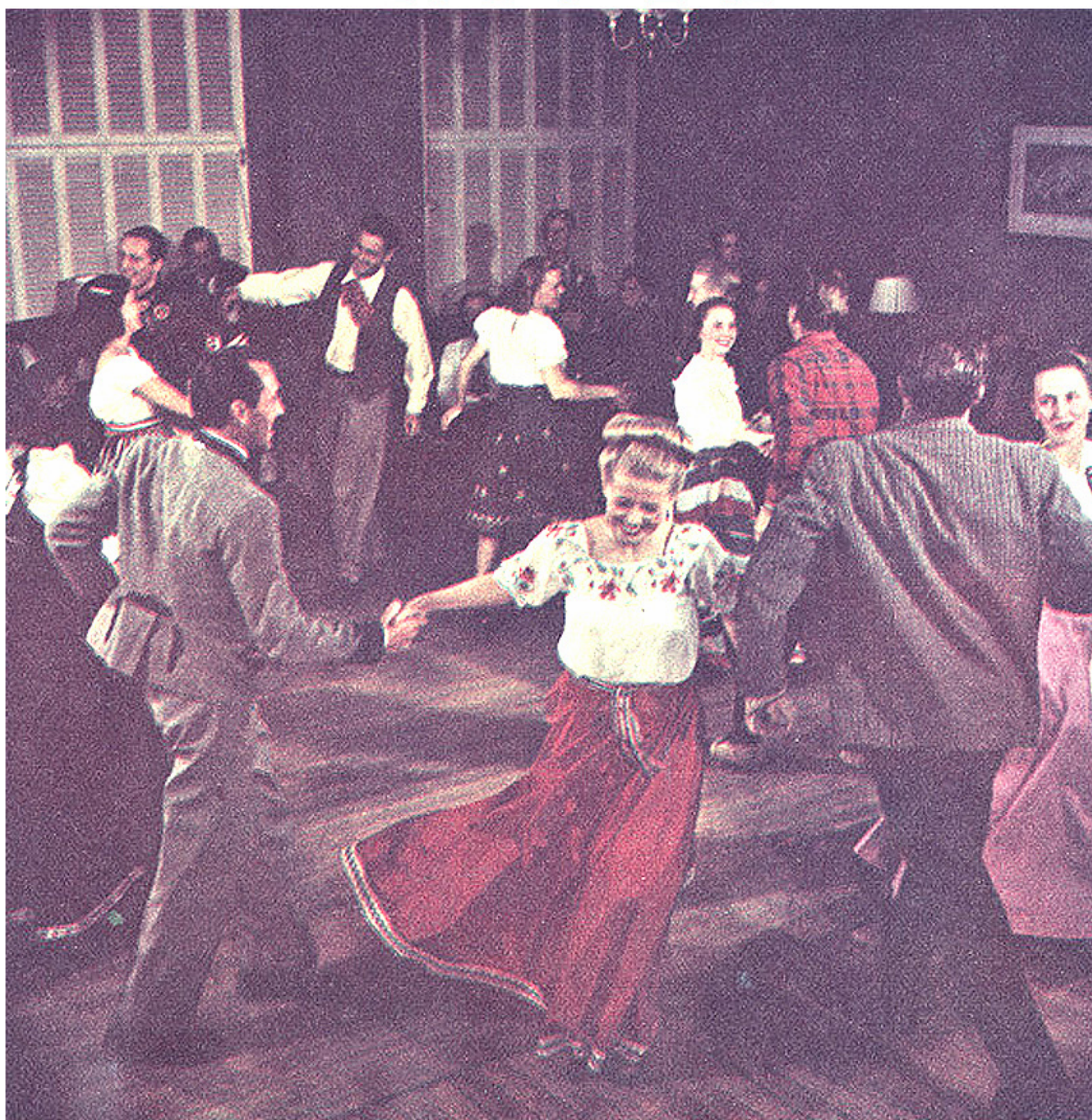
Square dancing in the Blue Room of the Hotel Jerome, center of the town's activities. The Jerome was built in 1889, nine years after Indians began to leave

fighters in long tights that adorn one wall and study the bunches of dried red onions flanking the mirror. Their talk, the mysterious jargon of the Schuss , Telemark and stem Christie, waxes fast and furious.