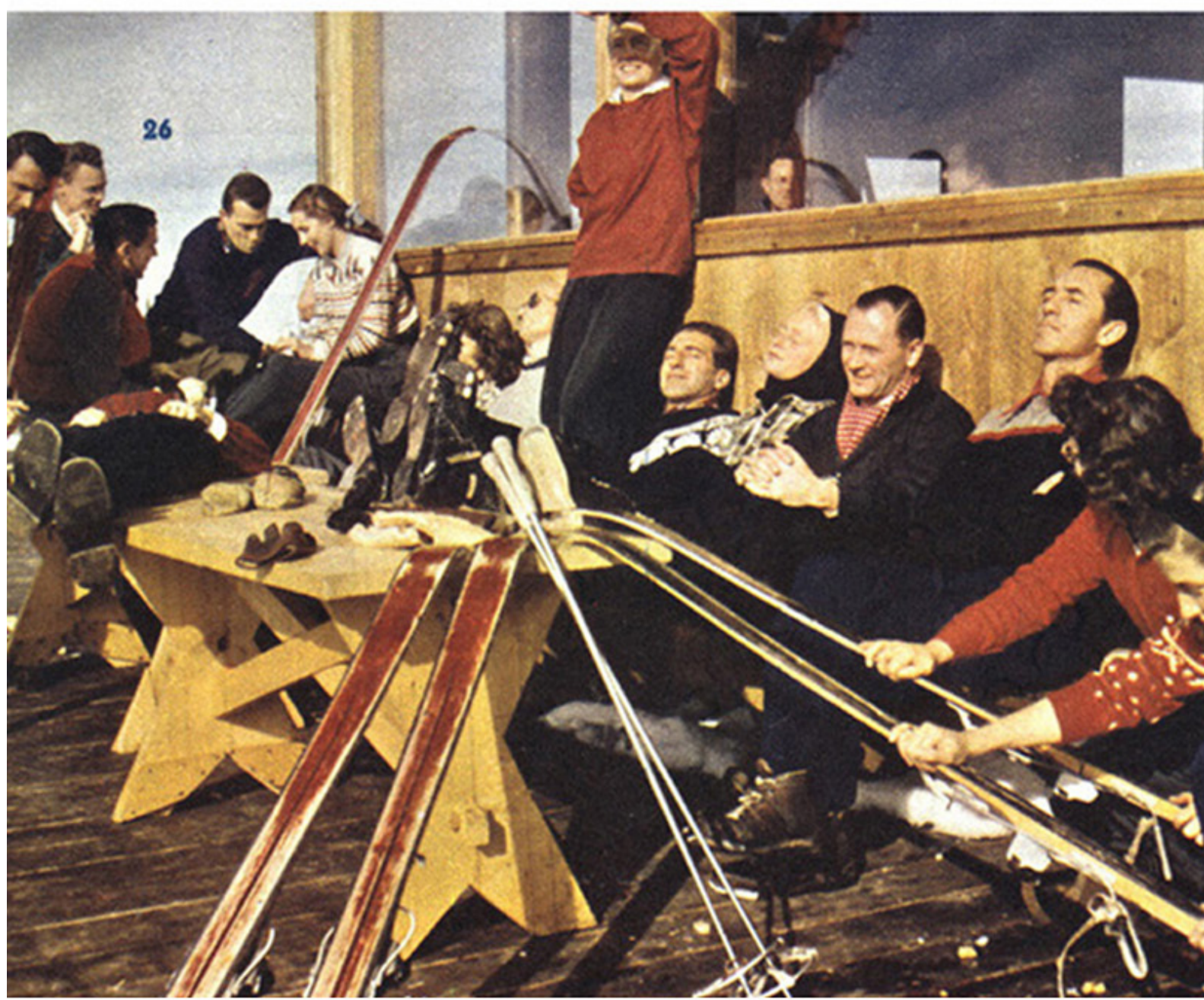
The Sundeck, at the summit of the 3-mile-long chair lift, the longest in the world