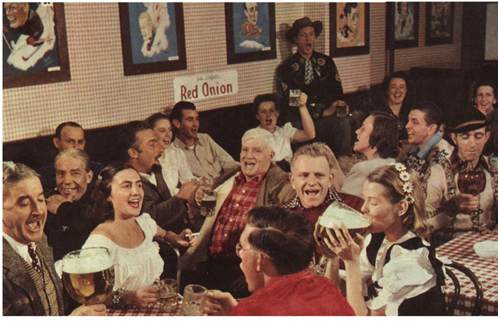
Night life in Aspen, where the Red Onion bar is a favorite meeting place for skiers, miners and townfolk. Credit it to skiing, which has remade the town

A SPEN is a tiny Colorado village tucked away in one corner of a lush green valley ringed by snowcapped peaks rising to altitudes of more than 14,000 feet. It is an old mining community in the midst of a turbulent transformation engineered by ex-G.I.s, ex-Wacs, artists, musicians, small businessmen and a wealthy Chicago industrialist.