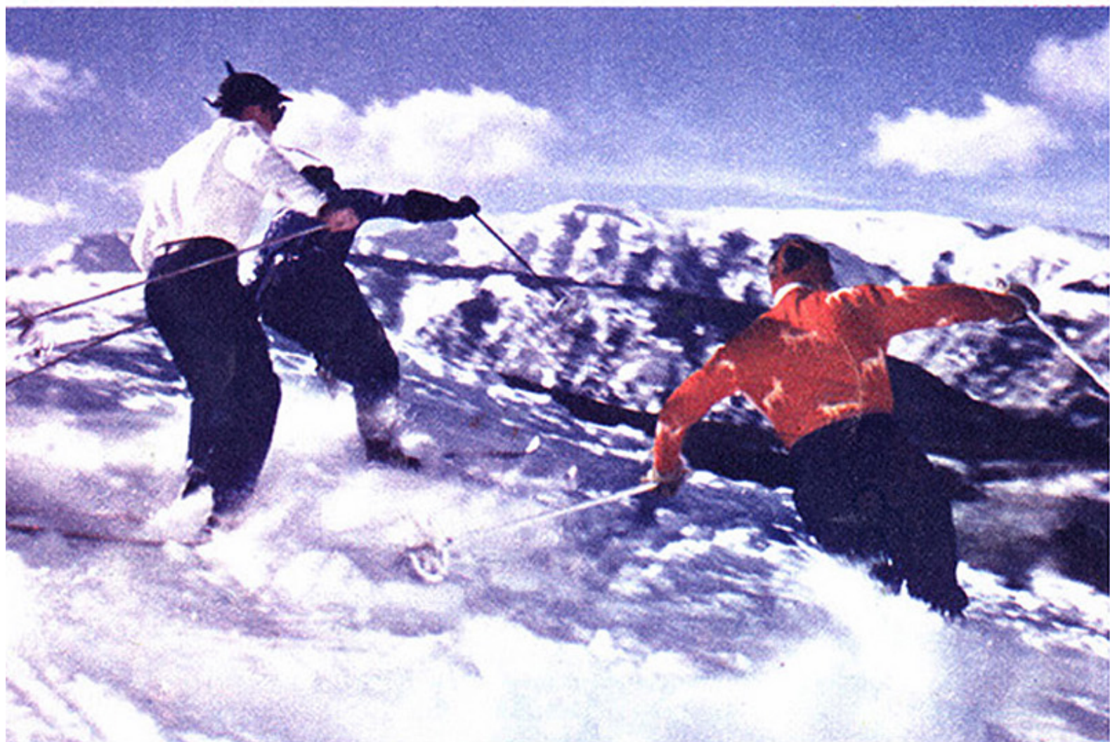
Deep powder-snow skiing on a slope of Ajax Mountain.

Throughout the winter, Pfeifer and his assistants explored the surrounding territory, cutting new trails and open slopes and enlarging the old ones. Miners and ski troopers worked side by side in the town and up on the mountains. A bulldozer reamed out old mining roads to form a network of connecting trails and runs. Early that spring came the climax of the effort. Up Aspen Mountains, at a cost of $250,000 was flung the longest ski chair lift in the world, extending three miles into the mountains.