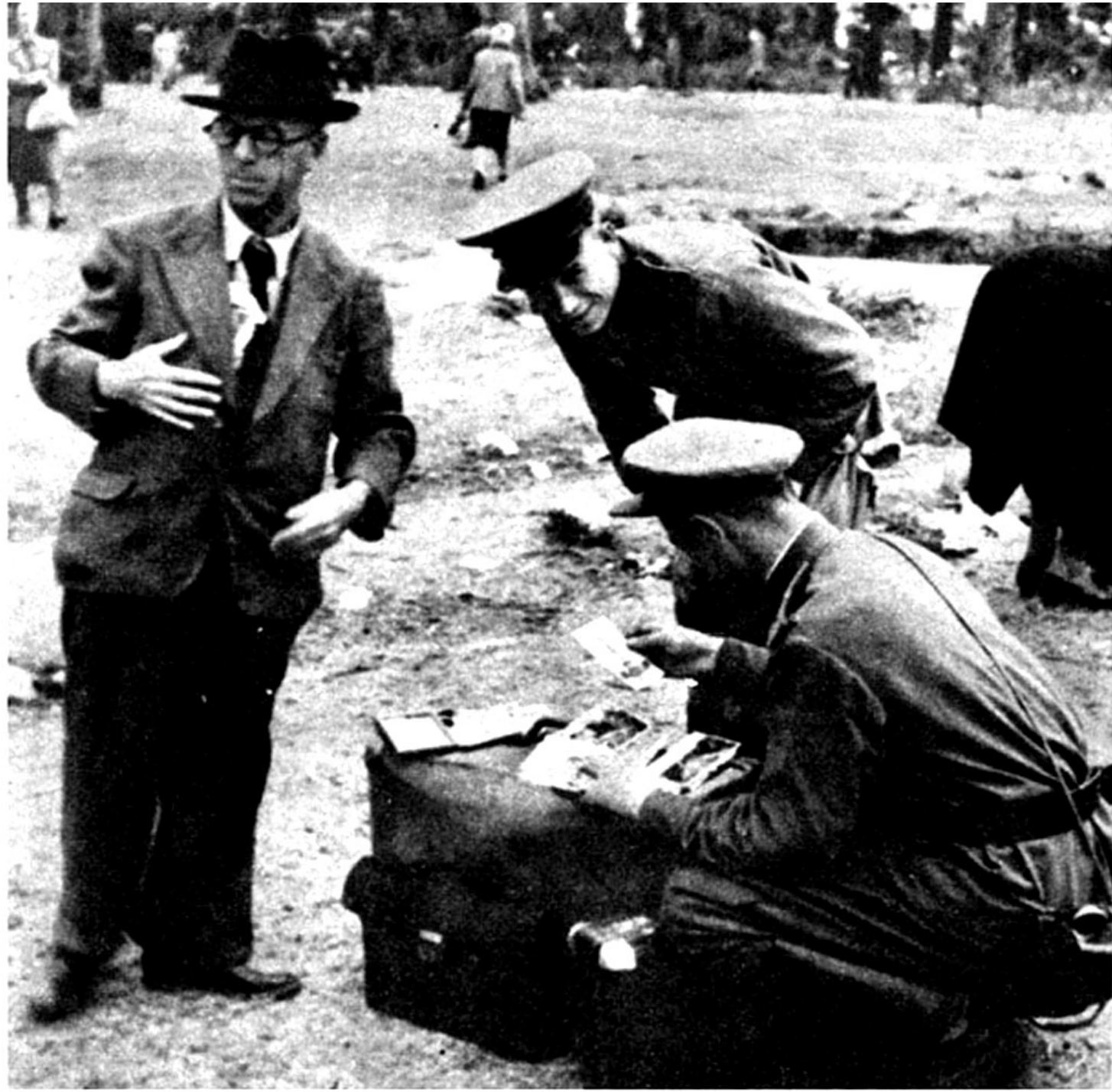
Russian secret policemen, agents of dreaded MVD, examine photographs found on spy suspect, stopped during raid in Tiergarten, center of espionage black market.

These men—and women—are not spies in the conventional sense of the term. They are what is known in Intelligence lingo as "confidential informants."