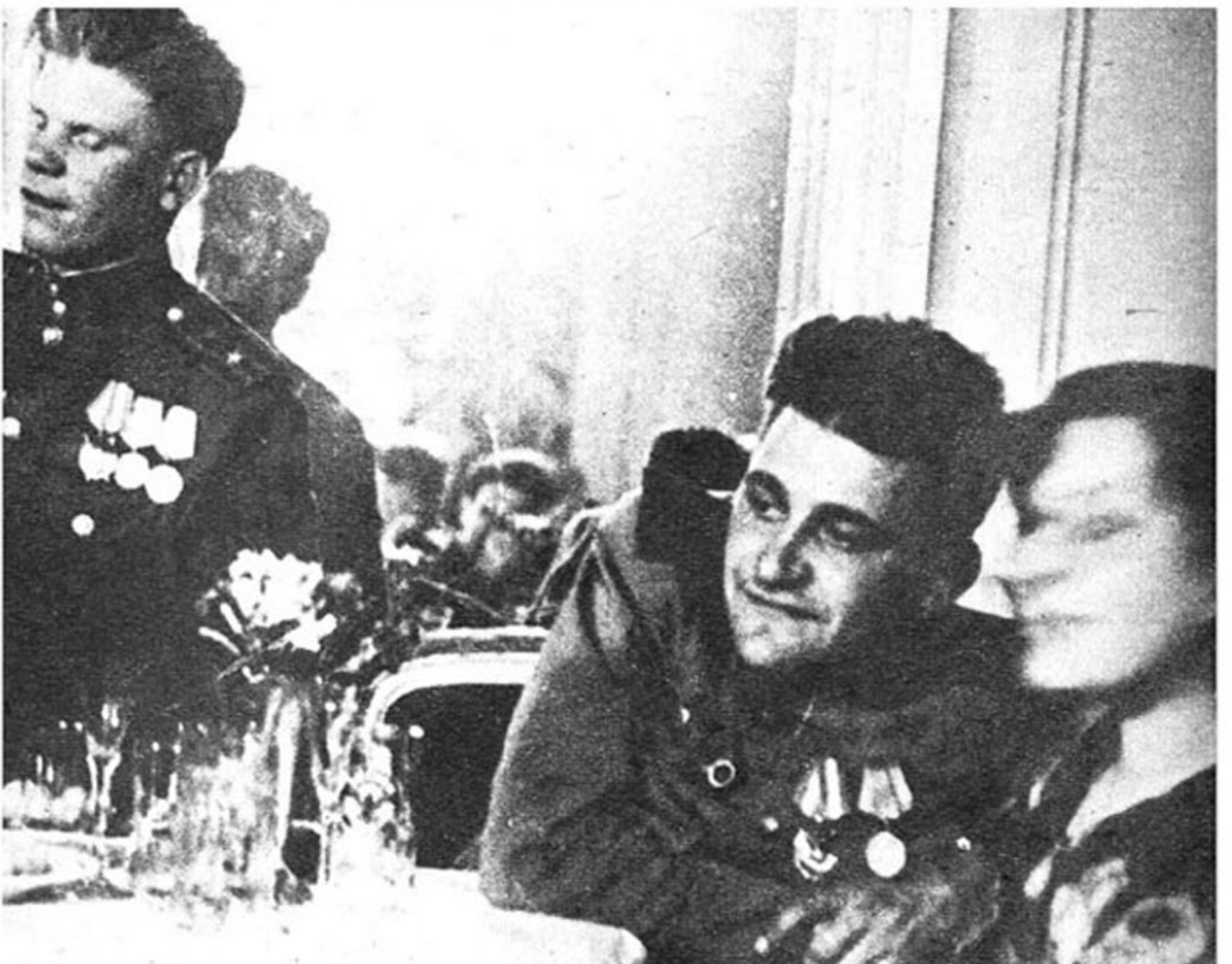
Landid camera in Berlin's swanky Cafe Femina, clearing house of spy secrets, catches Russian officers, blurs girl operative who moved to escape identification.