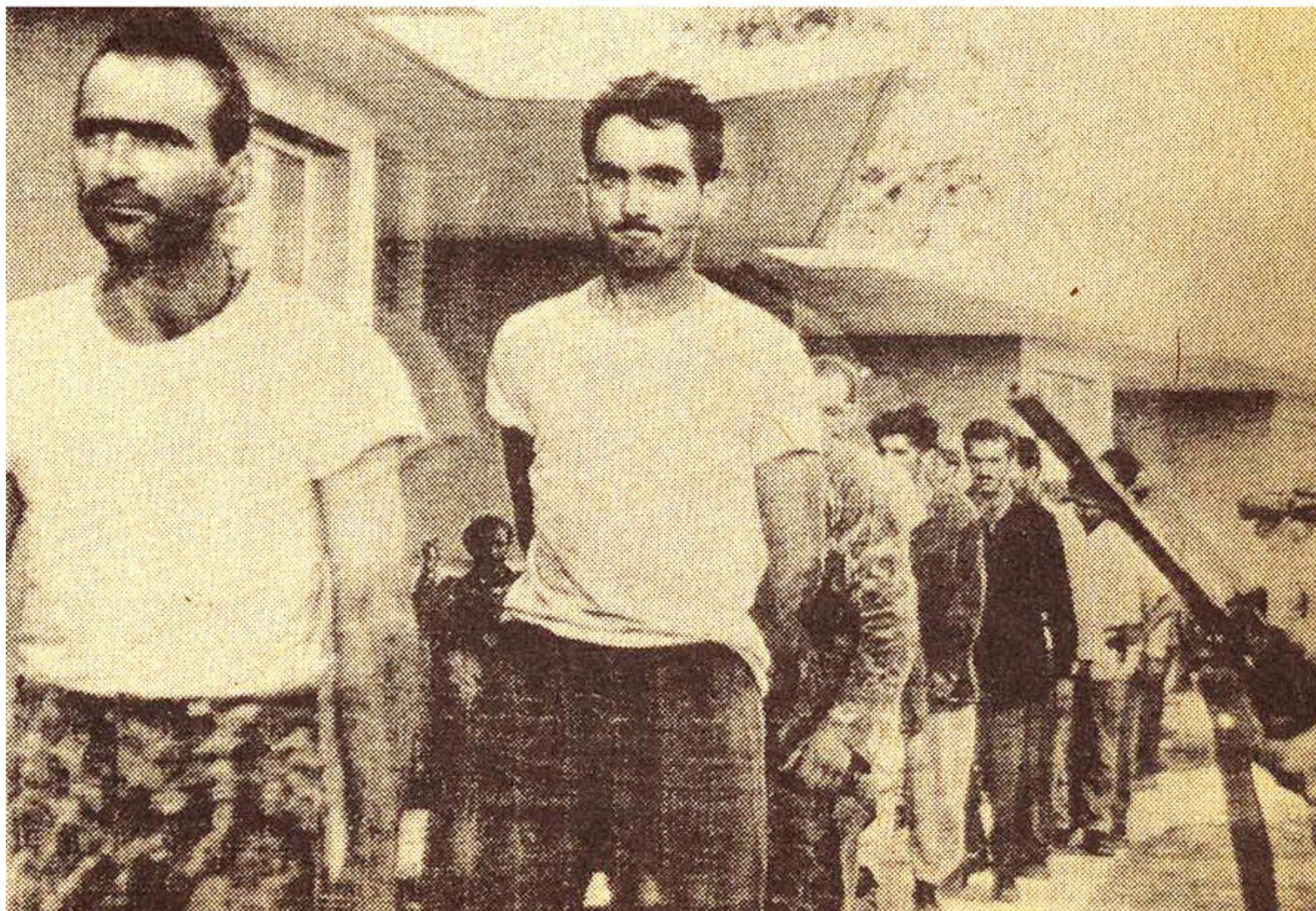
Grim-faced patriots, captured in invasion, are marched to prison. An estimated 1200 were taken prisoner by Castro.

officially but secretly was prepared to do everything possible to restore freedom and liberty to Cuba.