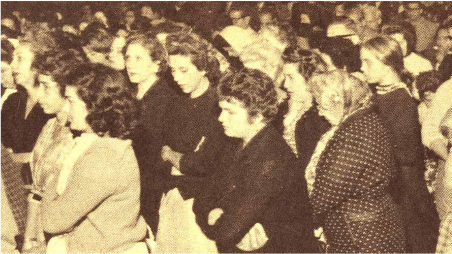
Cuban women in Miami kneel in prayer for loved ones lost in the disastrous April 1961 invasion of Cuban mainland.